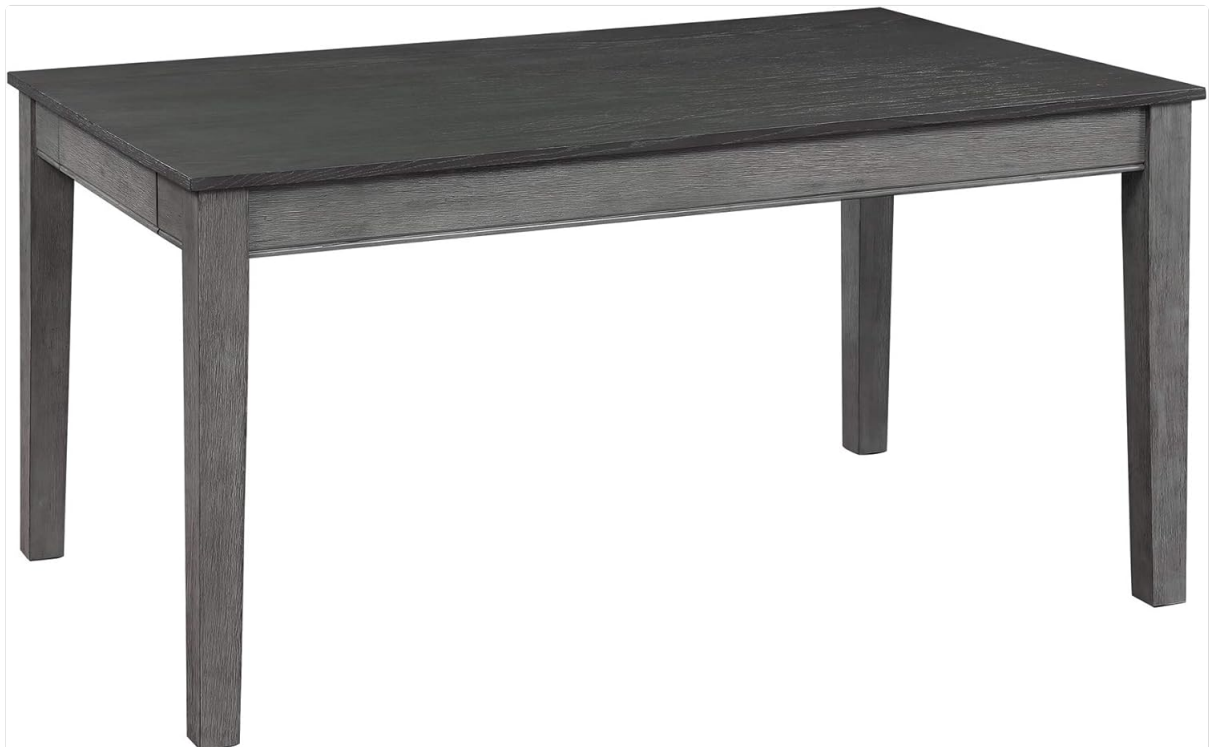
Image 1.1: The Homelegance Blair 60-inch Dining Table in Grey, showcasing its rectangular design and wire-brushed finish.

The Homelegance Blair dining table is designed to provide a functional and aesthetically pleasing centerpiece for your dining area. Crafted from Asian hardwood with an oak veneer and a wire-brushed grey finish, it offers durability and style. The table includes two integrated end drawers for convenient storage.