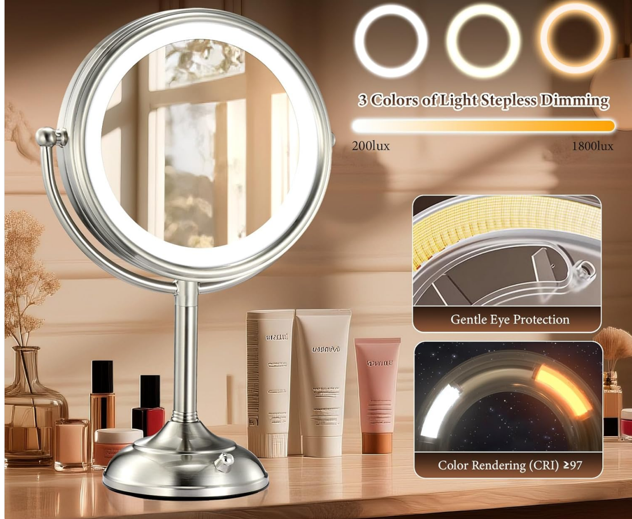
Image 3: Visual representation of the three light color modes and brightness adjustment range.