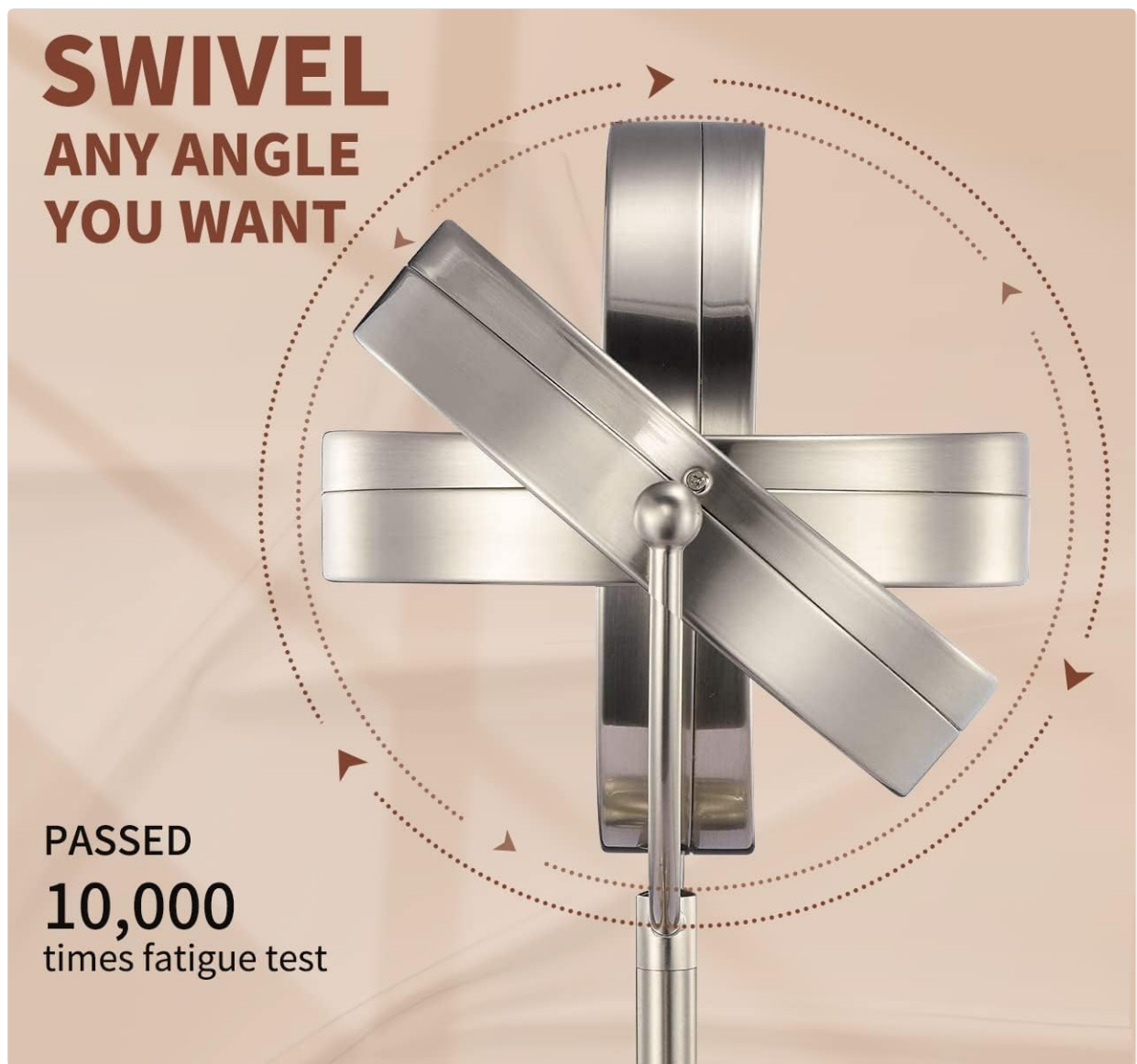
Image 5: Diagram showing the 360-degree swivel capability of the mirror.