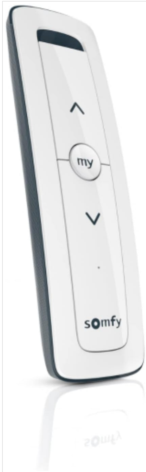
Image: Somfy Situo Pure II RTS Single Channel Remote, showcasing its sleek white design with up, down, and 'my' buttons.