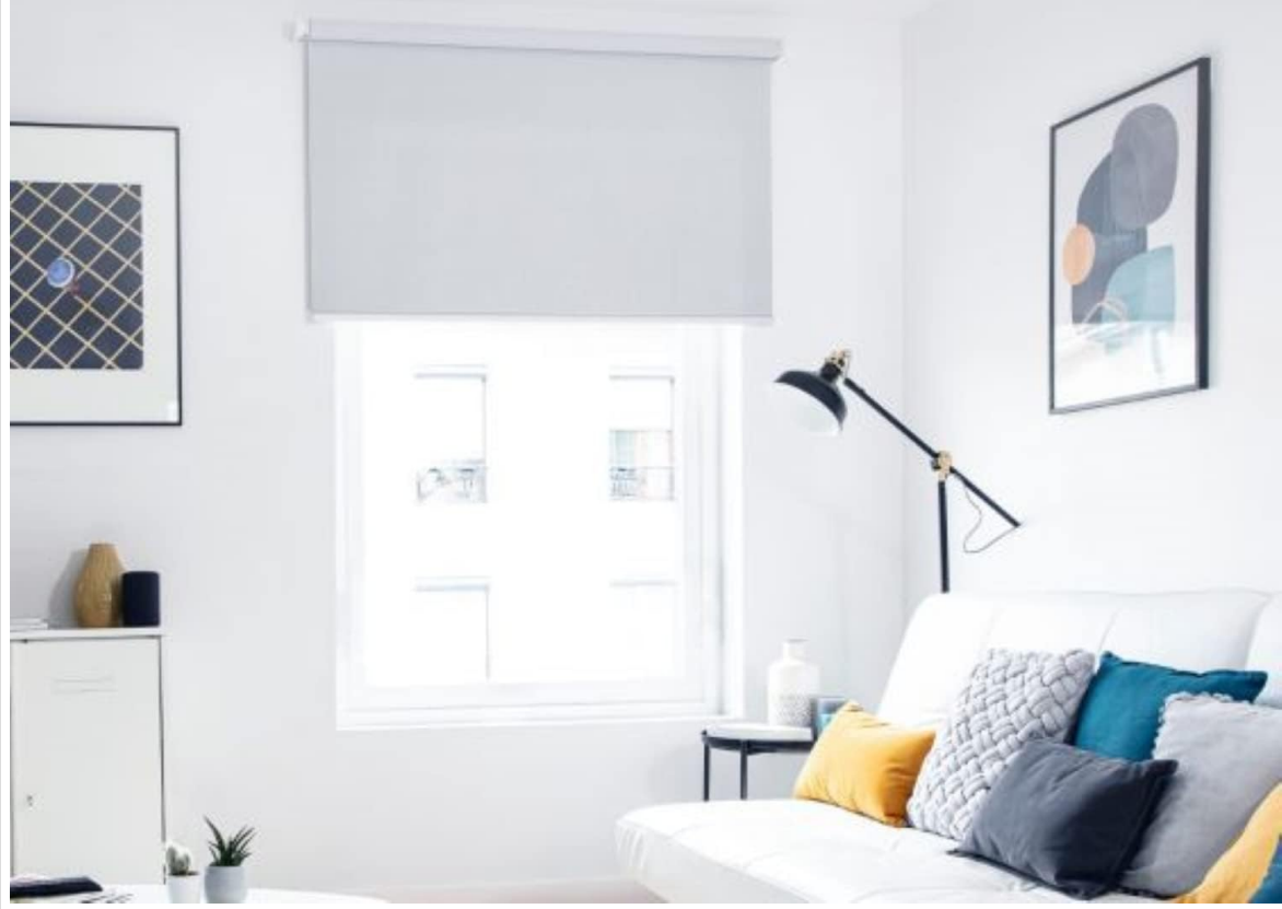
Image: A living room scene showing a single window shade, illustrating the remote's single zone control capability.