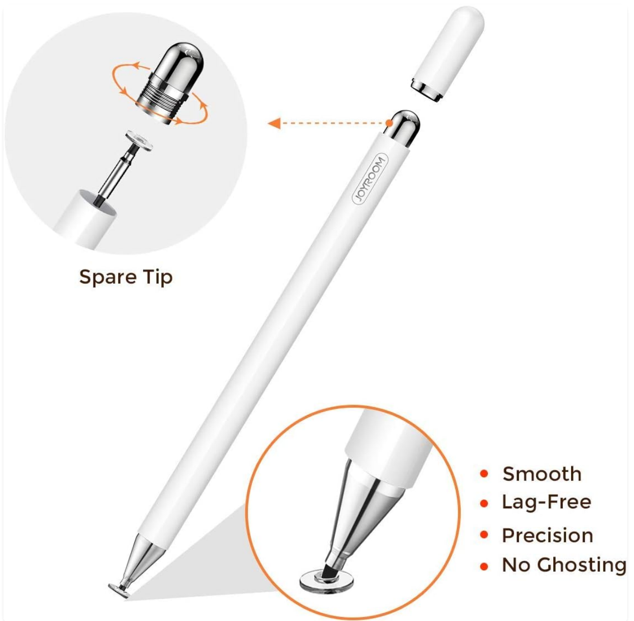
Image: A diagram illustrating the process of replacing the stylus tip. It shows the cap being removed, the old tip being pulled out, and a new tip being inserted.

Your browser does not support the video tag.