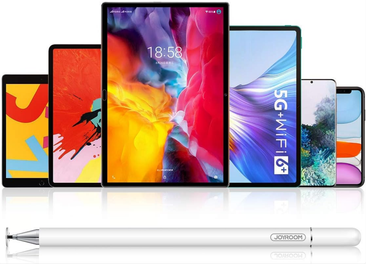
Image: The JOYROOM Stylus Pen shown alongside various compatible touch screen devices, including tablets and smartphones, illustrating its broad compatibility.