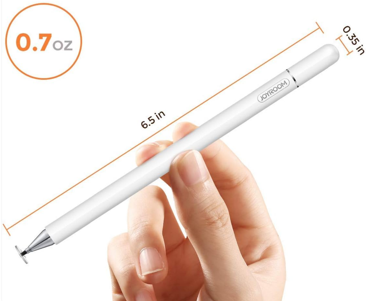
Image: A hand holding the JOYROOM Stylus Pen, with annotations indicating its length (6.5 inches) and diameter (0.35 inches), highlighting its lightweight design at 0.7 oz.

It's light enough that you kid doesn't have to have a death grip on it and cramp hand