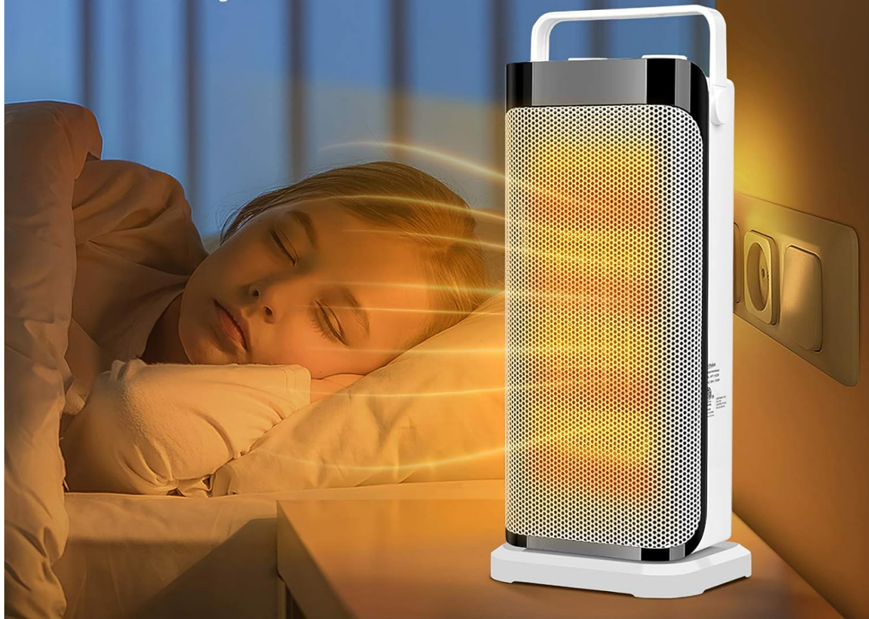
Figure 7: Quiet and No-Light Design