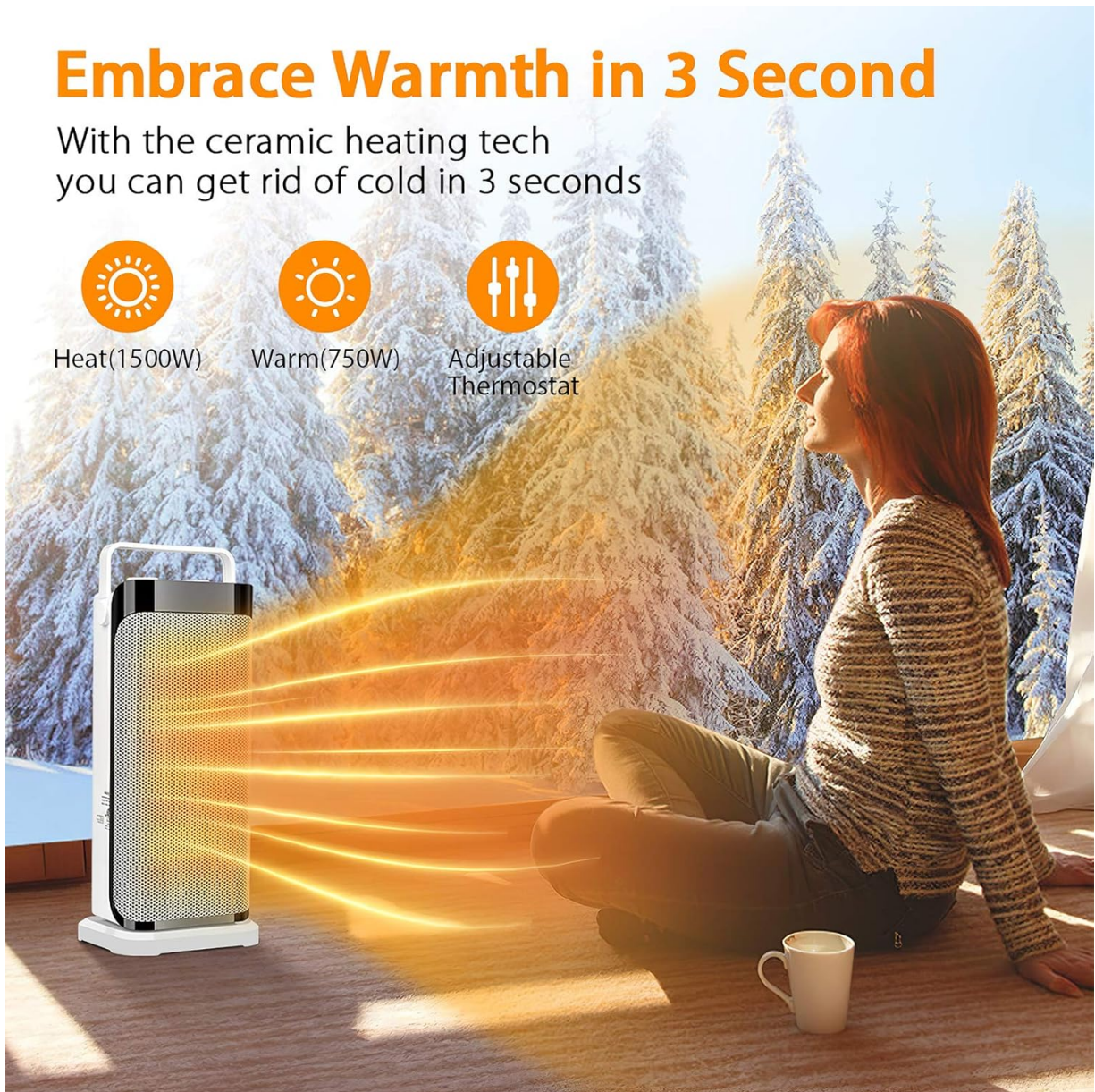
Figure 3: Fast Heating Capability