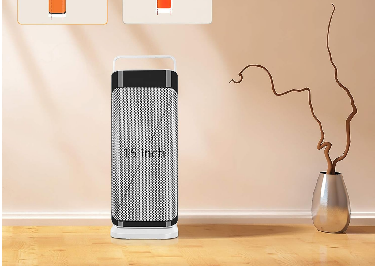
Figure 5: Large Warm Air Outlet Design