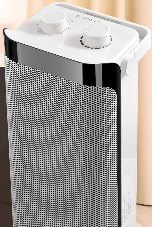
Figure 6: Smart Thermostatic Control