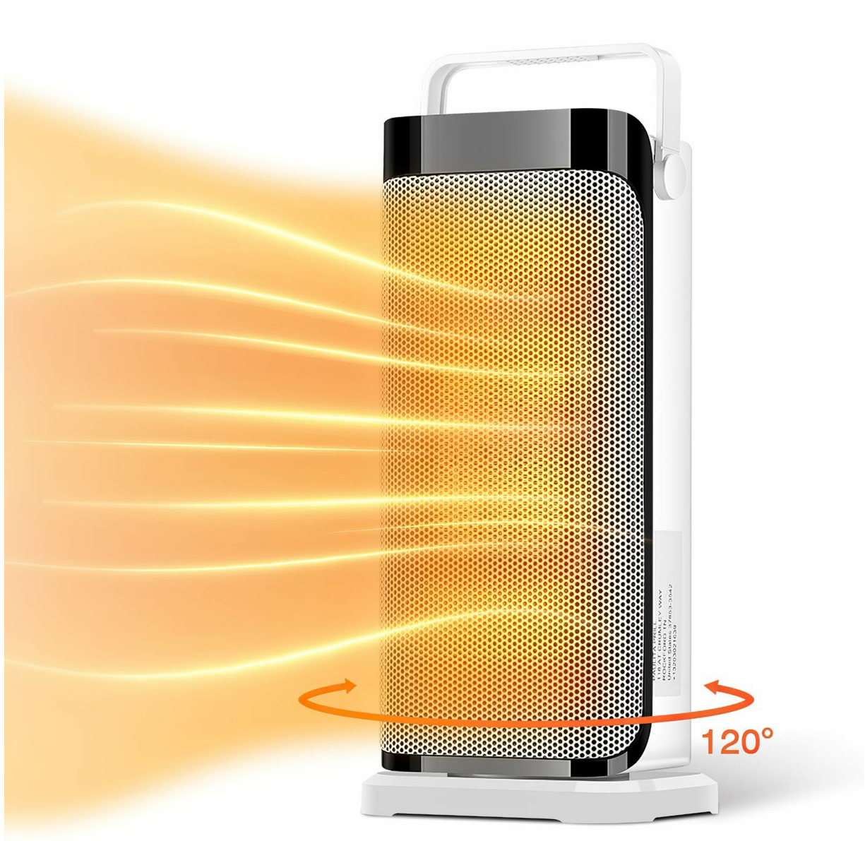
Figure 1: Air Choice KPT-1502M Portable Ceramic Tower Space Heater