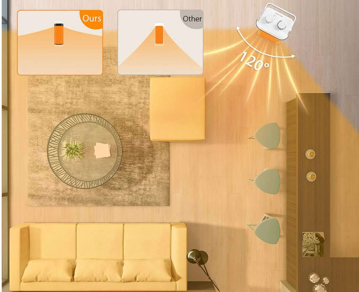
Figure 4: 120° Widespread Oscillation