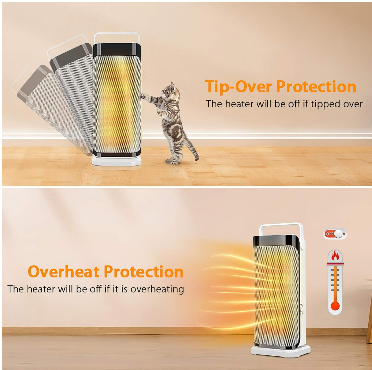
Figure 2: Overheat and Tip-Over Protection