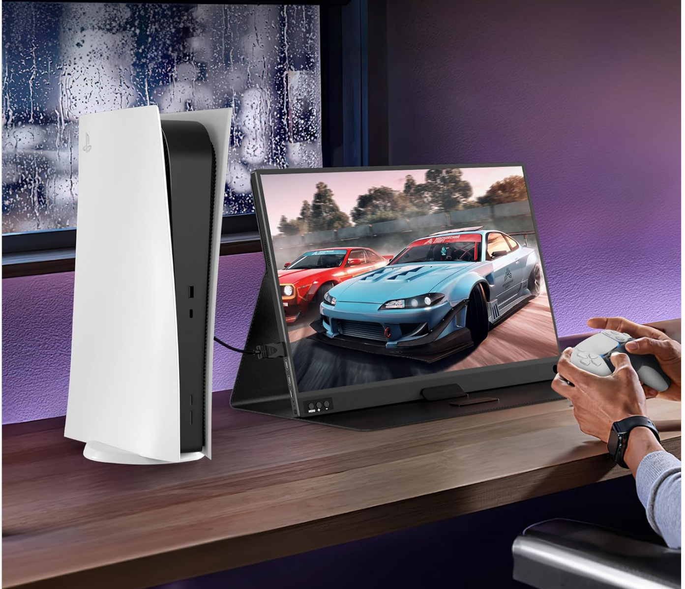
Image: The ZSCMALLS Portable Monitor connected to a PlayStation 5, showcasing its "Gaming Ready" feature for an immersive gaming experience on the go.

Compatible with Nintendo Switch, XBOX, PS4