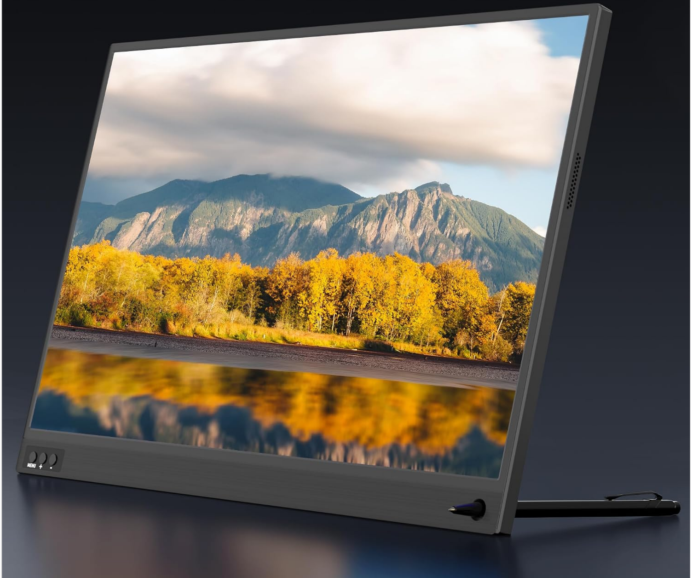
Image: The ZSCMALLS Portable Monitor utilizing its unique pen hole feature, where a pen can be inserted to prop up the monitor, offering an alternative stand solution.

Easily to Use a Pen to Make it Stand for You