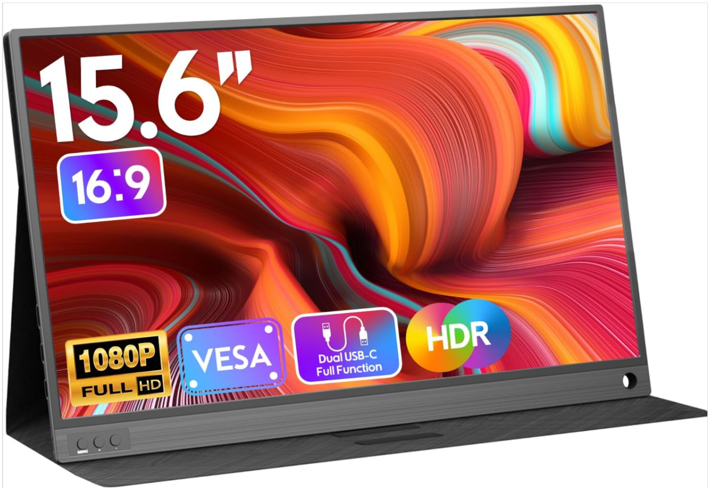
Image: The ZSCMALLS Portable Monitor set up with its smart cover acting as a stand, showcasing its compact design and high-resolution display.