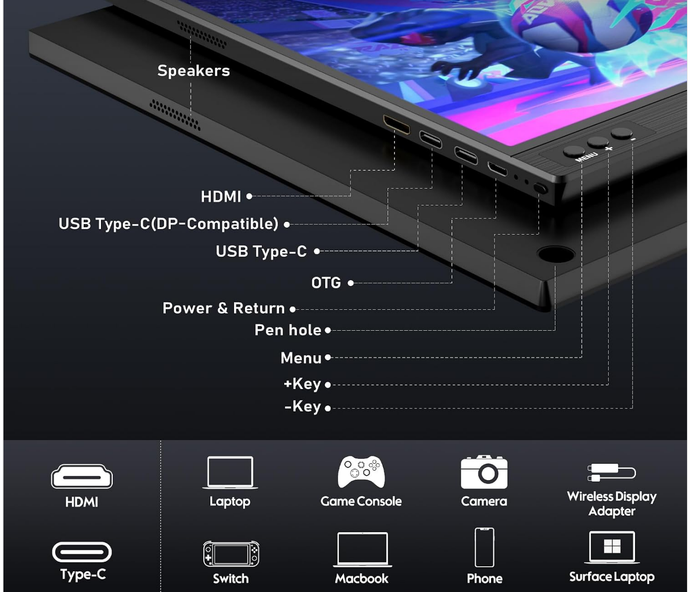
Image: Detailed view of the ZSCMALLS Portable Monitor's ports and control buttons, including USB-C, Mini-HDMI, and a pen hole for stand functionality.

Work Perfectly with Laptop/tablet, PC, Phone, Switch/PS4/Xbox.etc.