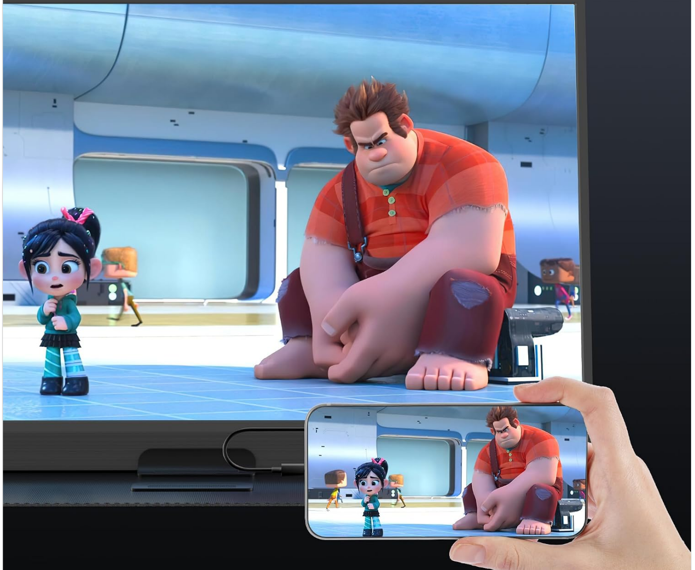
Image: The ZSCMALLS Portable Monitor extending a smartphone's display, allowing users to view mobile content on a larger screen.

Extend your phone screen anytime, anywhere.