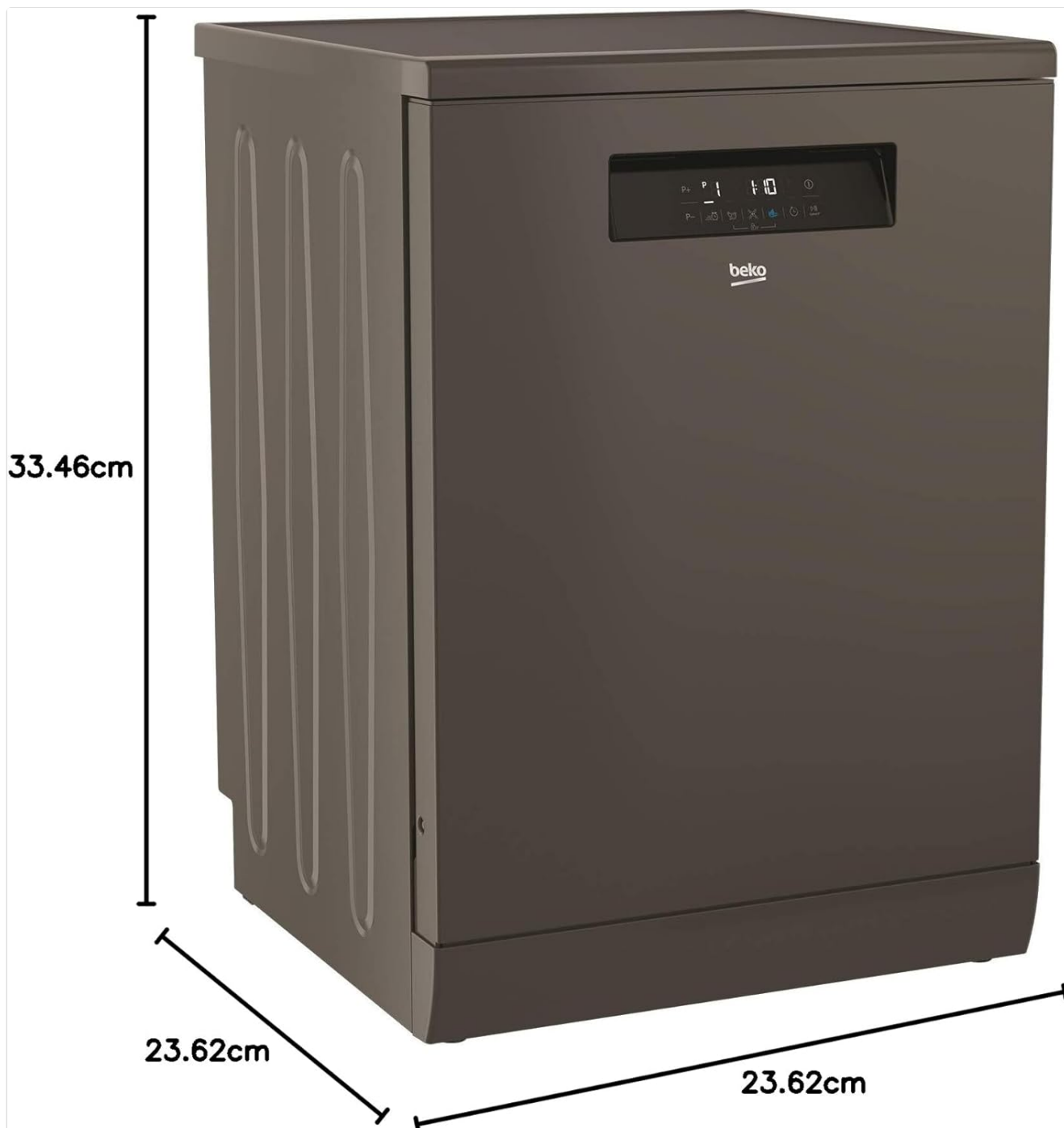
Image: Diagram showing the dimensions of the BEKO DFN39533G Dishwasher.