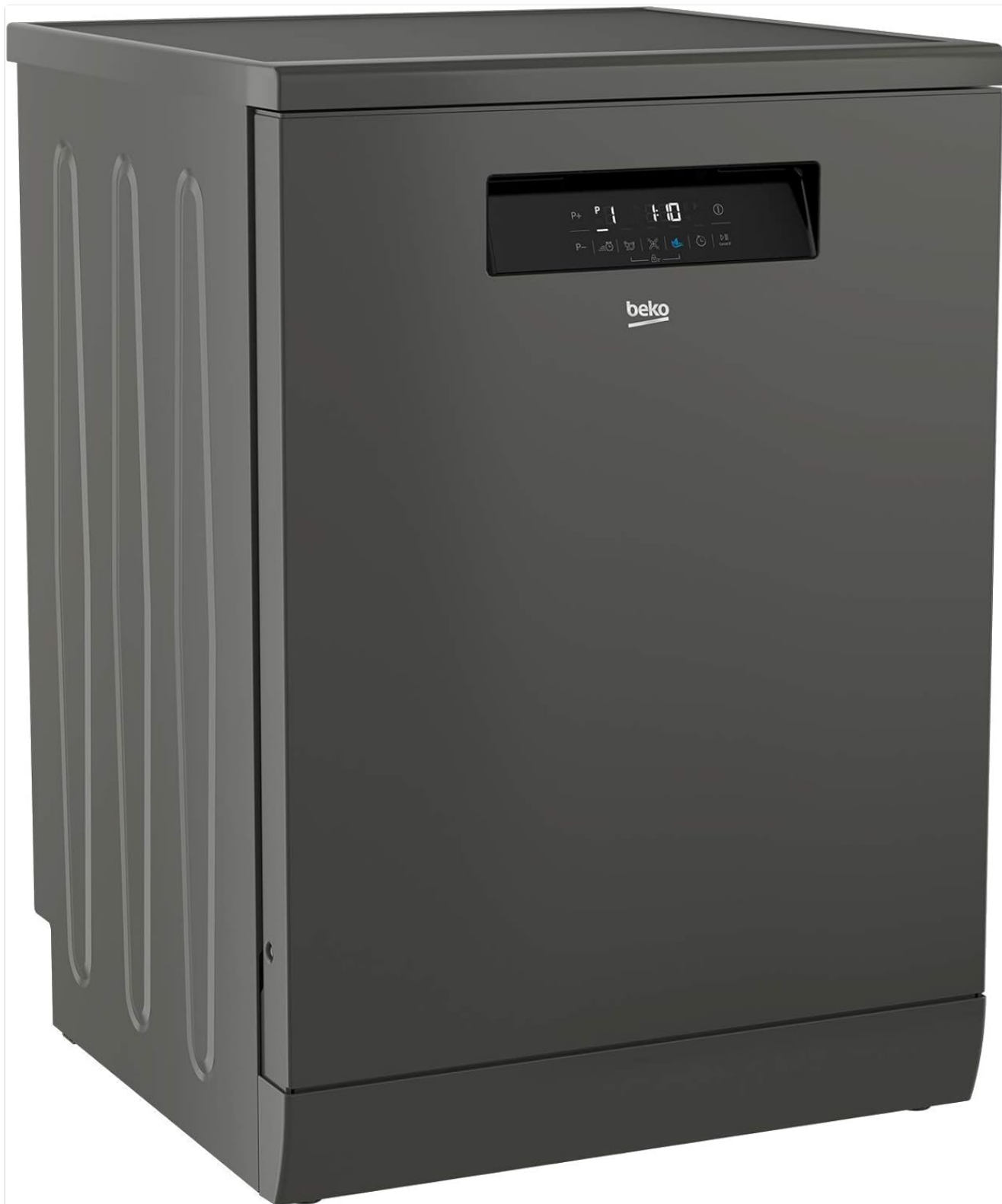
Image: Close-up of the control panel on the BEKO DFN39533G Dishwasher, showing program indicators and digital display.

salt, rinse aid, and selected program. Familiarize yourself with the layout before first use.