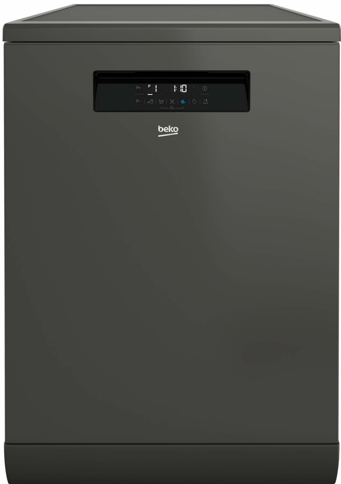
Image: Front view of the BEKO DFN39533G Freestanding Dishwasher in Manhattan Grey.