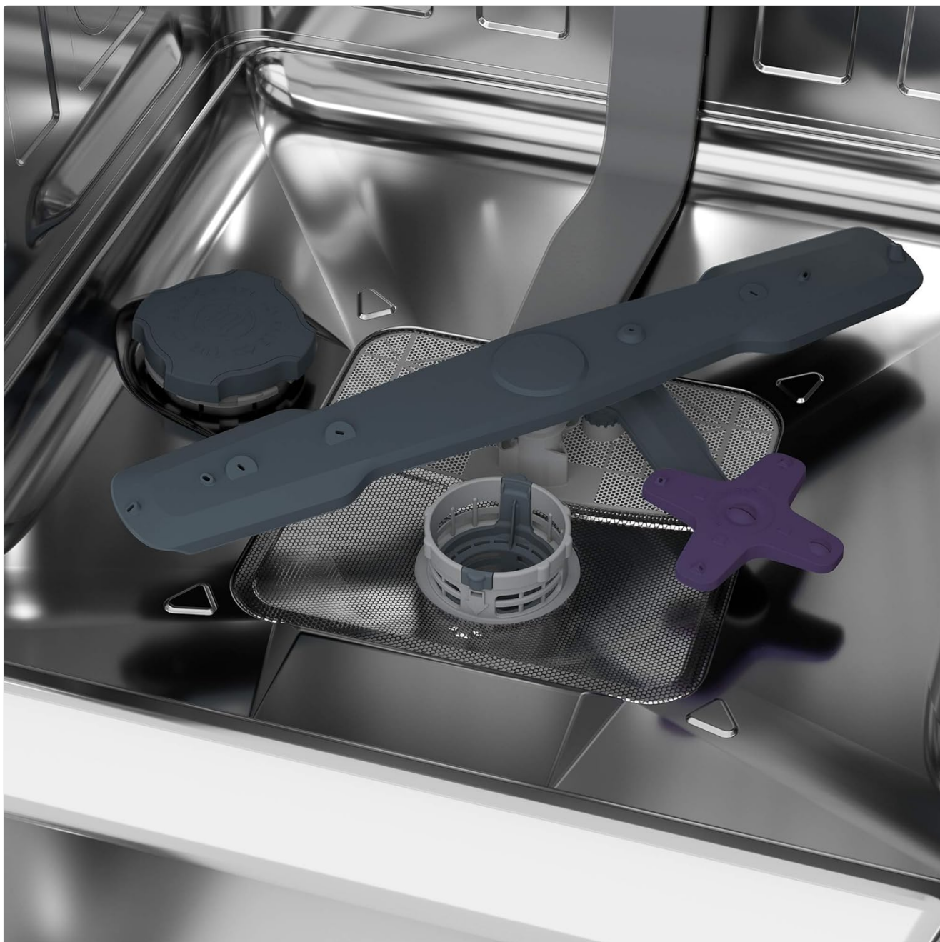
Image: Close-up view of the filter assembly and spray arm at the bottom of the BEKO DFN39533G Dishwasher tub.