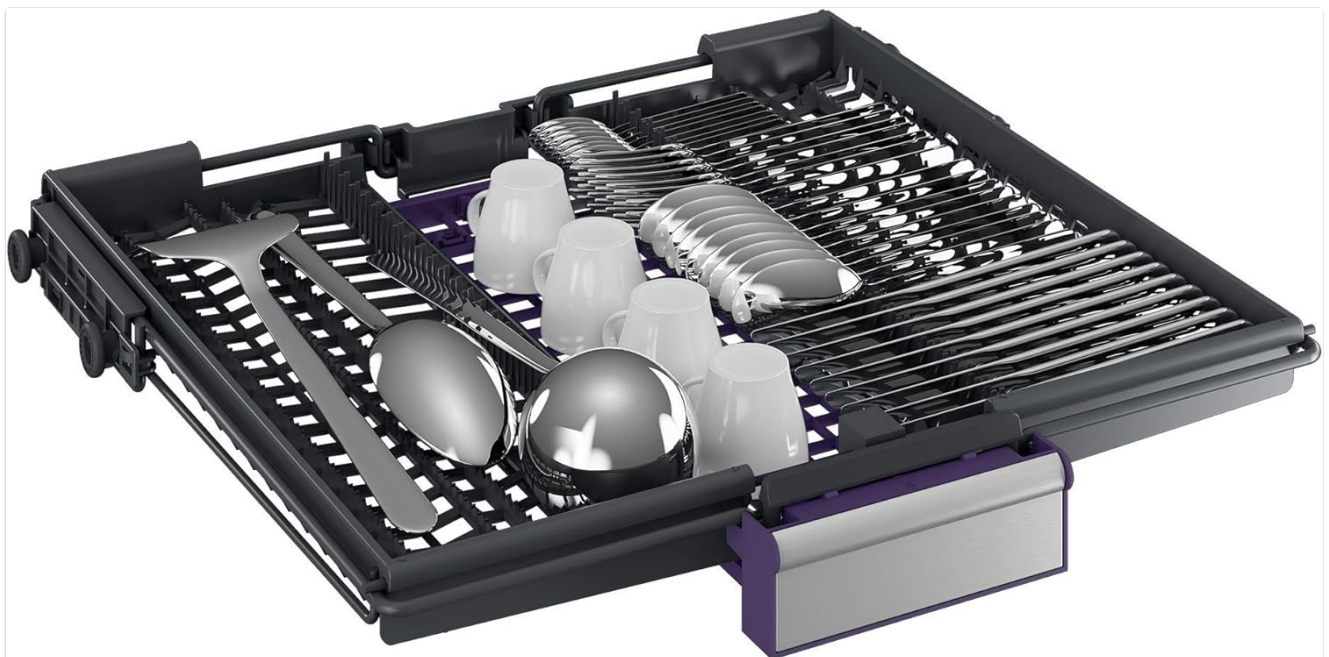
Image: The upper rack of the BEKO DFN39533G Dishwasher, showing glasses and cups arranged for washing.