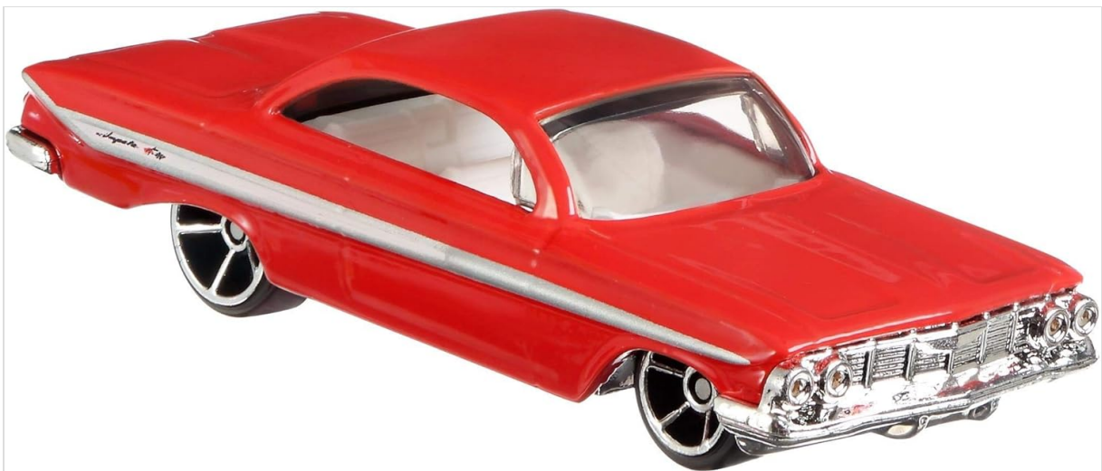
Image: The Hot Wheels '61 Chevrolet Impala die-cast car, showcasing its red exterior, white interior, and detailed chrome grille and bumpers.