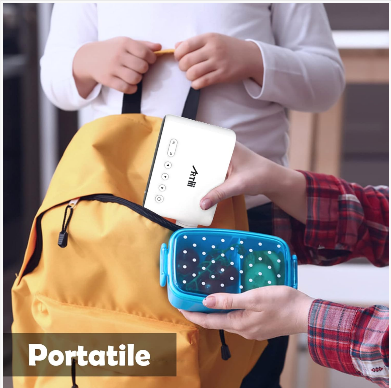
Figure 3.4: Demonstrating the projector's portability, easily fitting into a backpack.