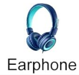
Figure 6.1: Examples of devices that can be connected to the Artlii Q Mini Portable Projector.