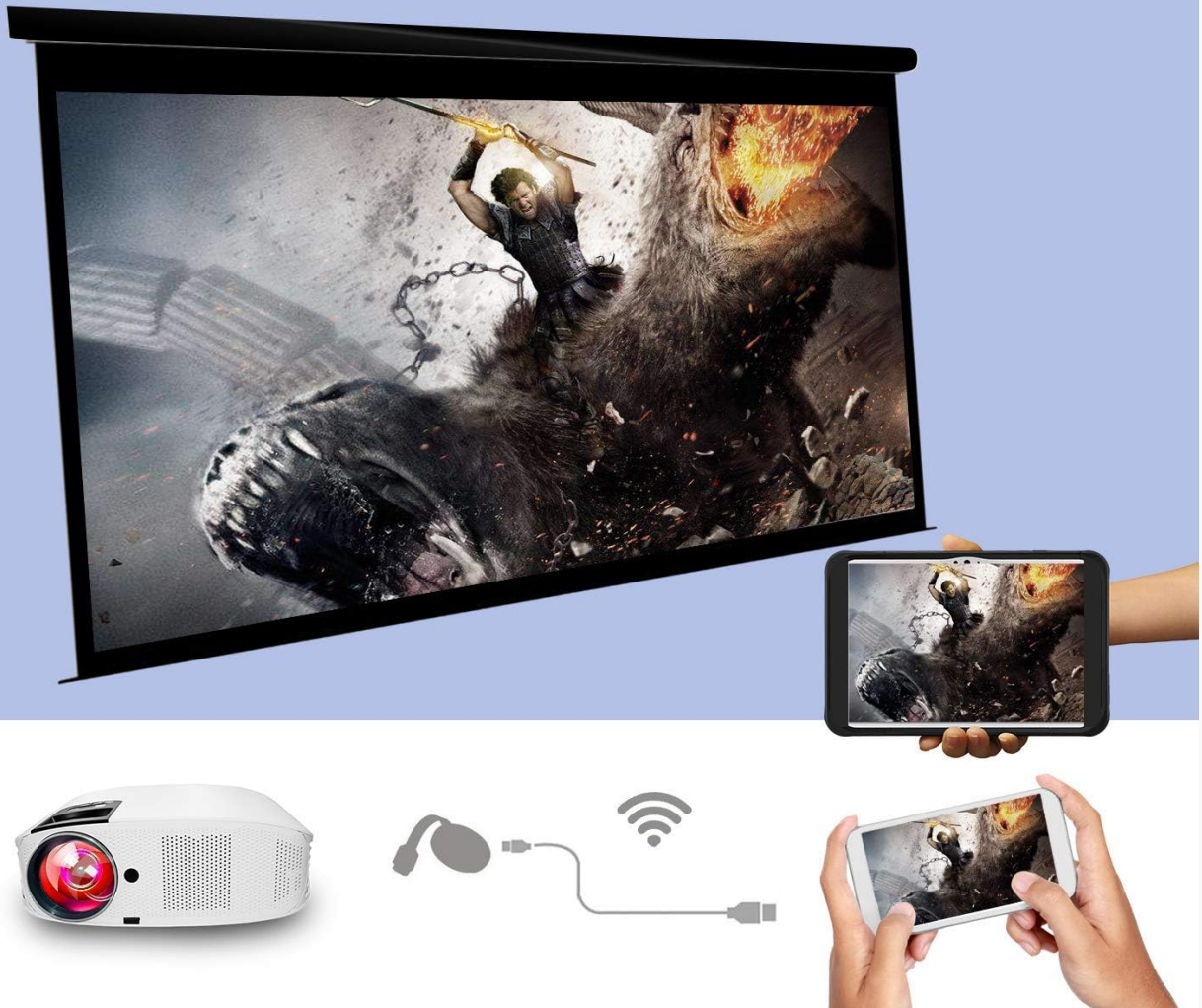
Figure 6.2: Further compatible devices and an illustration of connecting phones/tablets via a separate WiFi display dongle (not included).

Need a wifi display dongle( Not included)