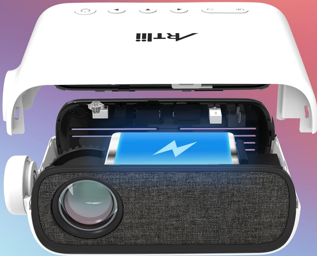
Figure 3.3: The projector's internal battery, providing portable power for extended use.