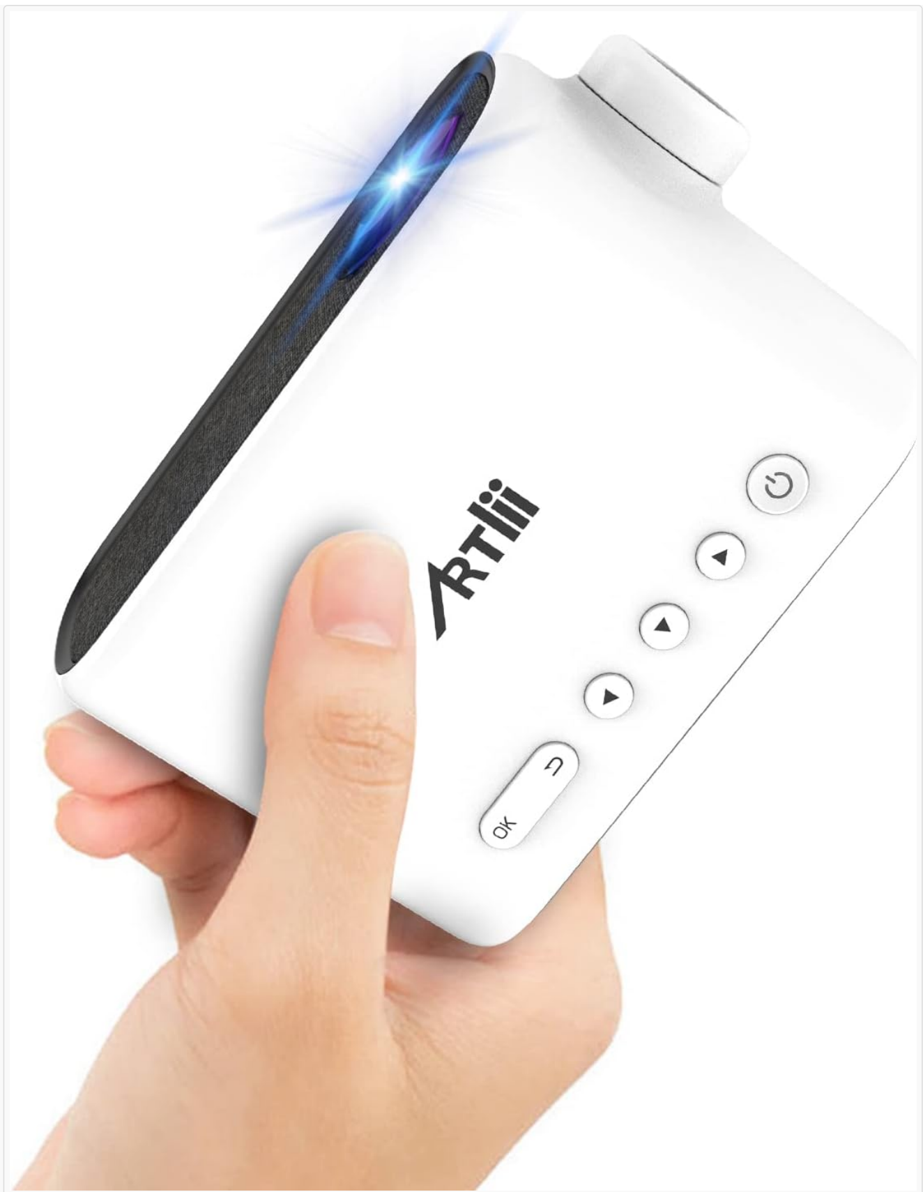
Figure 3.1: Front and top view of the Artlii Q Mini Portable Projector, highlighting the lens and control buttons.