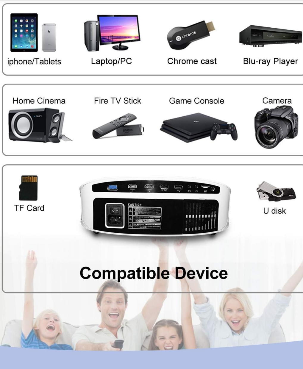
Figure 3.2: Rear view of the projector, illustrating the various input and output ports available for connectivity.