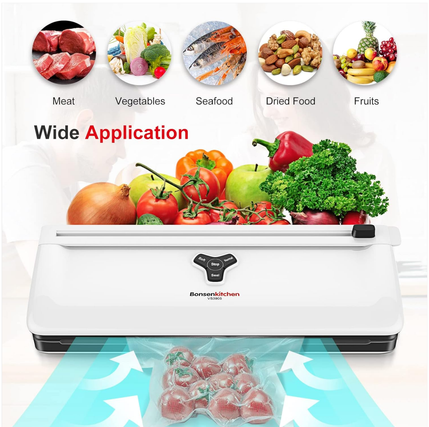
Figure 5: Examples of various food types that can be vacuum sealed, including meat, vegetables, seafood, dried food, and fruits.