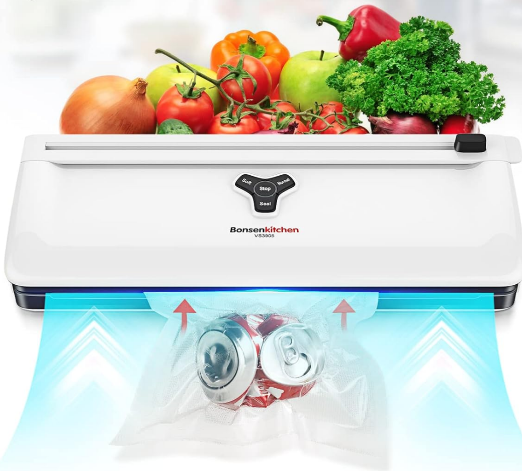
Figure 4: The vacuum sealer in action, demonstrating its strong suction power to remove air from a bag containing a can.