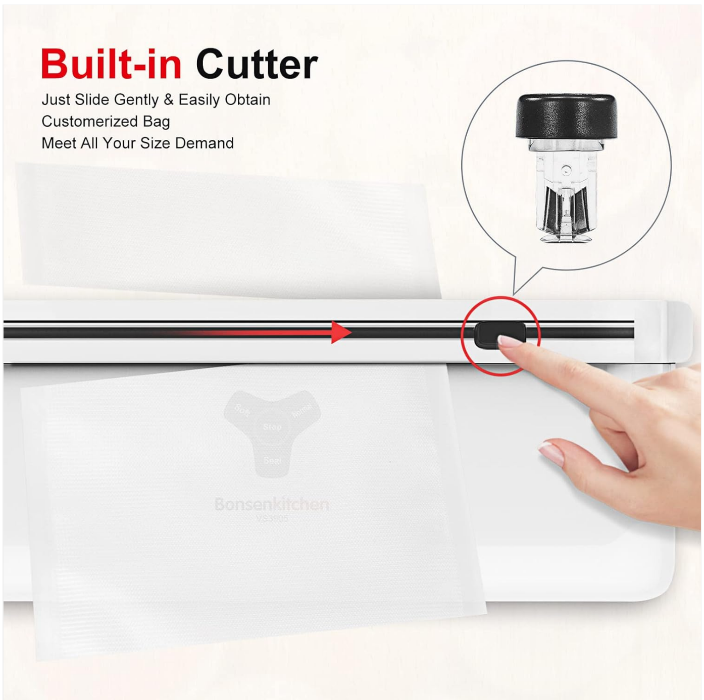
Figure 3: Demonstrating the use of the built-in sliding cutter to create custom-sized bags.