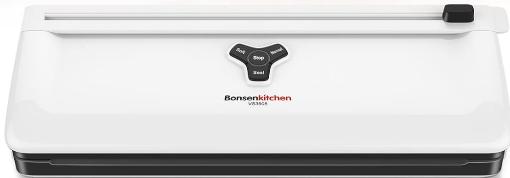
Figure 1: Bonsenkitchen VS3905 Vacuum Sealer showing control panel and mode options.