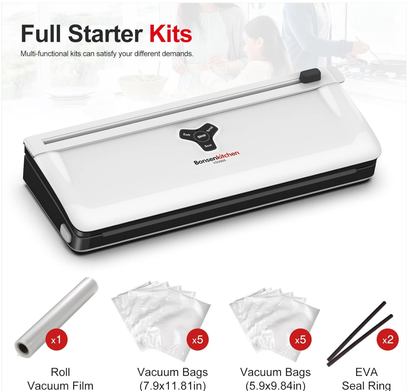
Figure 2: The vacuum sealer with its full starter kit, including vacuum roll and bags.

Multi-functional kits can satisfy your different demands.