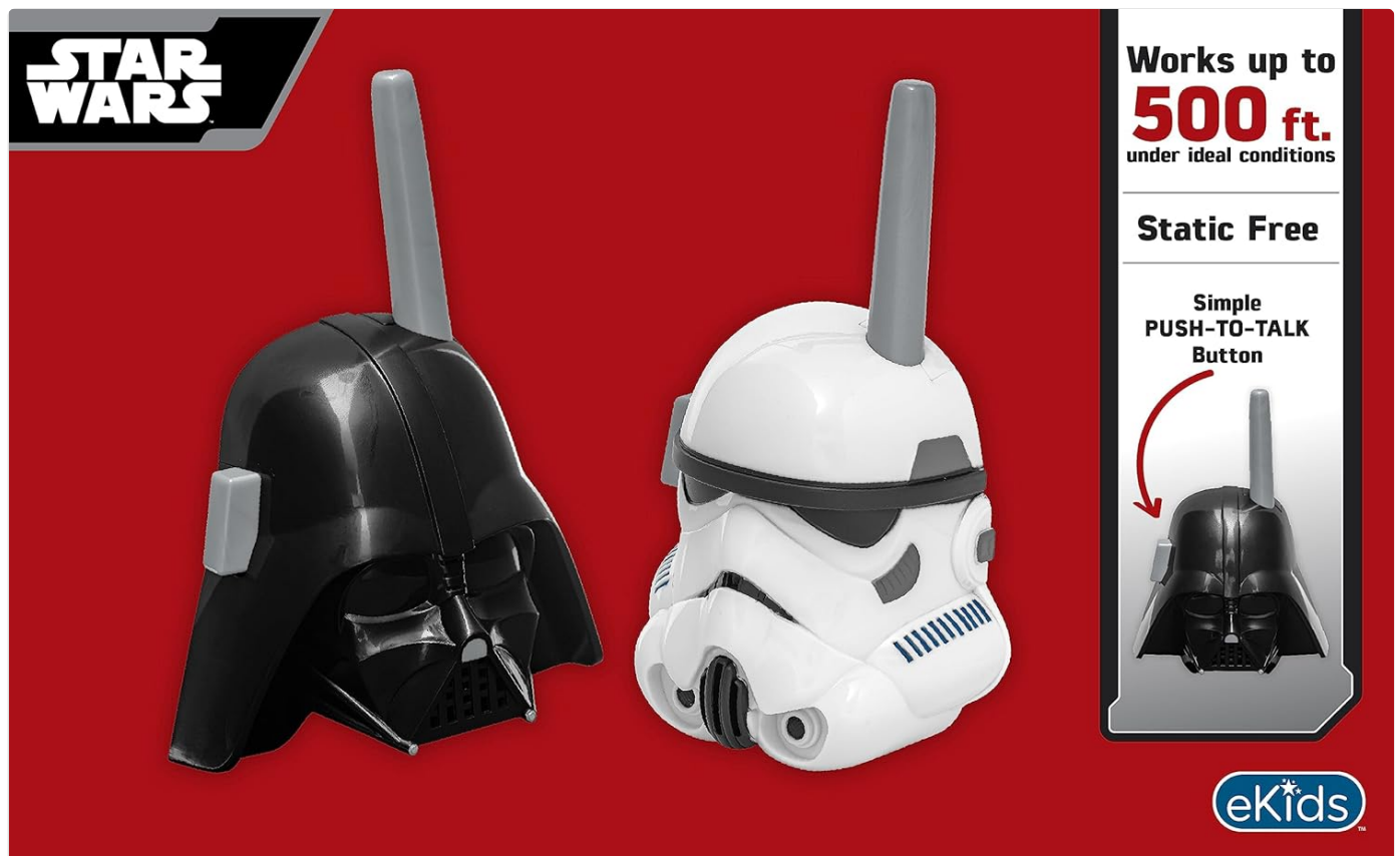
Image 1.1: Front view of the Darth Vader and Stormtrooper walkie talkies, illustrating their key features.

The eKids Star Wars Walkie Talkies (Model SW-207DS) are two-way radios designed for children aged 3 and up. Featuring iconic Darth Vader and Stormtrooper designs, these walkie talkies offer static-free communication with an extended range of up to 500 feet under ideal conditions. They are equipped with kid-friendly controls, including a simple push-to-talk button, making them suitable for both indoor and outdoor play.