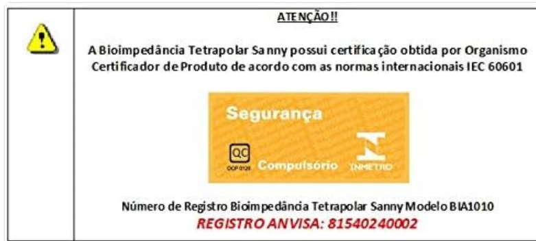
Figure 2.1: Official certification details confirming the Sanny Tetrapolar Bioimpedance device complies with international IEC 60601 standards and has ANVISA registration.