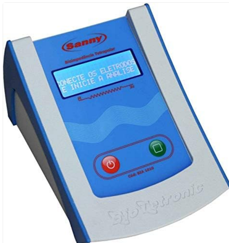
Figure 3.1: The Sanny Tetrapolar Bioimpedance device, model BIA 1010, features a clear display and intuitive control buttons for power and analysis initiation.

The Sanny Tetrapolar Bioimpedance Device BIA 1010 is a compact and user-friendly instrument for body composition analysis. It utilizes tetrapolar bioimpedance technology for precise measurements.