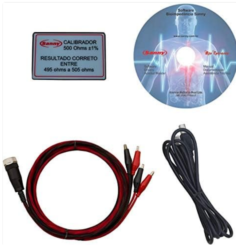
Figure 3.2: This image displays the complete set of components: the bioimpedance device, electrode cables, a 500 Ohm calibrator plate, and the software CD for data analysis.