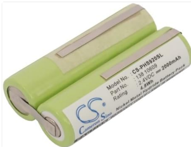
Image 3.1: The FITHOOD replacement battery pack, showing its dual-cell configuration and connection tabs.

The FITHOOD replacement battery (Model: CS-PHS920SL) is a high-quality Ni-MH battery designed to restore power to your compatible Panasonic shaver. It features a 2000mAh capacity and 2.4V voltage.