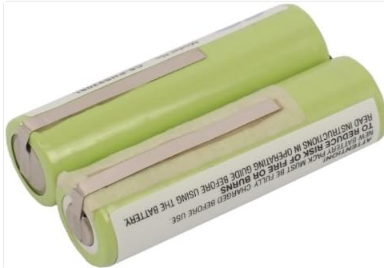
Image 4.1: Close-up of the FITHOOD replacement battery showing the model number (CS-PHS920SL), part number, rating (2.4VDC, 2000mAh, 4.8Wh), and Nickel Metal Hydride Battery Pack label.