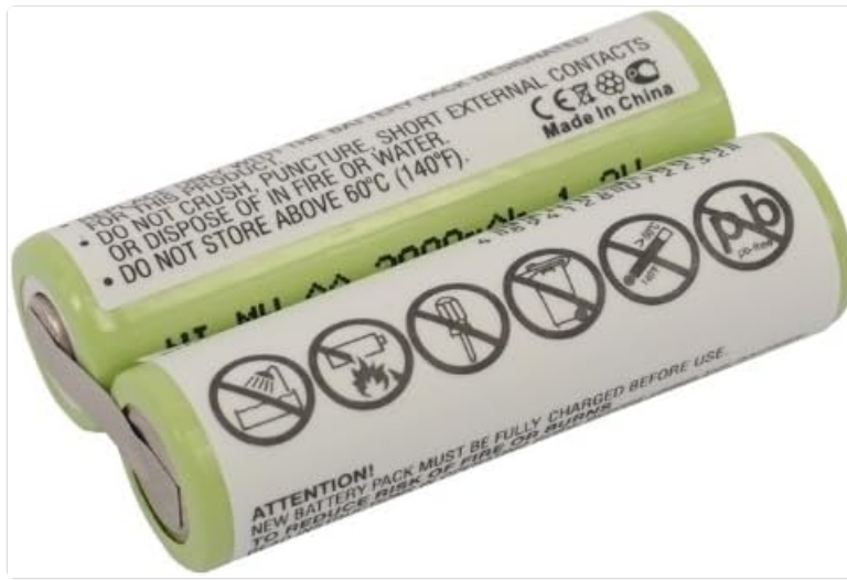
Image 6.1: Bottom view of the FITHOOD replacement battery showing various international compliance and disposal symbols, including the "do not dispose in trash" symbol.