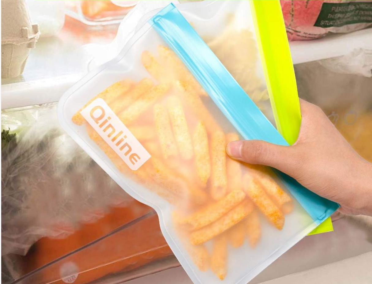
Image: Two Qinline reusable food storage bags, one with a green seal and one with a blue seal, filled with frozen french fries and stored neatly in a freezer drawer, demonstrating their freezer-safe feature.

Qinline thick reusable bags help keep your food from freezer burn, and keep your fridge organized.