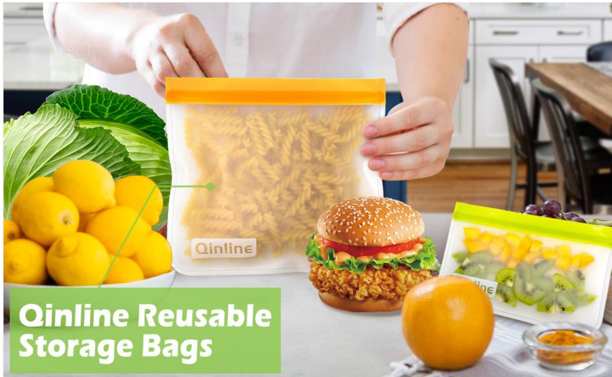
Image: A Qinline reusable storage bag filled with pasta, demonstrating its use for dry goods, alongside other bags and fresh produce in a kitchen setting.