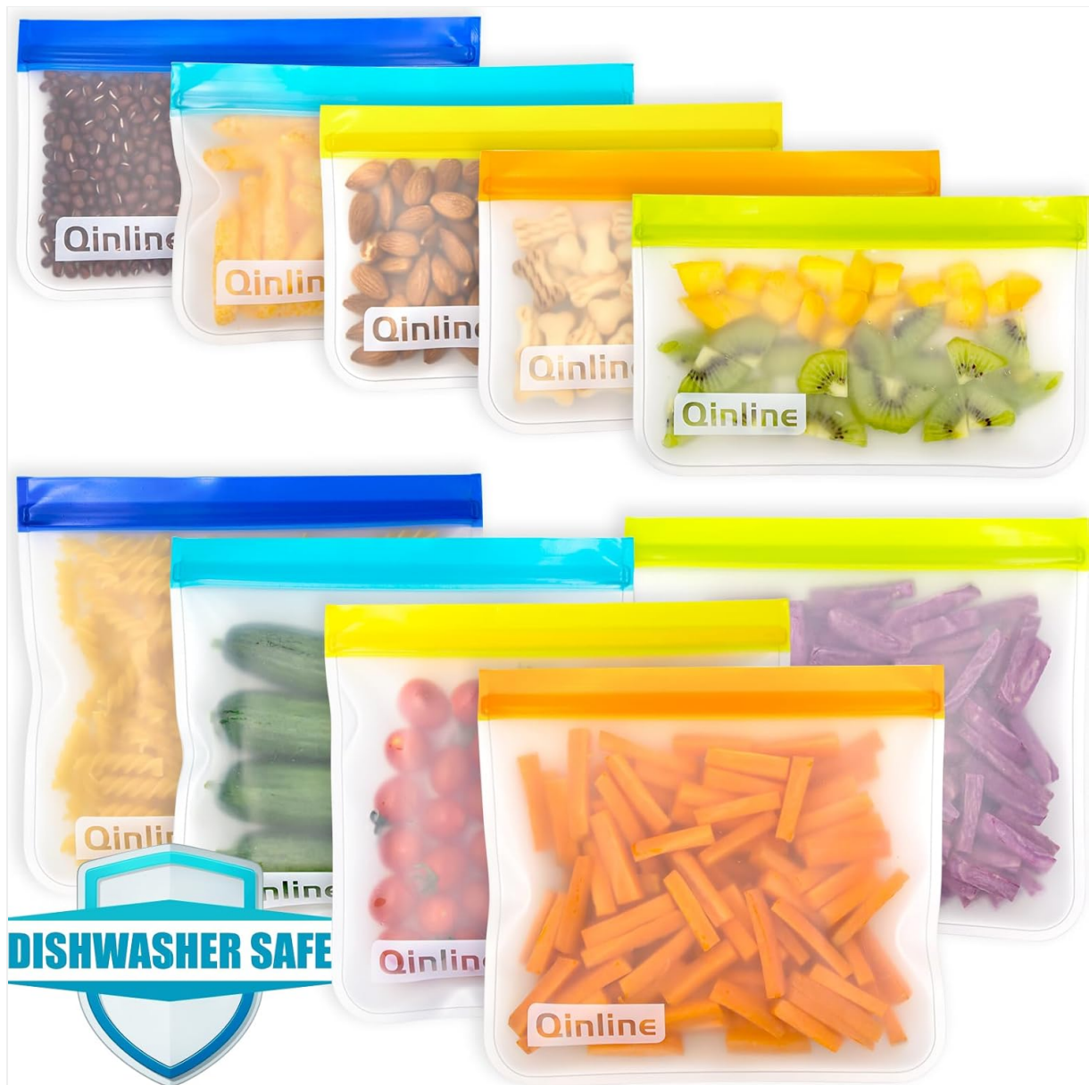
Image: A collection of Qinline reusable food storage bags, showcasing different sizes and vibrant colored seals, filled with various food items such as beans, pasta, nuts, and chopped fruits, highlighting their versatility.