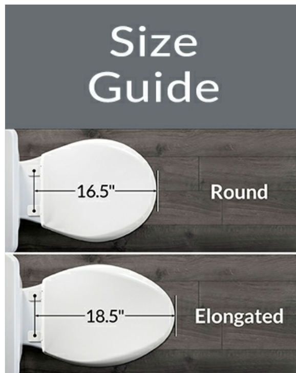
Image: Guide on how to measure your toilet seat to ensure correct sizing for Bemis products.