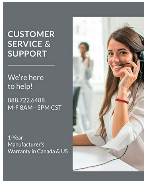
Image: Bemis Customer Service and Support information, including contact number, hours, and warranty details.