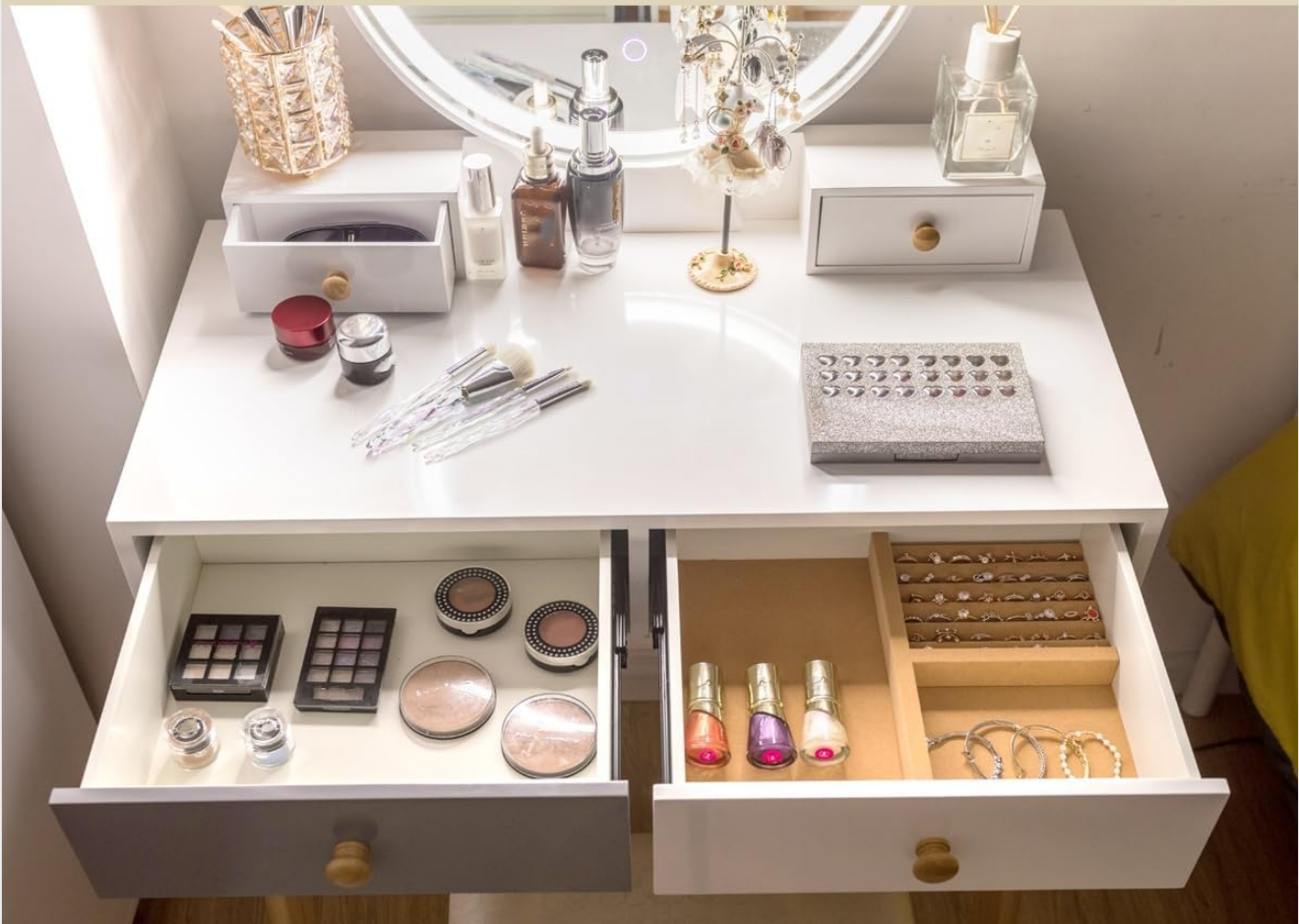
Image 4: View of the vanity drawers, demonstrating the partitioned storage for various jewelry items and makeup.