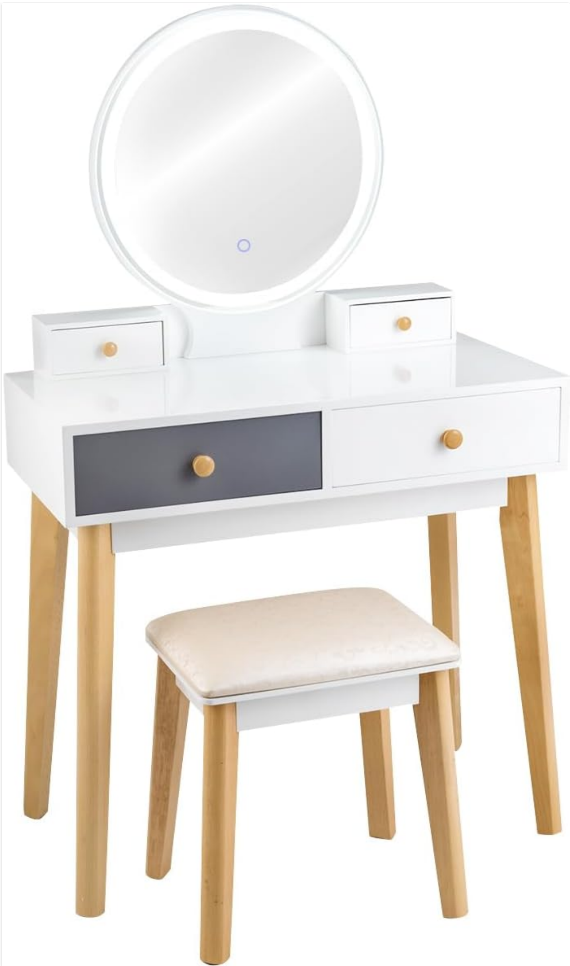
Image 1: Fully assembled CHARMAID Vanity Set, showcasing the lighted mirror, tabletop, and stool.