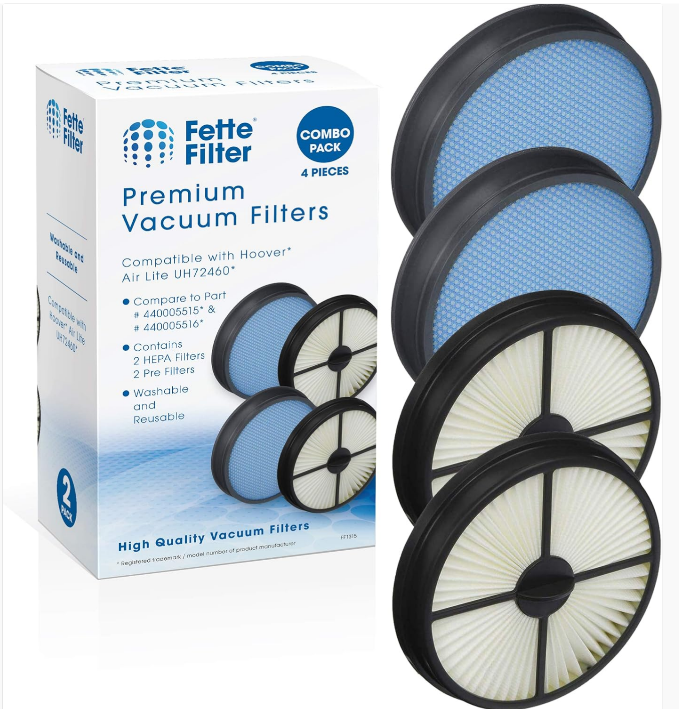
This image displays the Fette Filter Vacuum Filter Set, showing the product packaging and the included HEPA and Primary filters.