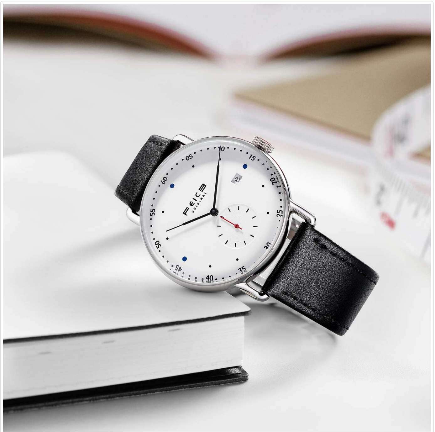
Image: Close-up of the watch crown for time and date adjustment.