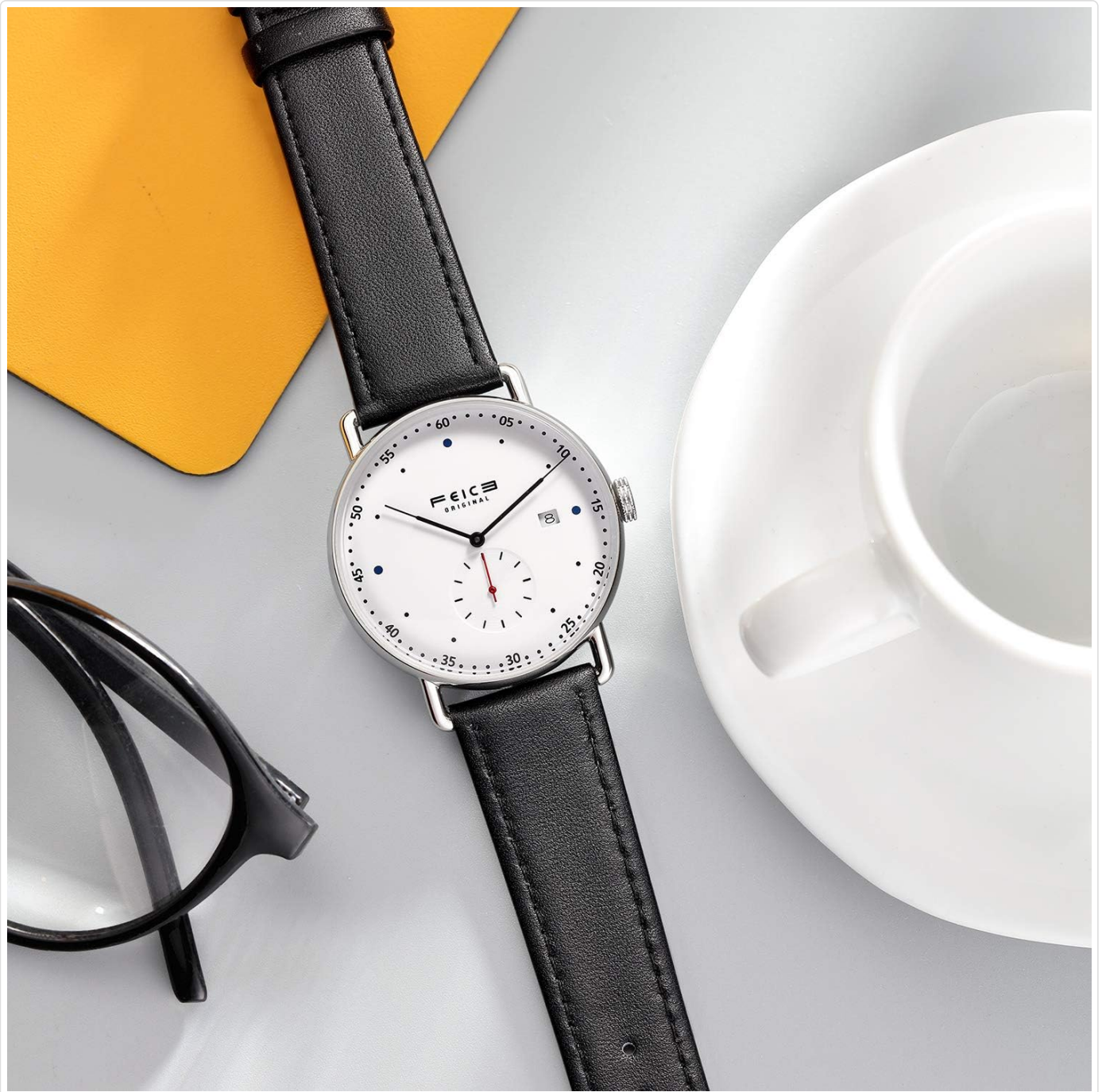
Image: FEICE FM506 Automatic Watch, showcasing its minimalistic design.