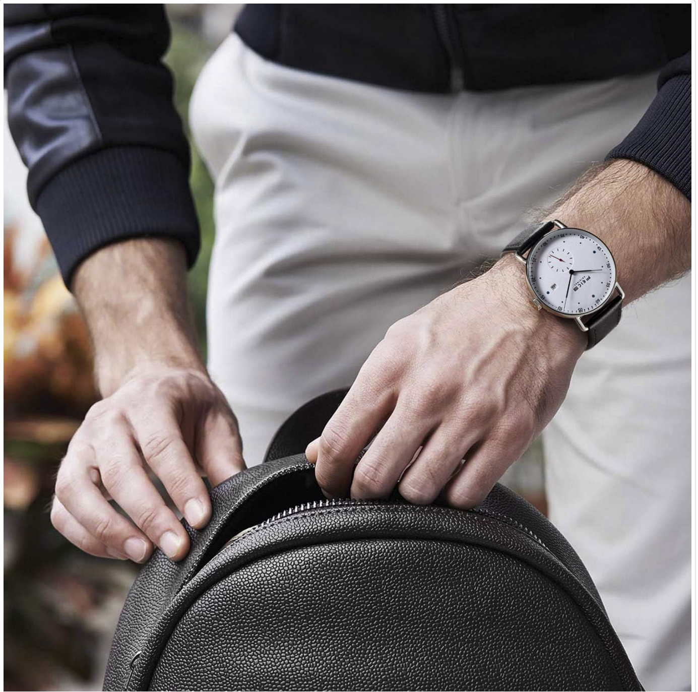
Image: The watch with its genuine leather strap.