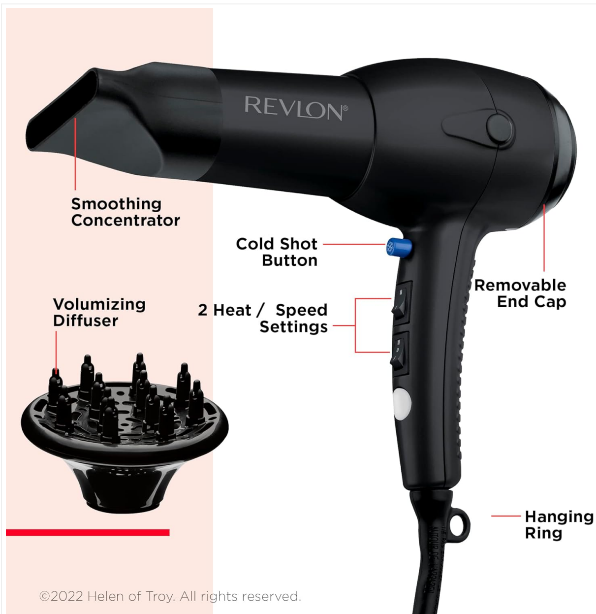
Image 3: Labeled components of the Revlon Hair Dryer, showing the Smoothing Concentrator and Volumizing Diffuser.