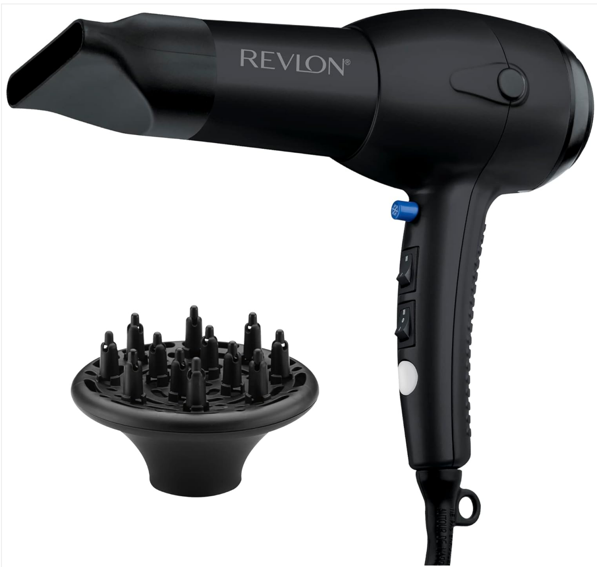
Image 1: Revlon RV544FBLK Hair Dryer with Diffuser and Concentrator attachments.