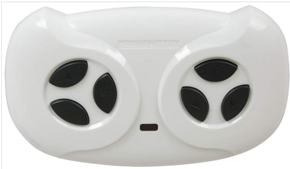
Image: The 2.4G Bluetooth remote control for the electric car.