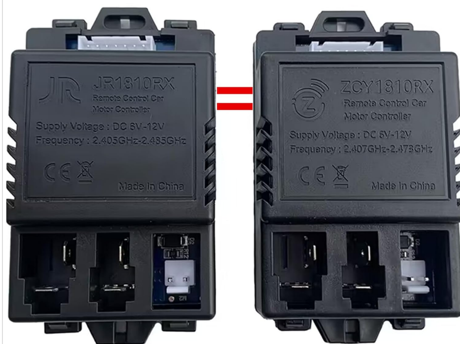
Image: Comparison of JR1810RX and ZCY1810RX control boxes, showing they are interchangeable.