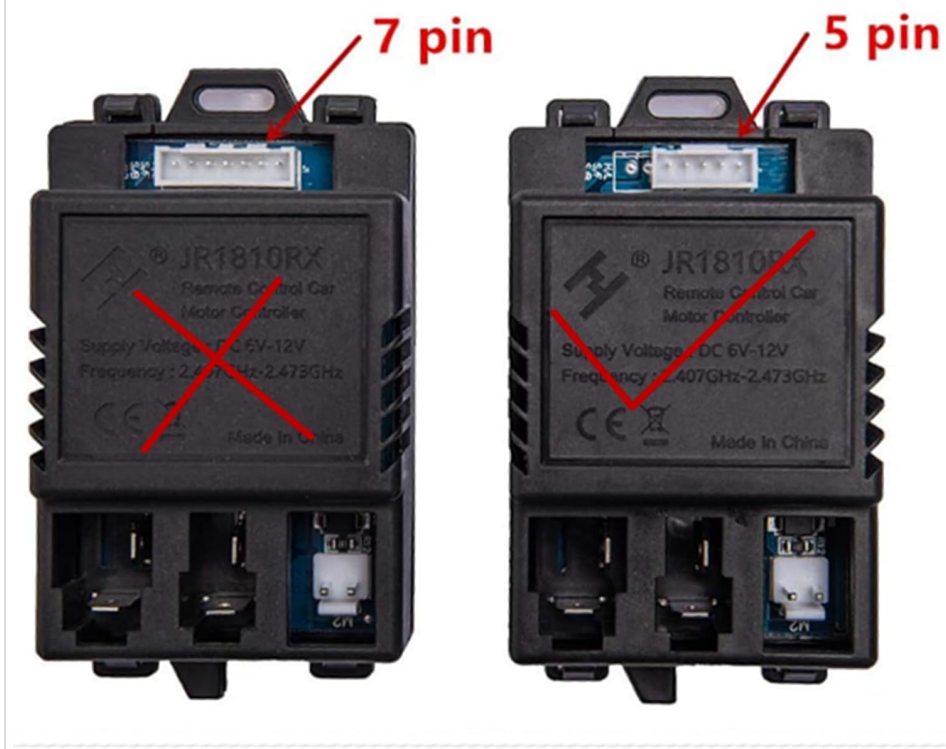
Image: Visual distinction between the 5-pin and 7-pin versions of the JR1810RX control box. This product is the 5-pin version.

Important: This product is the 5-pin version. If your vehicle requires a 7-pin control box, this product will not be compatible.