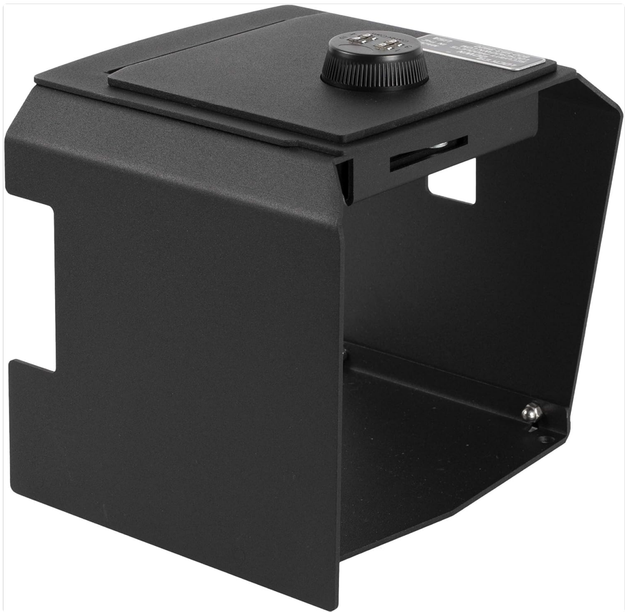
Image 1.1: The Lock'er Down Extreme Console Safe in its closed position, showcasing its robust construction and integrated combination lock.