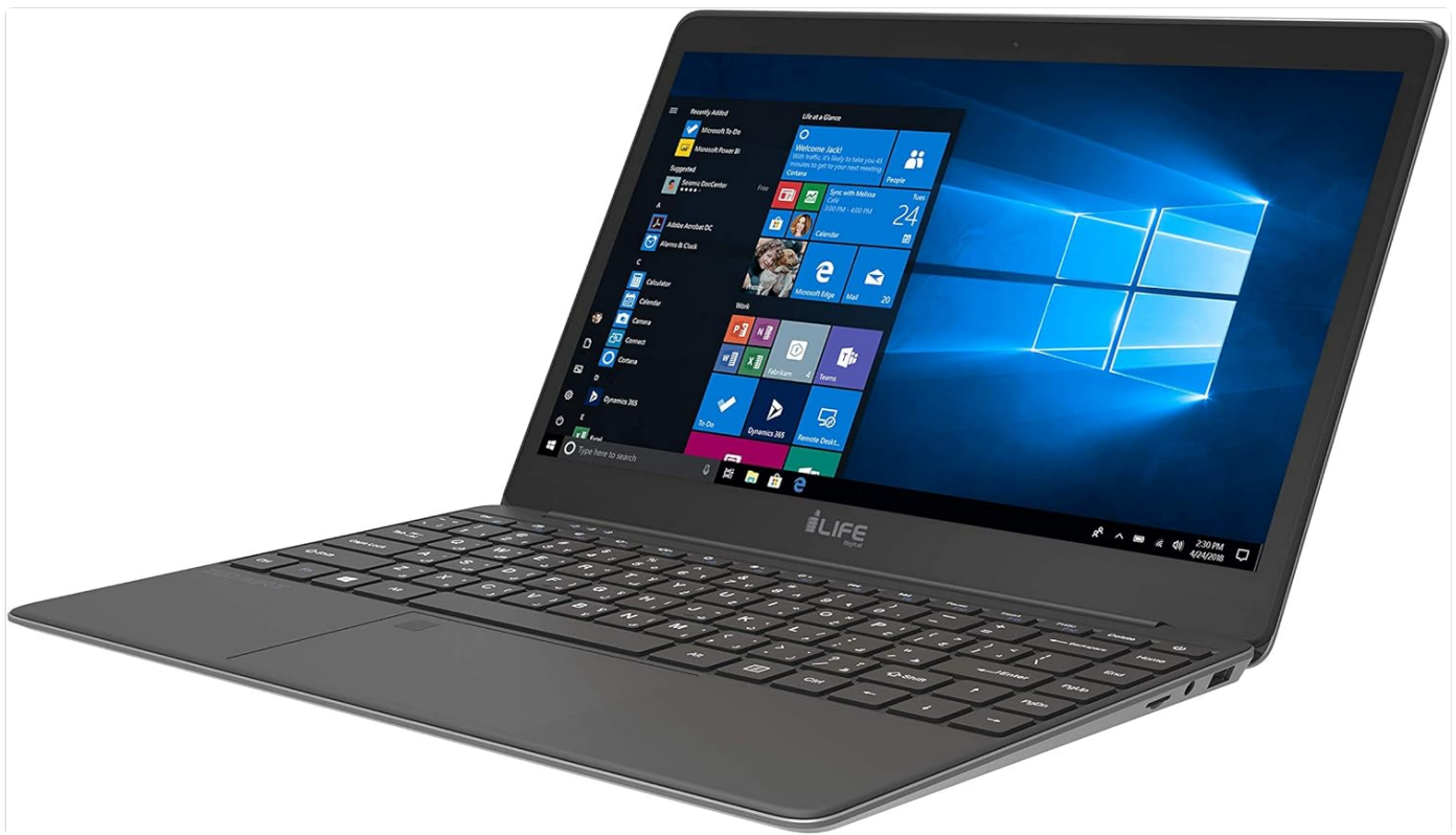
Figure 2.3: Side View of i-Life ZedAir X Laptop. This image highlights the slim profile of the laptop and shows some of the available ports on the side, including a USB port and possibly the power input or other connectivity options.