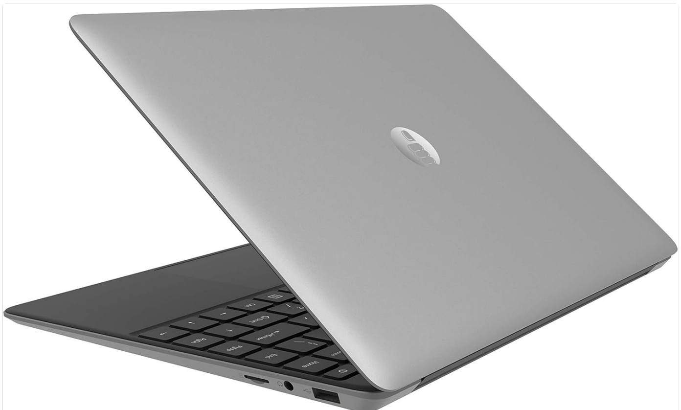
Figure 2.4: Rear View of i-Life ZedAir X Laptop. This image displays the back of the laptop with the lid closed, showcasing its sleek grey metallic finish and the i-Life logo centrally placed on the lid.