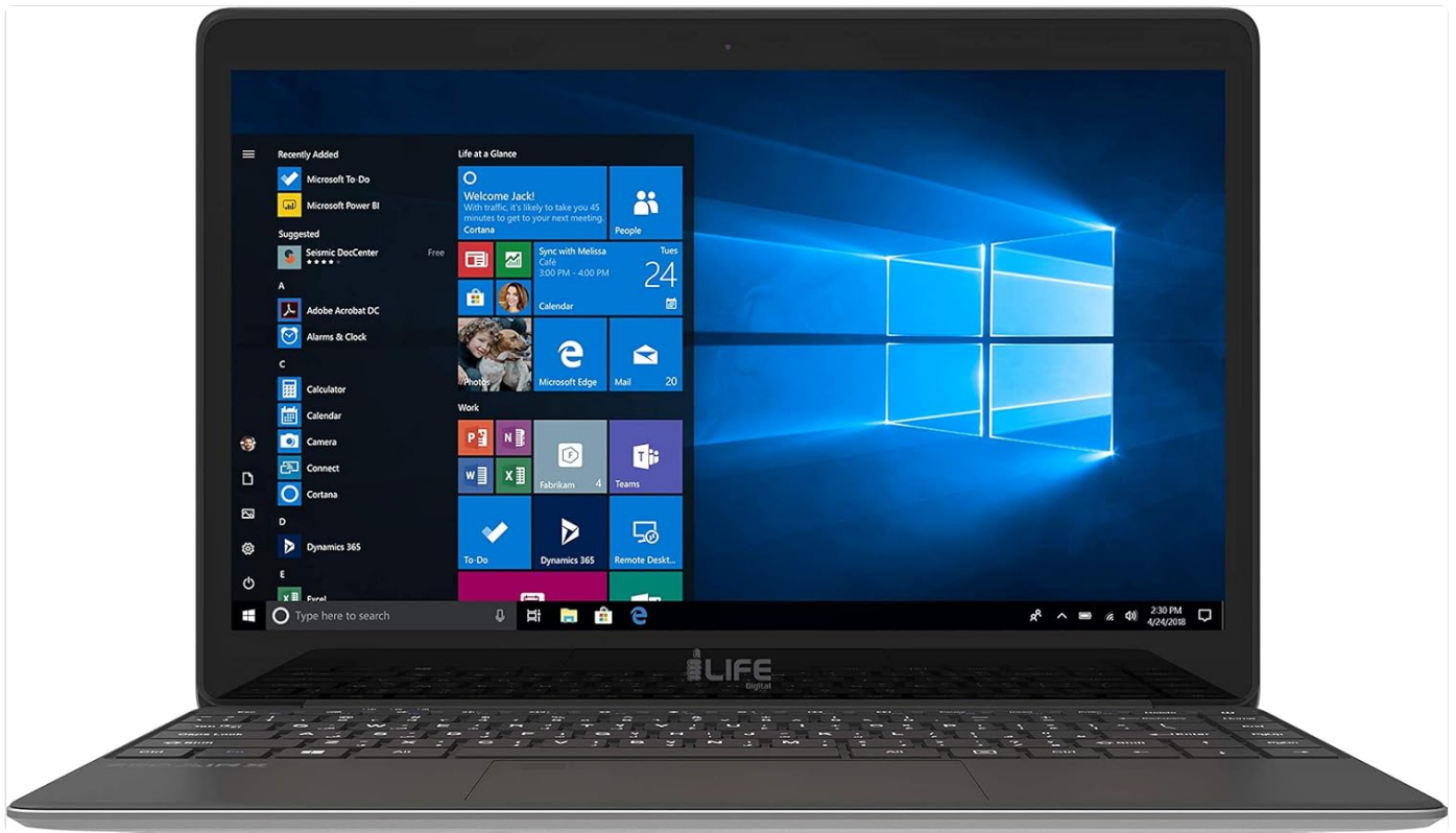
Figure 2.1: Front View of i-Life ZedAir X Laptop. This image shows the laptop open, displaying the 13.3-inch Full HD screen with the Windows 10 operating system desktop. The keyboard and touchpad are visible below the screen, and the i-Life logo is centrally placed below the display.