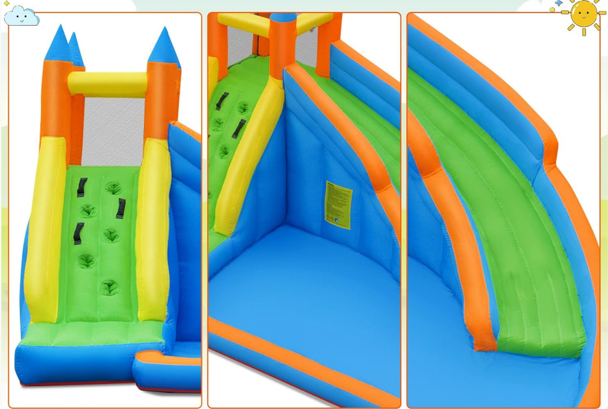
Image 5.1: Features of the water slide: climbing wall, splash pool, and water slide.