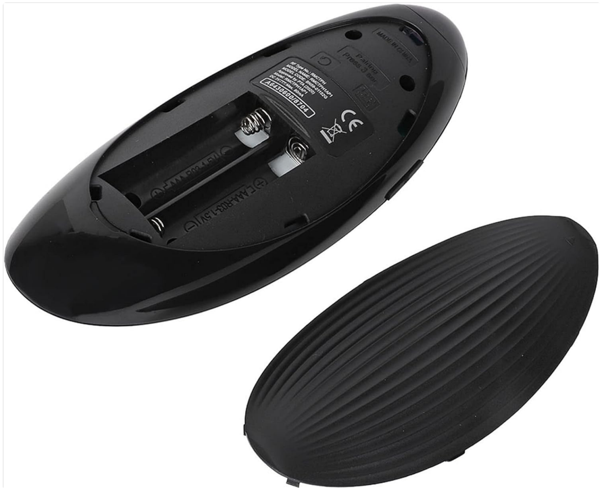
Image 2.1: Rear view of the remote control with the battery cover removed, illustrating the correct placement for two AA batteries.

The remote is now ready for use. No additional programming is required for compatible devices.