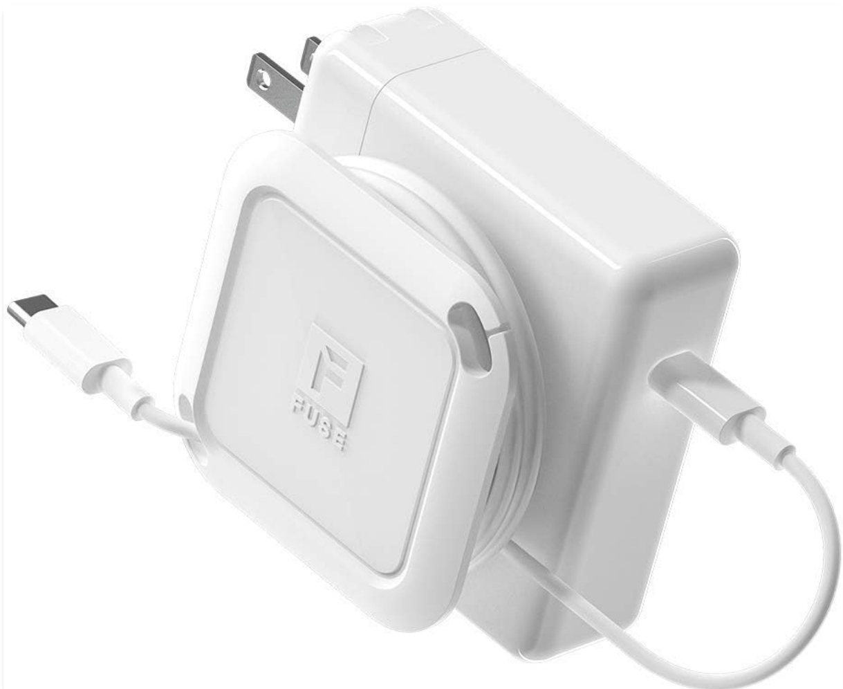
Image 1.1: The Side Kick attached to a charger, demonstrating compact cable organization.

The Fuse Reel The Side Kick is a collapsible charger organizer designed to streamline cable management for your MacBook and PC charging cords. It provides a compact and organized solution for both travel and daily use, preventing tangled cables and protecting your charger.