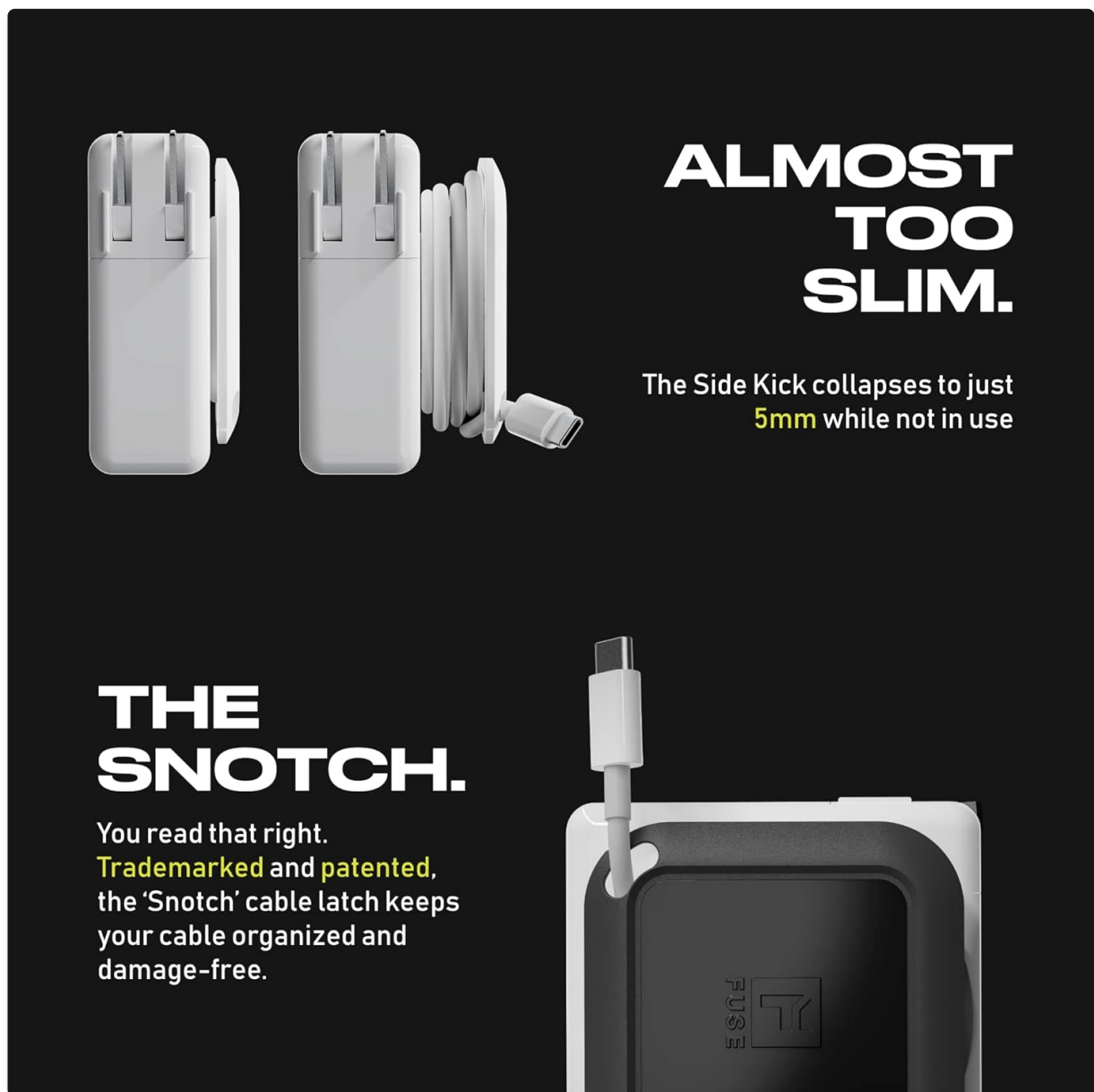
Image 5.1: The Side Kick's collapsible design and 'Snotch' cable latch.