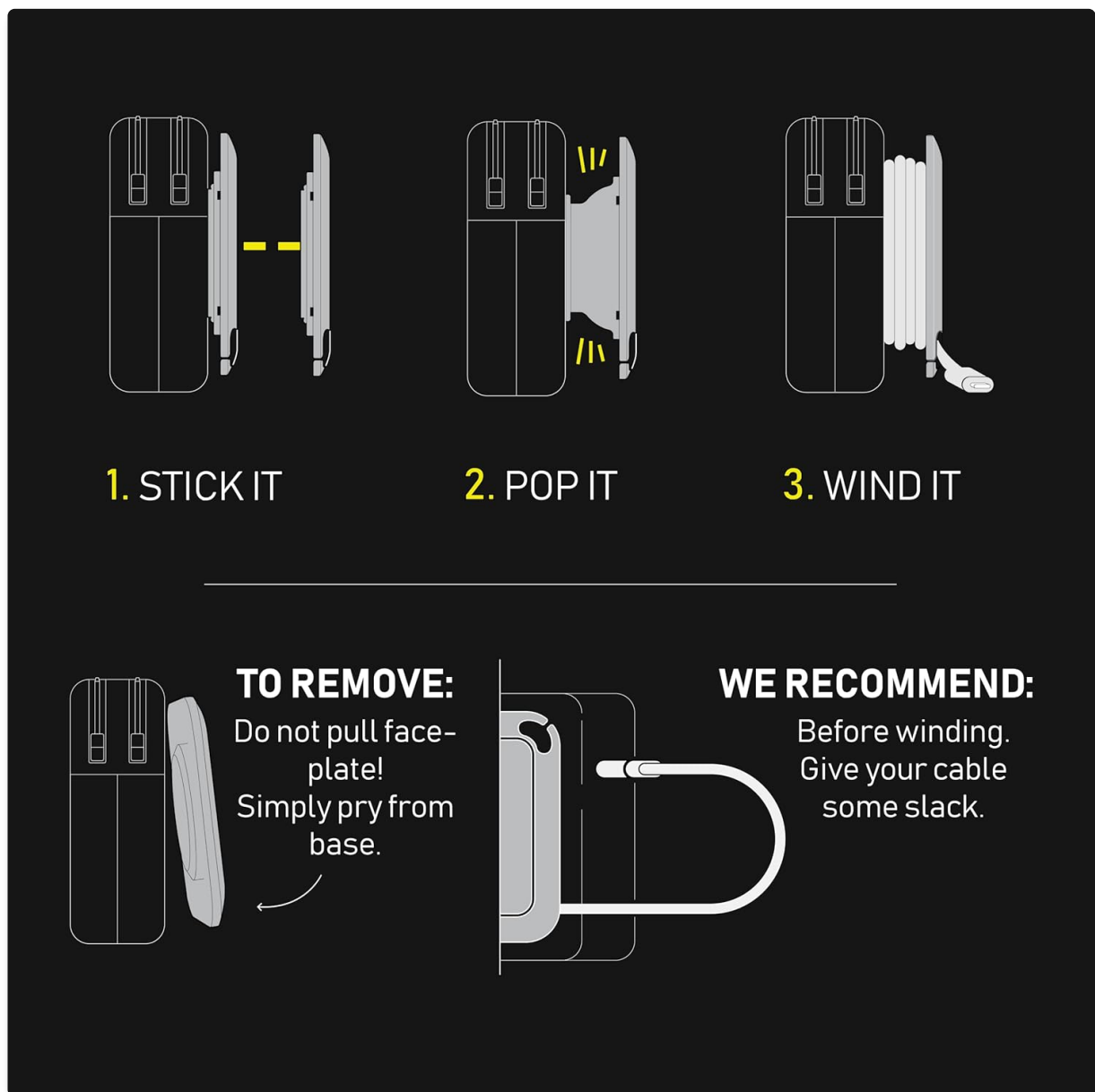
Image 3.2: Step-by-step visual guide for attaching and winding the cable.