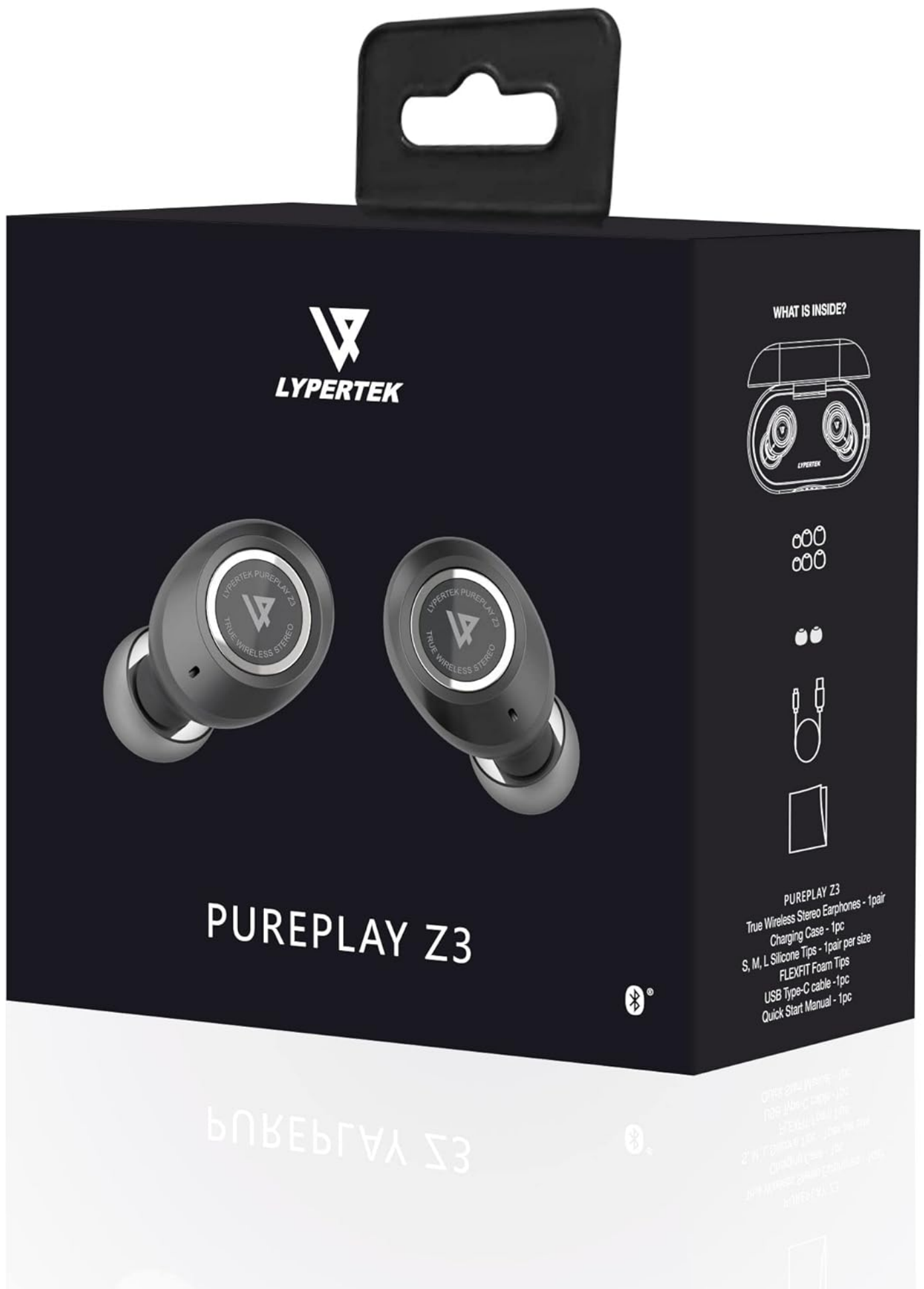
Image: The retail packaging for the LYPERTEK PurePlay Z3 2.0, showing the earbuds and charging case on the front, with icons on the side indicating included accessories.