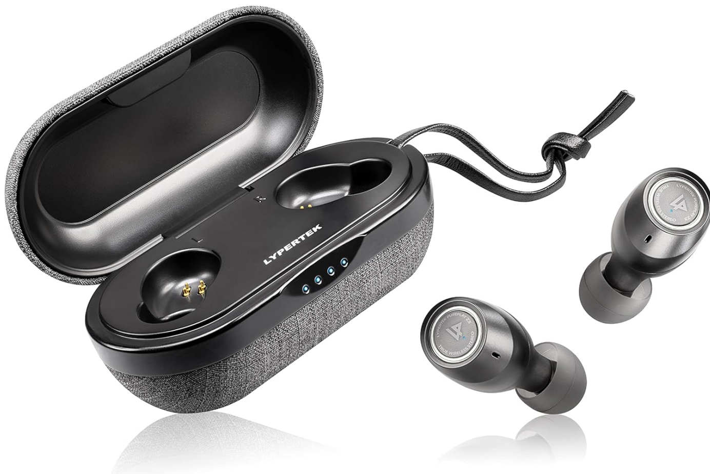
Image: LYPERTEK PurePlay Z3 2.0 True Wireless Earbuds shown with their fabric-covered charging case. The earbuds are black with metallic accents, and the case is open, revealing the charging cradles and LED indicators.

The LYPERTEK PurePlay Z3 2.0 True Wireless Earbuds offer an advanced audio experience with upgraded features. These earbuds are designed for immersive sound, extended playtime, and seamless connectivity, making them suitable for daily use and active lifestyles.