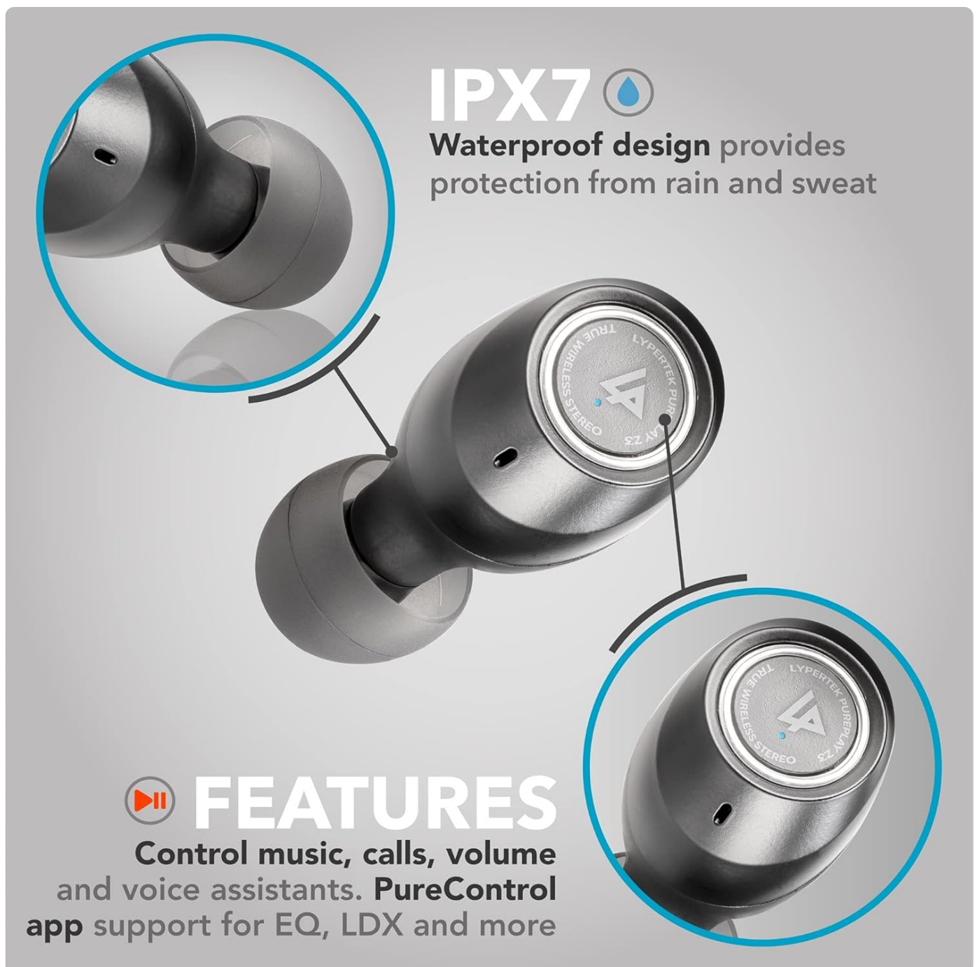
Image: Close-up of a LYPERTEK PurePlay Z3 2.0 earbud highlighting its IPX7 waterproof design and control features. Text indicates