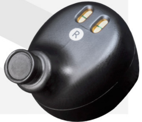
Image: An illustration highlighting the 80-hour battery life and Bluetooth 5.2 connectivity of the LYPERTTEK PurePlay Z3 2.0. The image shows the earbuds in their charging case and a close-up of an earbud's internal components.

Equipped with the latest Qualcomm QCC3040 Bluetooth 5.2 chipset with aptX and AAC for a rock solid connection and HD audio transmission.