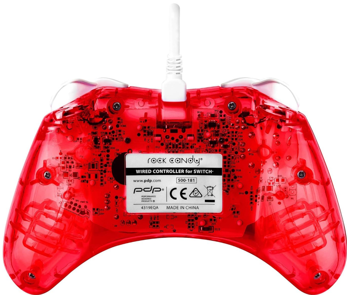
Figure 4: The controller's ergonomic design provides a comfortable grip during gameplay.