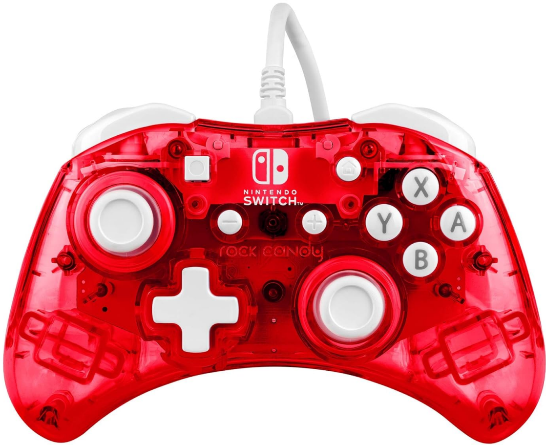
Figure 1: Front view of the Stormin Cherry Red Rock Candy Wired Controller.