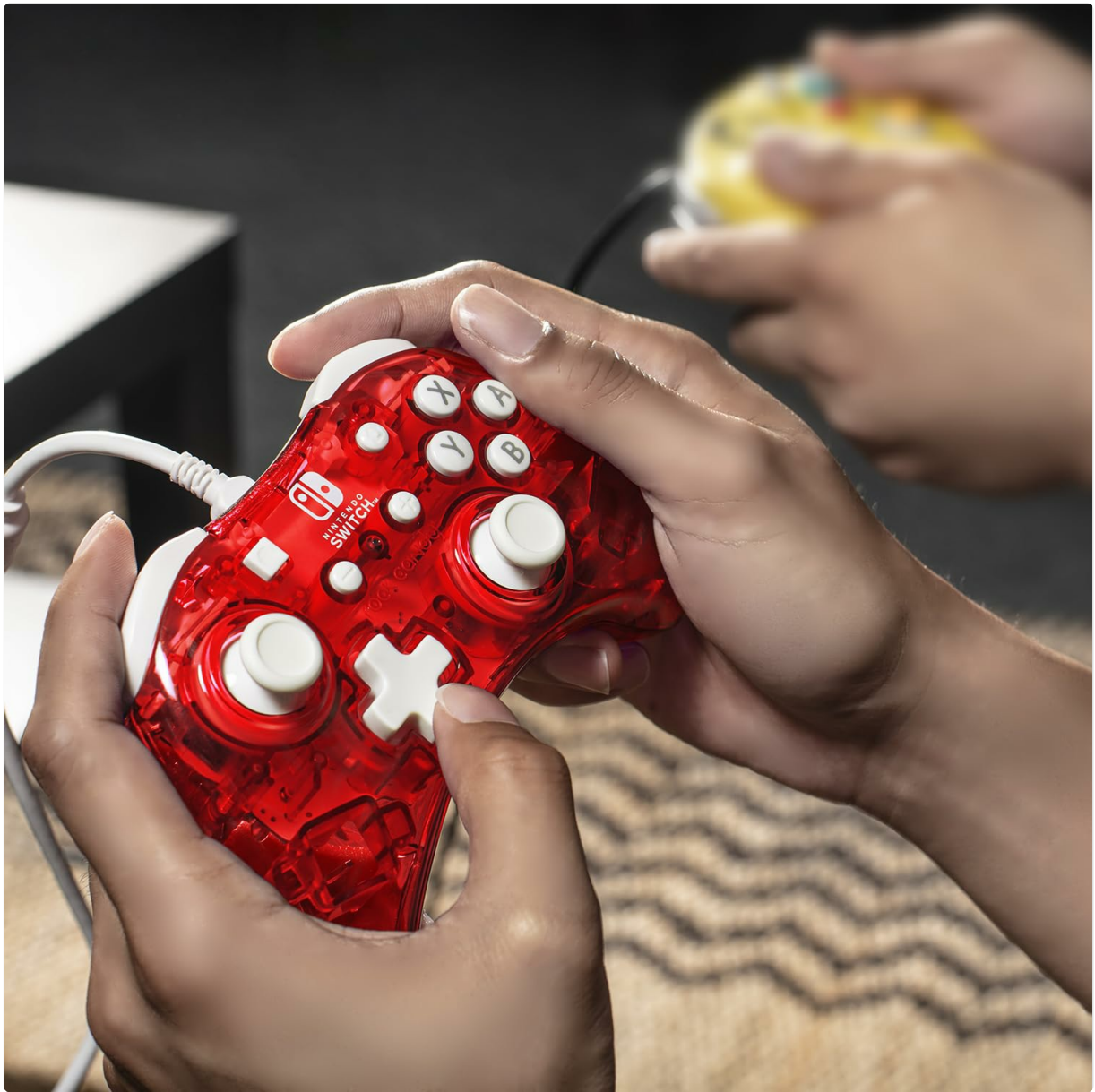
Figure 2: Close-up view of the controller's concave thumbsticks.