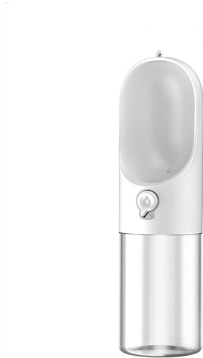
Figure 1.1: The PETKIT One-Touch Water Bottle in white, showcasing its sleek design and compact form factor.