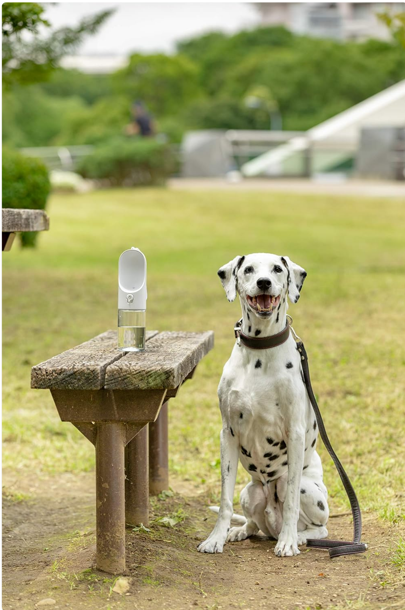
Figure 5.1: The PETKIT One-Touch Water Bottle positioned on a bench, ready for use during an outdoor excursion with a dog.