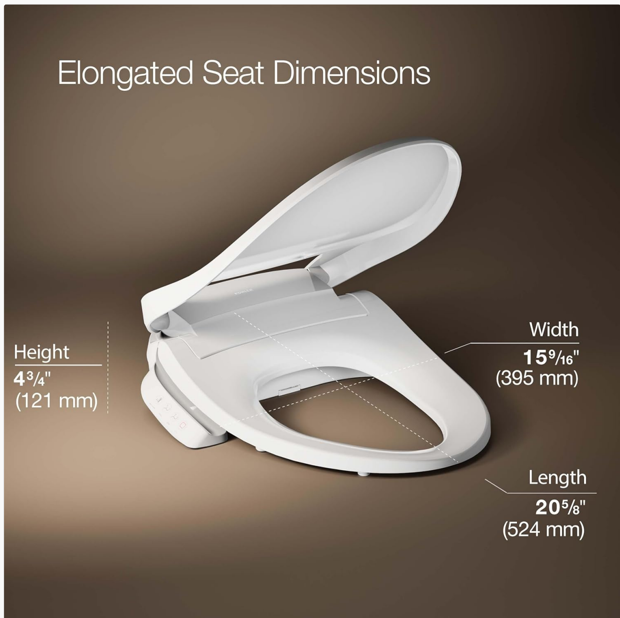
Figure 8.1: Detailed dimensions for the elongated bidet seat.