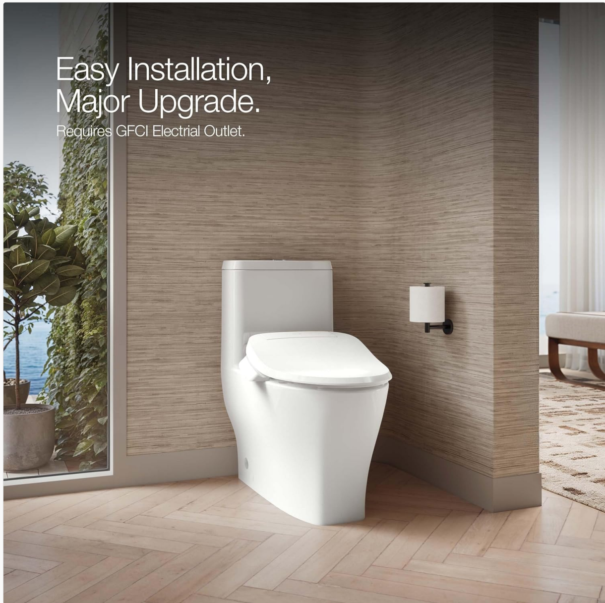
Figure 4.1: The bidet seat is designed for straightforward installation, requiring a GFCI electrical outlet.