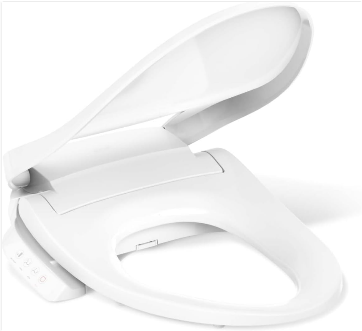
Figure 1.1: The Kohler PureWash E545 Elongated Heated Bidet Toilet Seat.