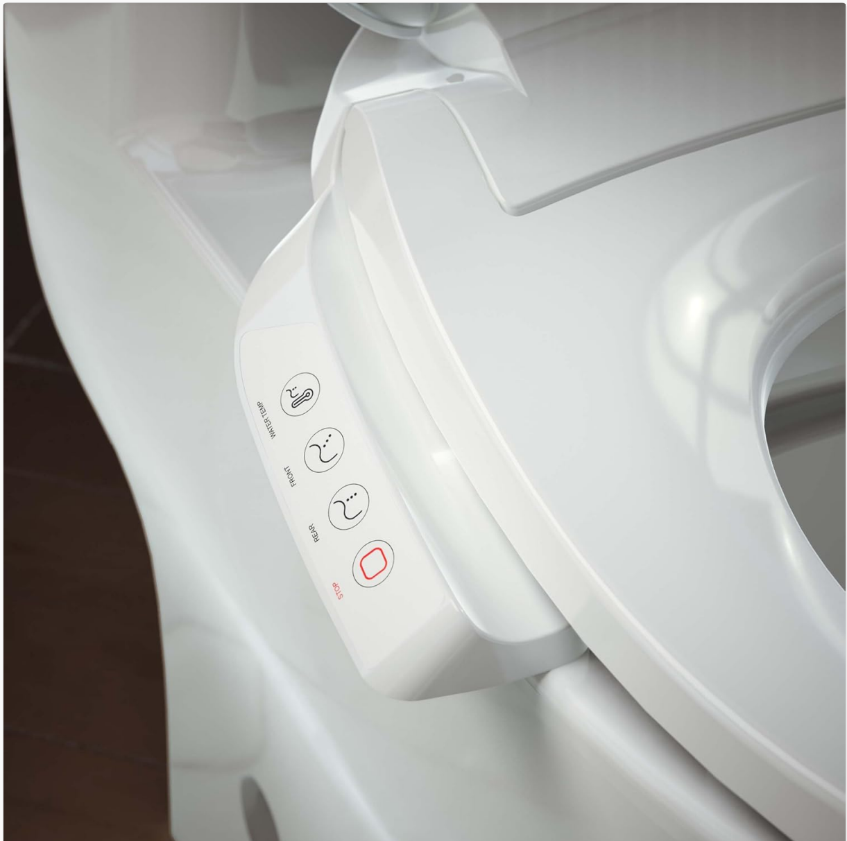
Figure 5.1: Side-mounted control panel for adjusting settings.

The Kohler PureWash E545 features a side-mounted control panel for easy access and operation.