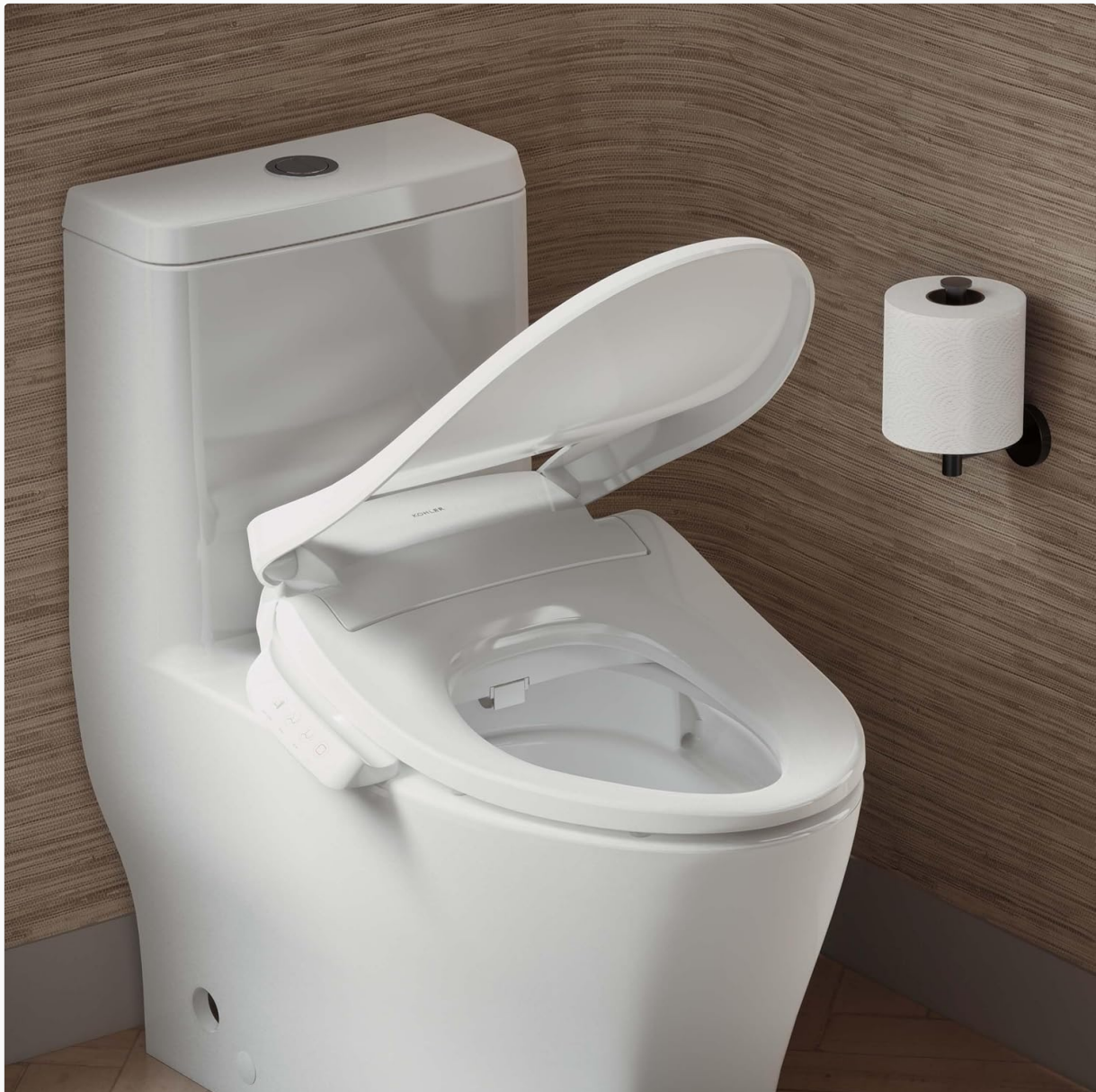
Figure 6.1: The bidet seat features a quiet-close lid and quick-release functionality for easy cleaning.