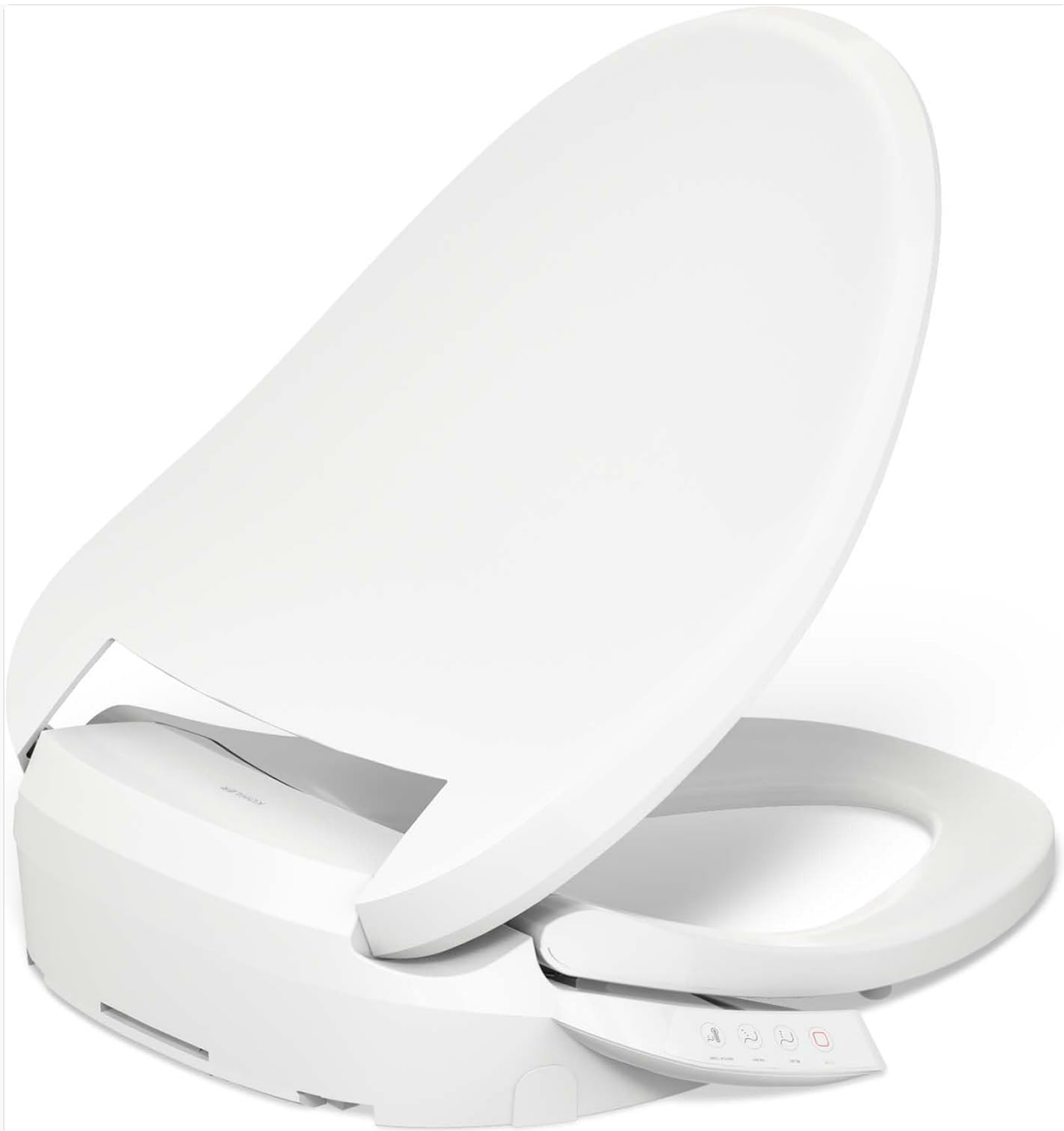
Figure 6.2: The self-cleaning wand ensures optimal hygiene.