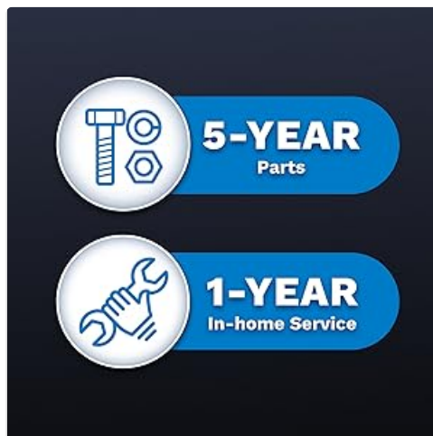
Figure 8: ROBAM Warranty Information