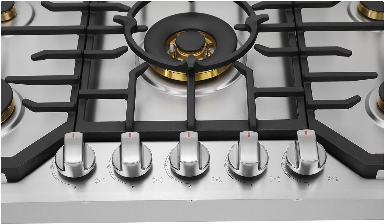
Figure 4: Cooktop Control Knobs