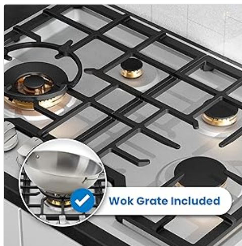
Figure 5: Wok Grate in Use

The ROBAM G515 includes a specialized wok grate designed to securely hold round-bottom woks over the central high-power burner. To use, simply place the wok grate over the central burner's cast iron grate. Ensure it is stable before placing a wok on it.