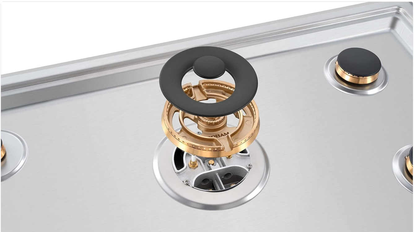
Figure 7: Burner Components for Cleaning

Allow all parts to cool completely before cleaning. The cast iron grates and burner caps can be removed and washed with warm, soapy water. For stubborn stains, a non-abrasive scrub brush can be used. Ensure all parts are thoroughly dry before reassembling them on the cooktop.