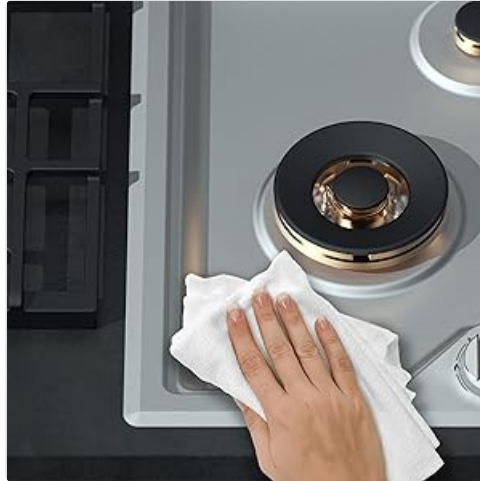
Figure 6: Cleaning the Cooktop Surface

Clean the stainless steel surface with a soft cloth and a mild, non-abrasive cleaner specifically designed for stainless steel. Wipe in the direction of the grain to prevent streaks. Avoid using harsh chemicals, abrasive pads, or steel wool, as these can scratch the surface.