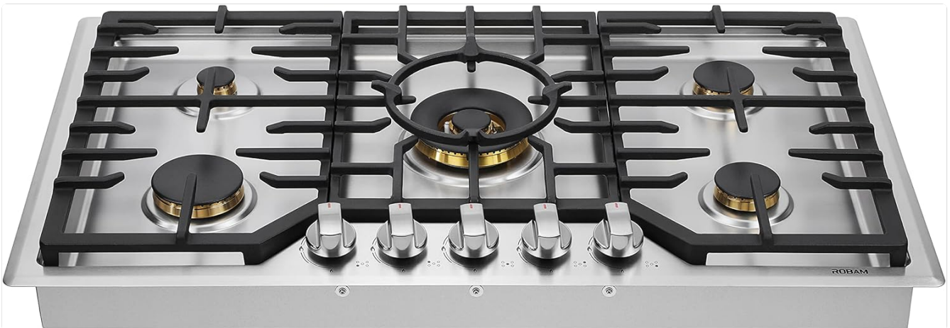
Figure 1: ROBAM G515 36-inch Gas Cooktop

The ROBAM G515 36-inch Gas Cooktop is a professional-quality appliance designed for modern kitchens. It features a durable stainless steel surface and robust matte cast iron grates, providing a reliable cooking experience. This cooktop is equipped with five high-performance burners, including a powerful central burner, to accommodate diverse cooking needs.