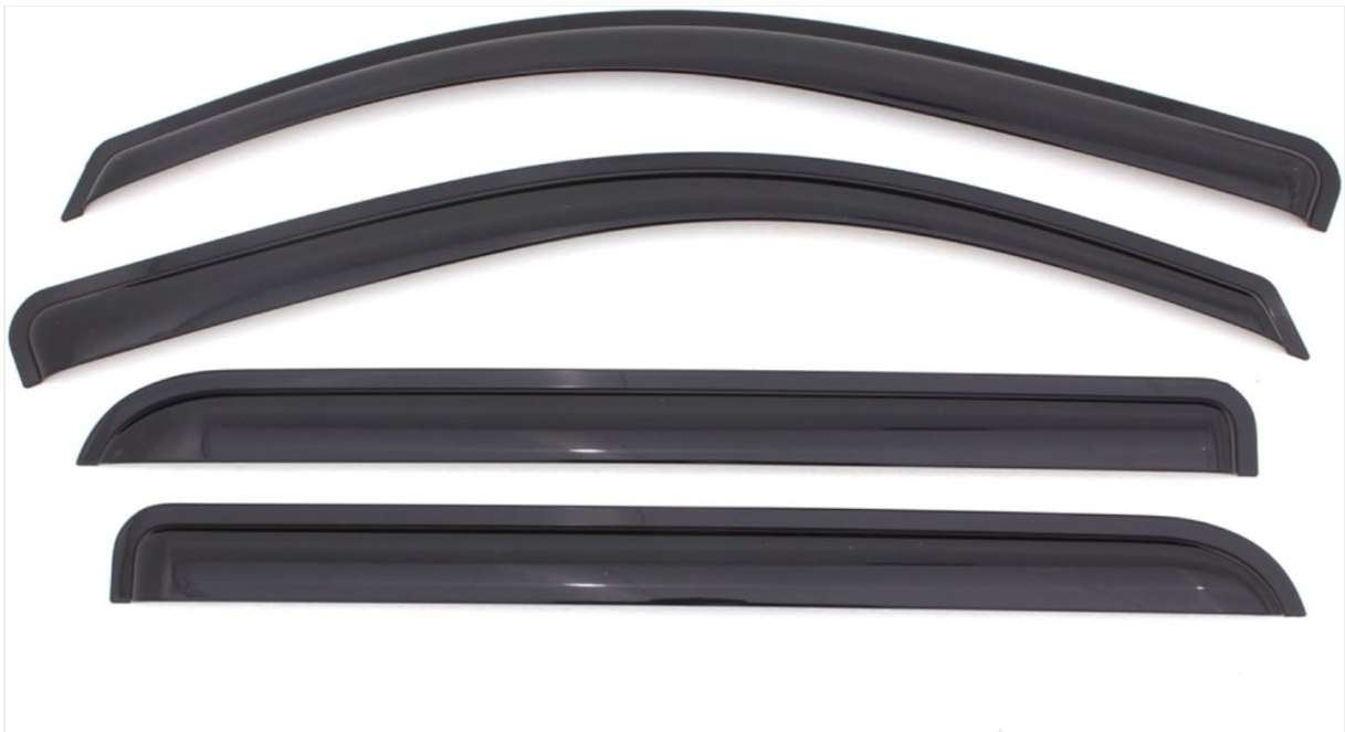
Image: The complete set of four AVS Outside Mount Rain Guards, showcasing their smoke finish and curved shape, ready for installation.