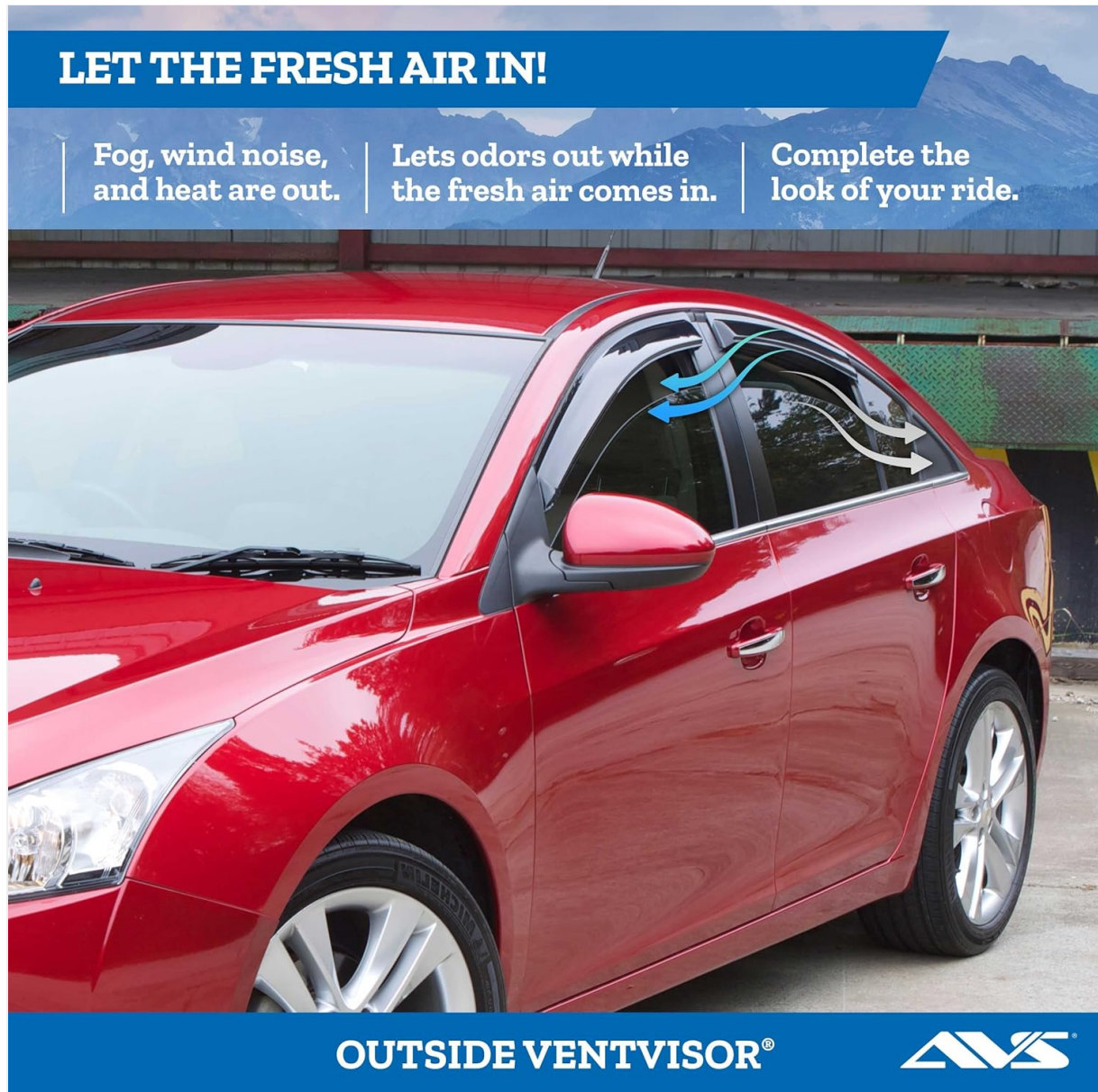
Image: A red car equipped with AVS Ventvisors, illustrating how the design allows fresh air to enter and stale air to exit, preventing fog and odors.