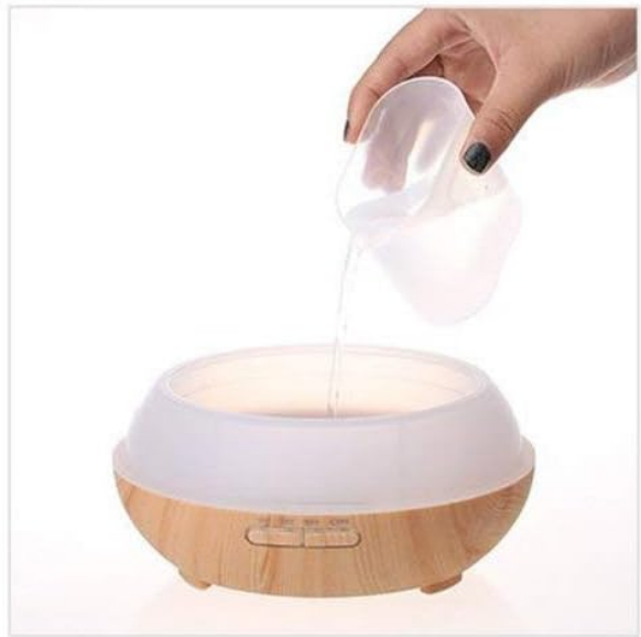
2. Add water