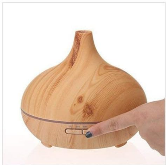
4. Press button to turn on