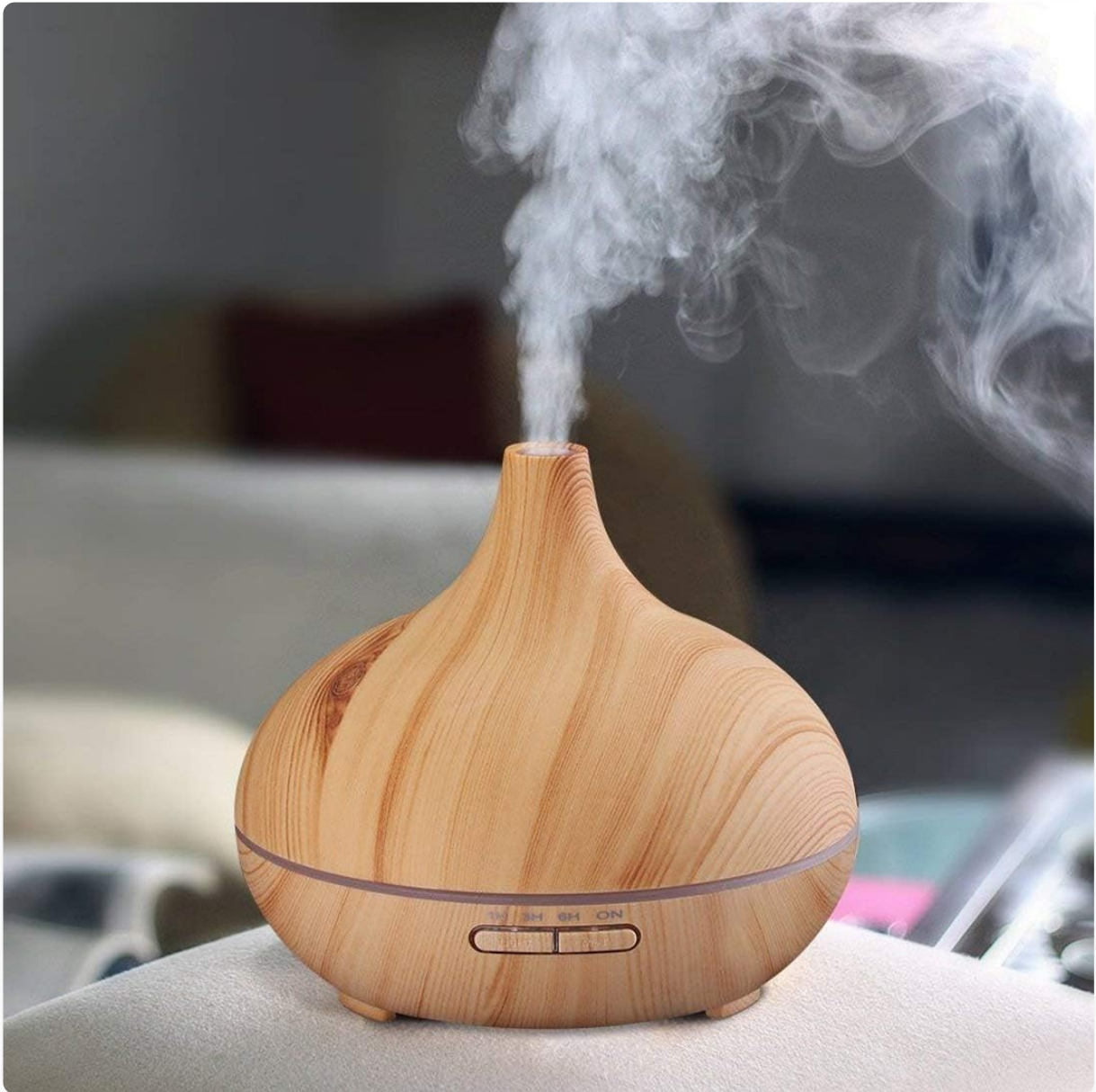
Image 4: The diffuser actively producing a fine, cool mist, demonstrating its primary function.