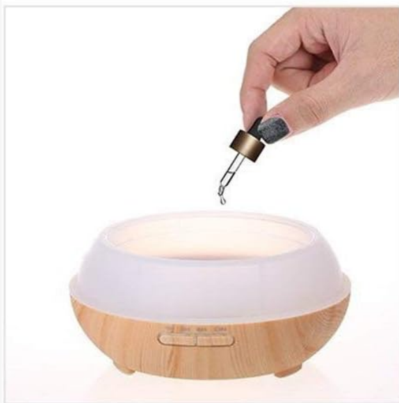
3. Add drops of essential oil (not included)