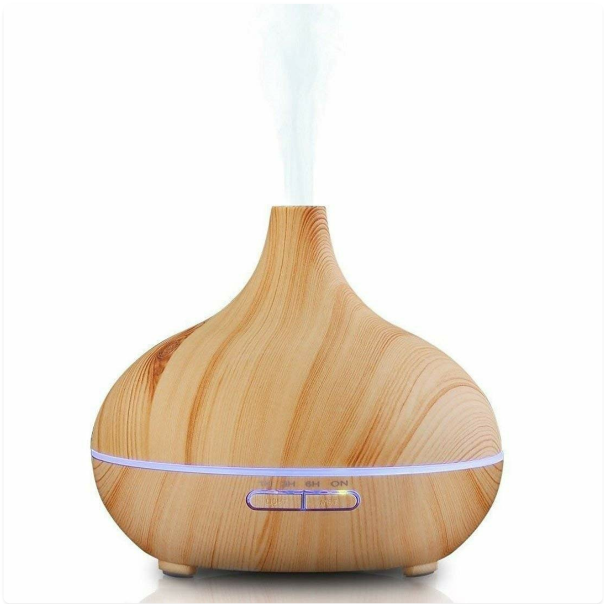
Image 1: JoySusie 500ml Wood Grain Essential Oil Diffuser. This image shows the diffuser in its natural wood grain finish, emitting a fine mist.