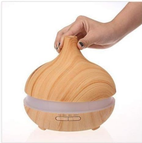
1. Lift up the cover