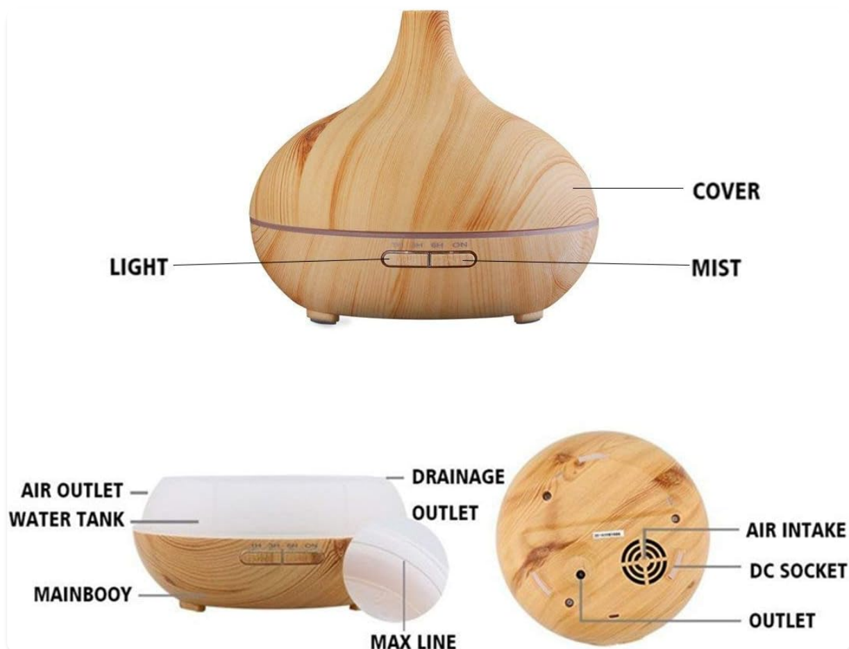
Image 2: Labeled diagram of the diffuser components. Key parts include the cover, mist outlet, light ring, MIST button, LIGHT button, DC socket, air intake, drainage outlet, water tank, MAX line, and main body.