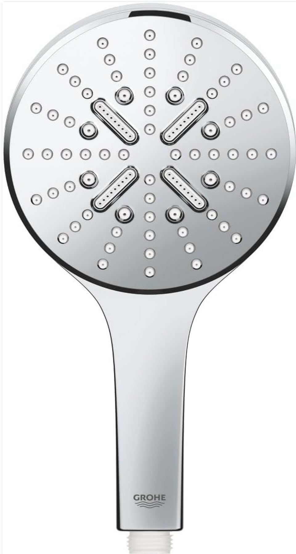
Figure 1: Front view of the GROHE Rainshower SmartActive 130 Hand Shower, showcasing its design and spray plate.