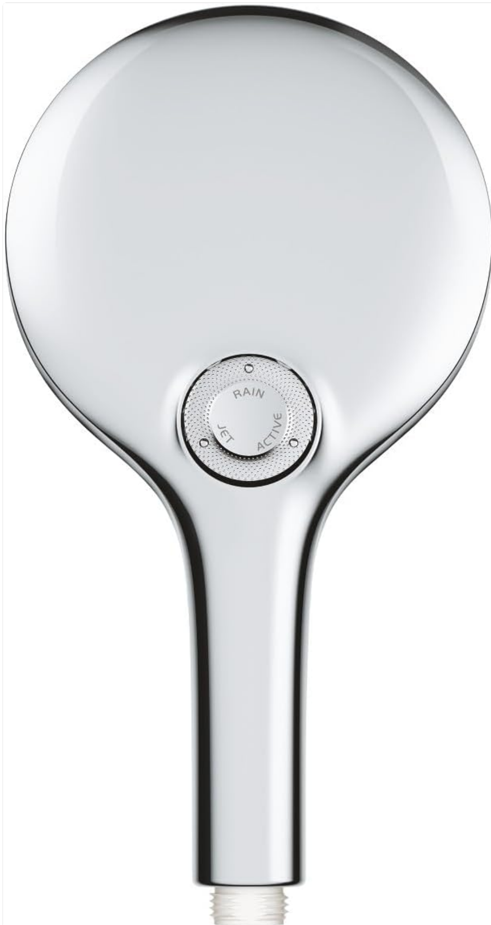
Figure 3: Rear view of the hand shower with the SmartTip control for spray selection.