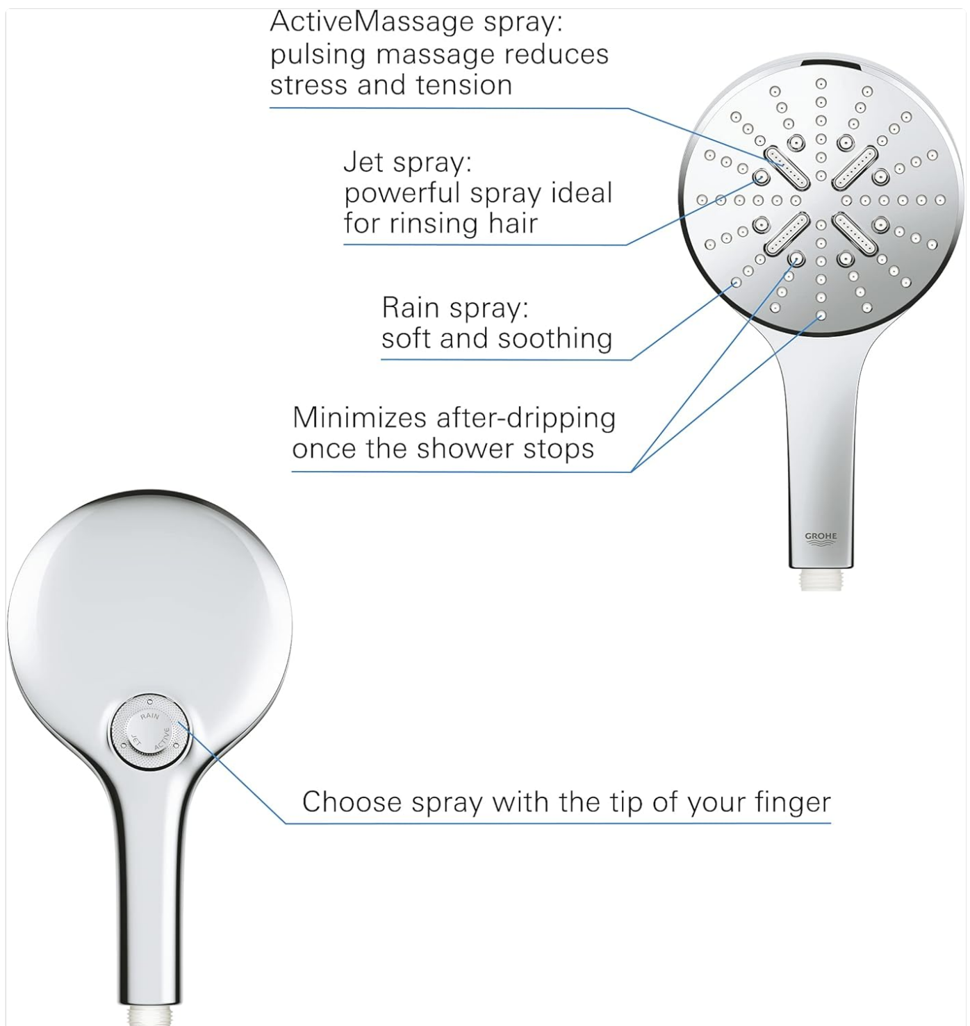
Figure 4: Visual guide to the three spray patterns and SmartTip selection.