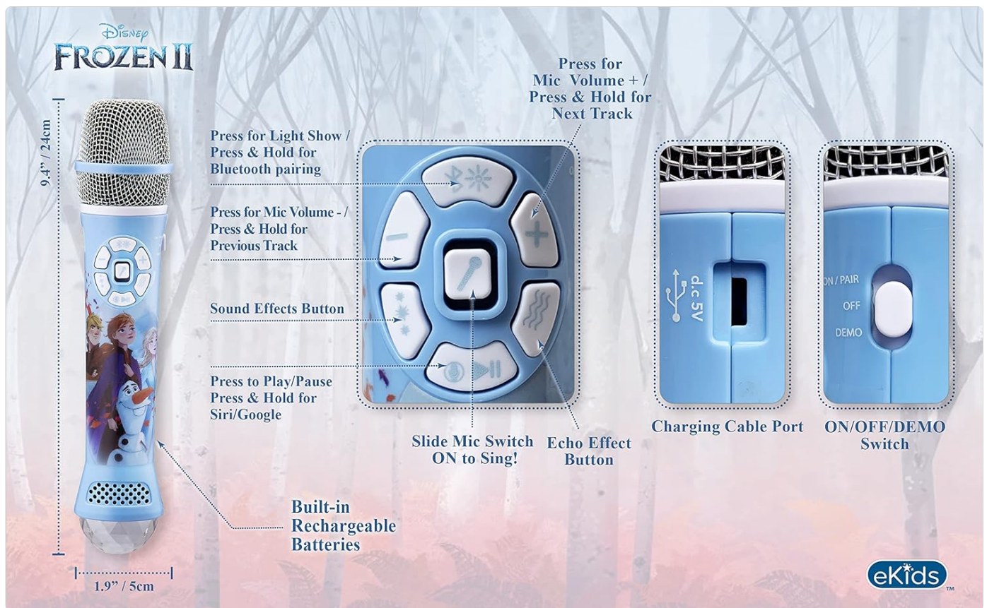
Figure 2: Charging port and power switch location.