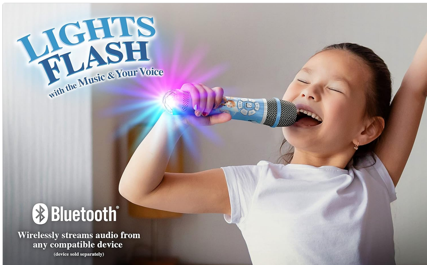
Figure 1: Overview of the eKids Disney Frozen 2 Bluetooth Karaoke Microphone's key features.