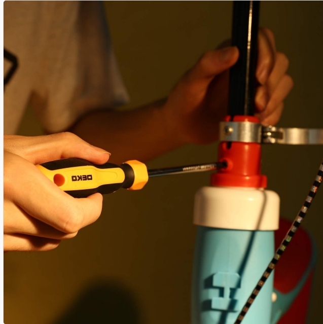
Figure 5: Proper use of a screwdriver for assembly tasks.