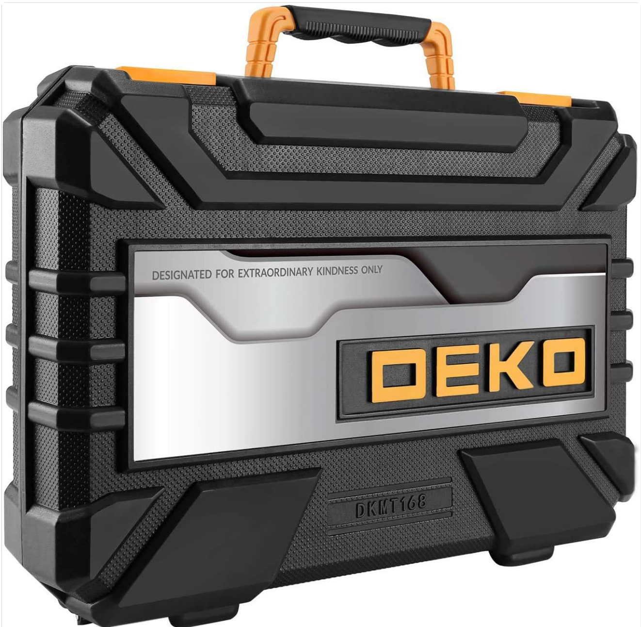
Figure 4: The compact and durable storage case when closed.