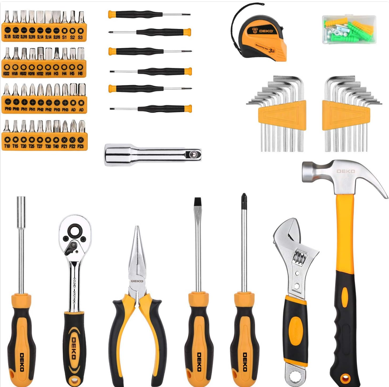
Figure 3: A selection of individual tools from the kit, showcasing their design and finish.