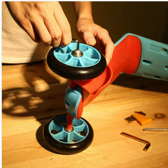
Figure 6: Using a hex key for tightening components.