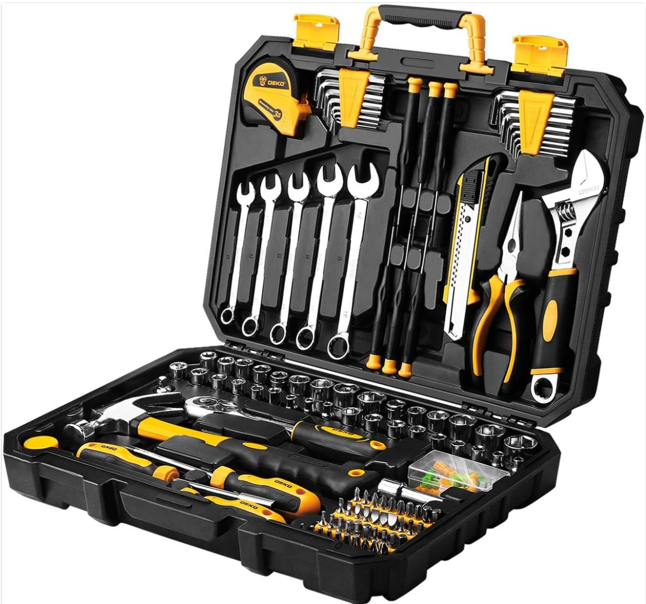
Figure 1: The DEKOPRO 158-Piece Tool Set, open and organized within its robust storage case.