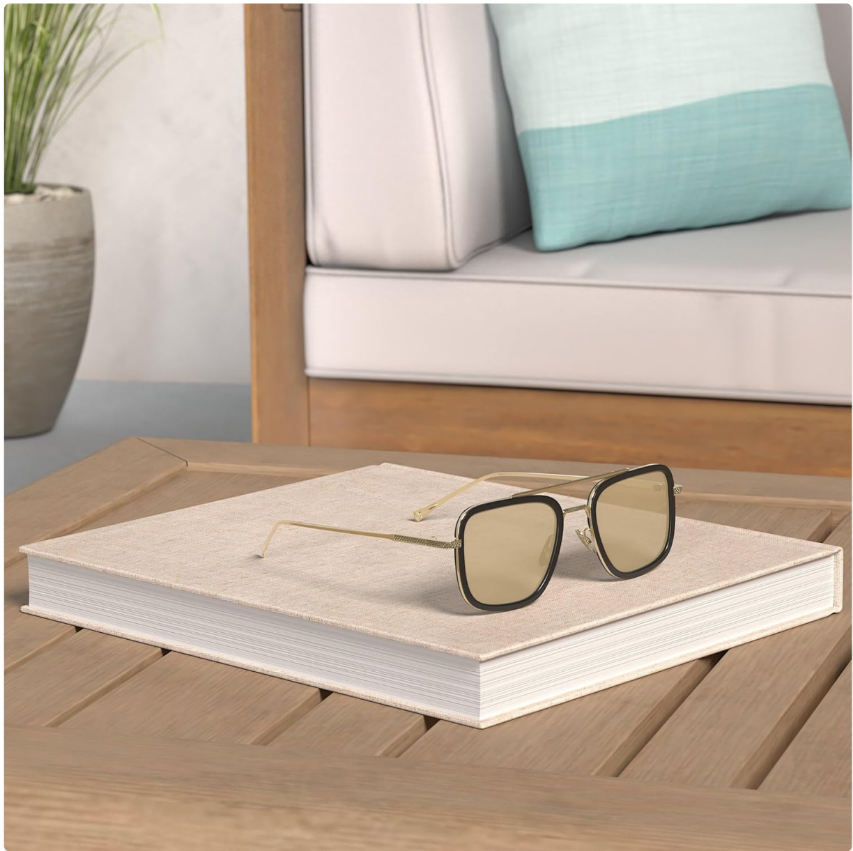
Image: FEISEDY Retro 70s Pilot Sunglasses B2510, showcasing their design on a wooden surface.