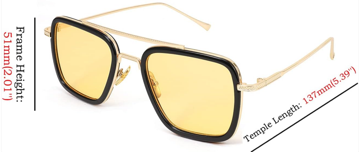
Image: Visual representation of the product dimensions for accurate measurement and fit.