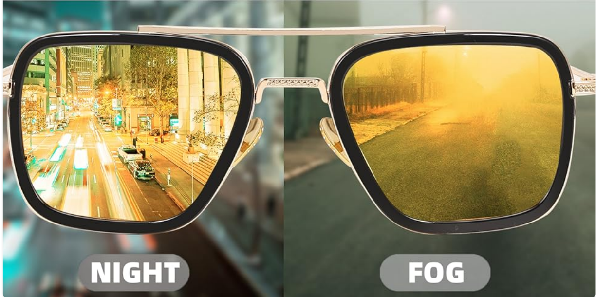
Image: Illustration demonstrating the enhanced visibility provided by the yellow lenses during night and foggy conditions.

Your browser does not support the video tag.