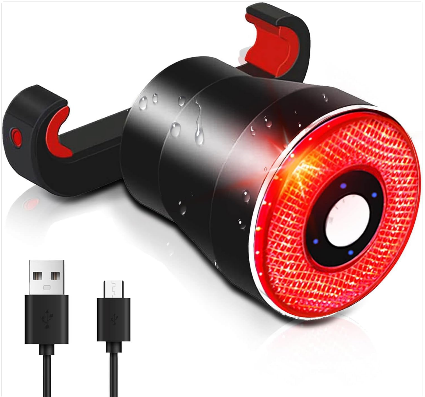
The EBUYFIRE Smart Bicycle Taillight and its included USB charging cables.