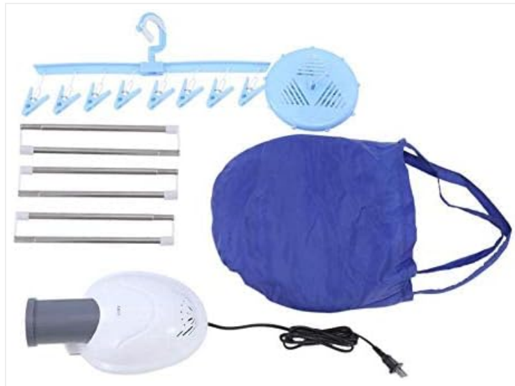
Figure 3.1: Overview of all included components.