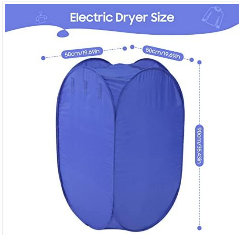
Figure 8.1: Product dimensions.