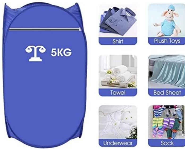
Figure 5.2: Drying capacity and suitable garment types.

Load bearing 5kg, Widely used, put 7 or 8 pieces at a time (Fold the long coat in half)