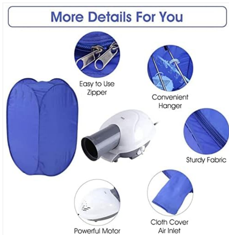
Figure 3.3: Detailed features including zipper, hanger, motor, fabric, and air inlet.