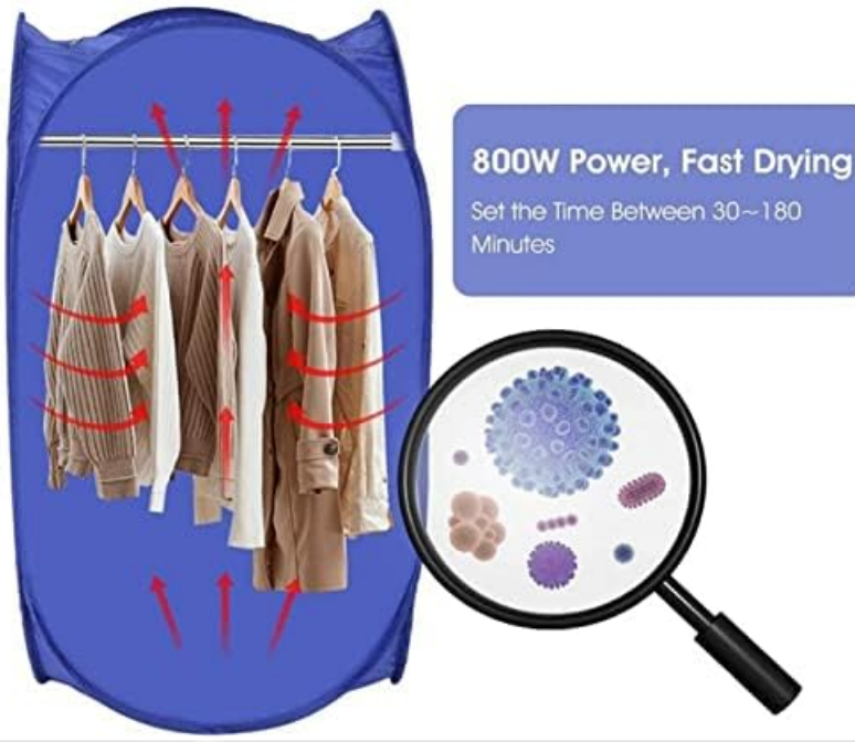
Figure 5.1: Hot air circulation and timer function.