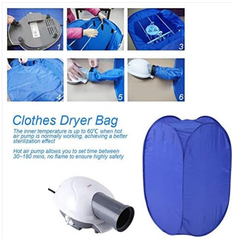
Figure 4.1: Visual guide for dryer assembly.

Your browser does not support the video tag.