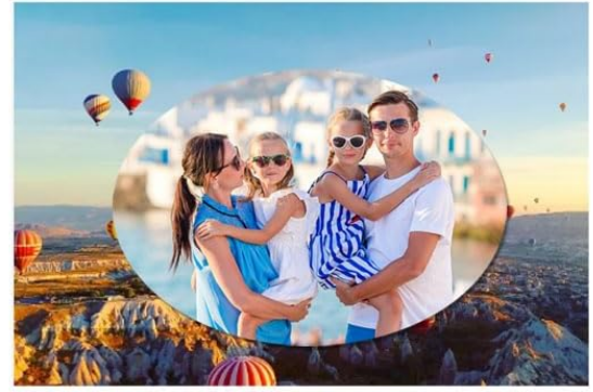
Figure 5: Example of the multi-window display feature, allowing simultaneous viewing of several photos.