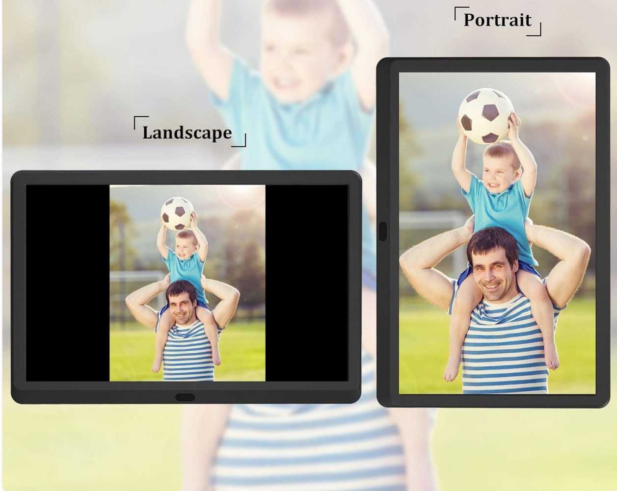
Figure 4: The auto-rotation feature in action, adapting images to the frame's orientation.