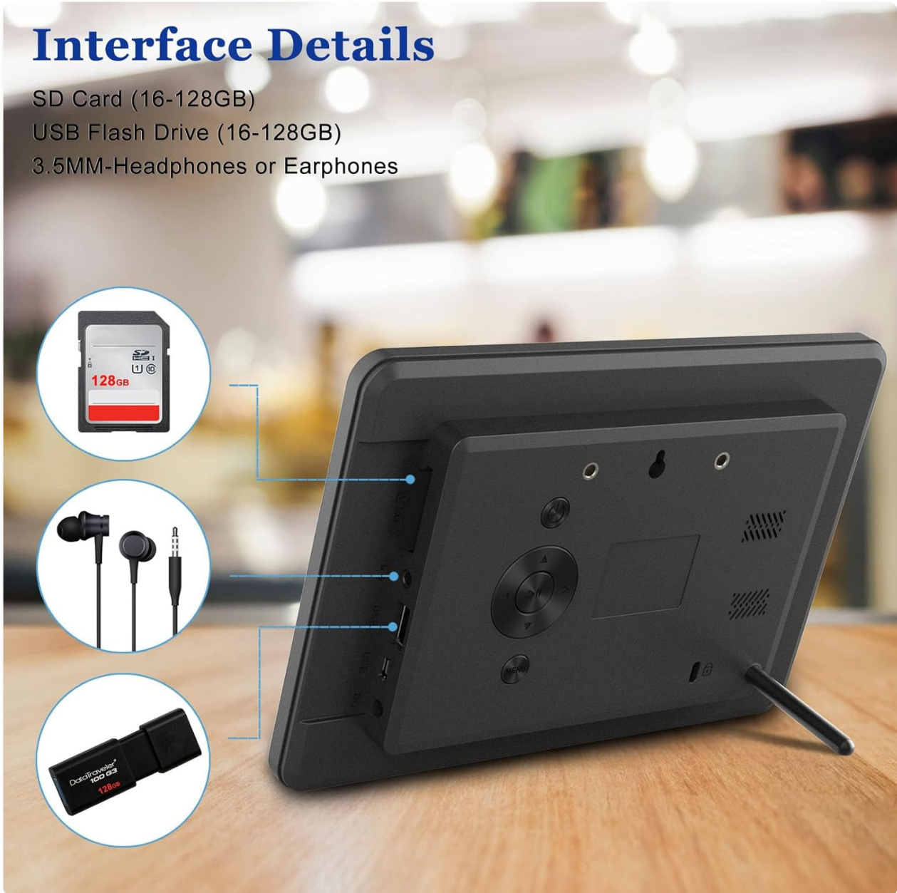
Figure 2: Side view of the digital photo frame highlighting its various ports and connections.