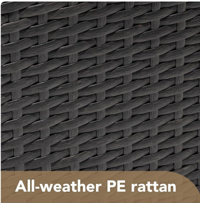
All-weather PE rattan