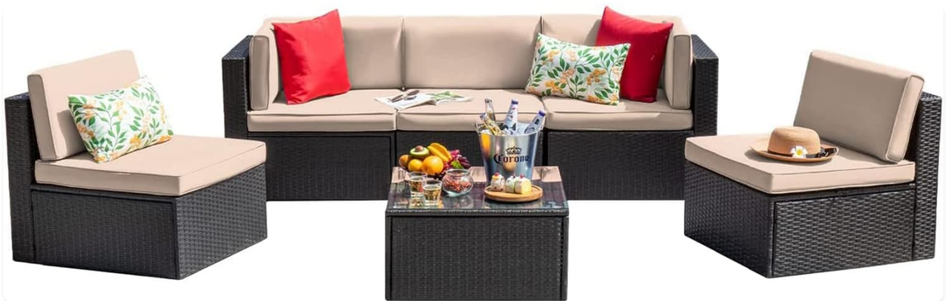
Image: The complete Devoko 6-piece patio furniture set, showcasing the sectional sofa, two single chairs, and a glass-top coffee table, all in a beige and black rattan finish.

The Devoko 6-Piece Outdoor Sectional Rattan Sofa is designed to provide comfortable and versatile seating for your outdoor spaces. This set features a sturdy frame with high-quality PE wicker, thickened water-resistant cushions, and a tempered glass coffee table. Its modular design allows for various configurations to suit different occasions and spaces.