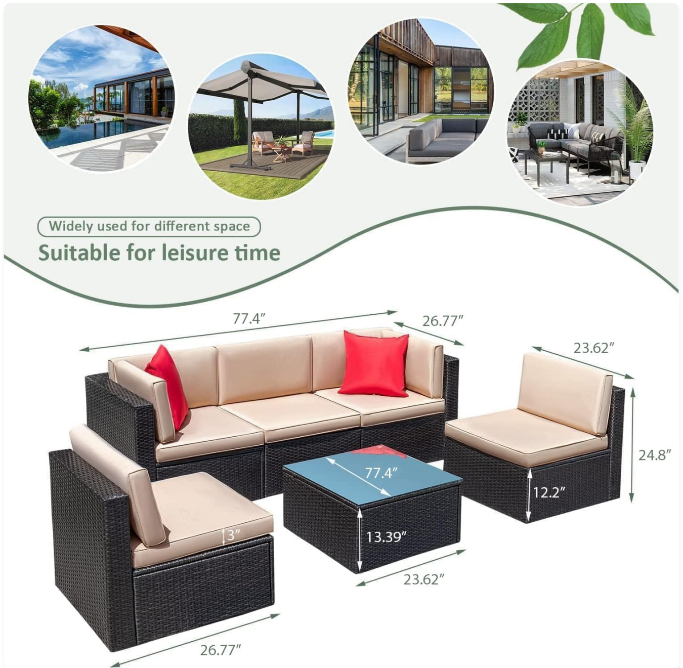
Image: A detailed diagram illustrating the dimensions of each component of the patio furniture set, including the sofa sections and coffee table.

Note: The set may arrive in 3 or 4 boxes. If blue cushions are received, a separate package with beige cushion covers will be included for replacement.