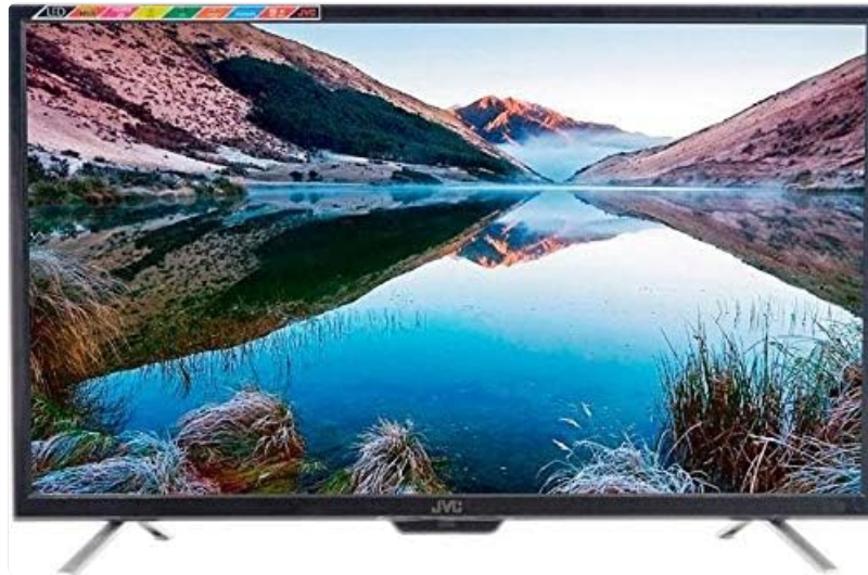
Image: Front view of the JVC 32 Inch LED Standard TV (Model LT-32N355) with its stand attached, displaying a scenic landscape.