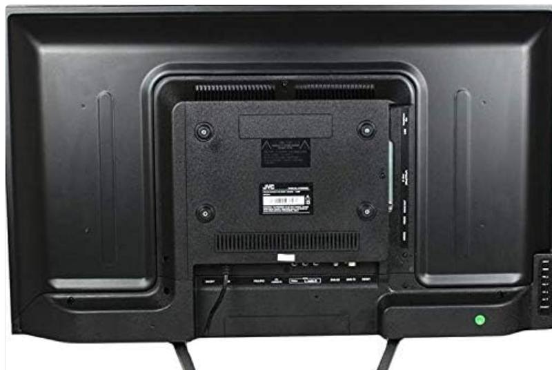
Image: Rear view of the JVC 32 Inch LED Standard TV, highlighting the various input and output ports for connectivity.

The TV features various input ports for connecting external devices. Refer to the rear view image for port locations.