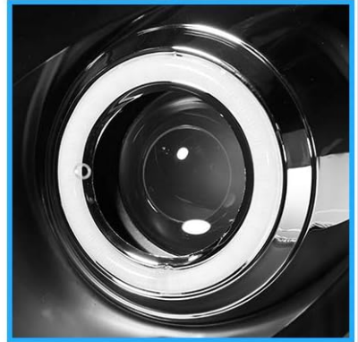
Image 4.2: Detailed views of LED halo, DOT marking, and projector lens.