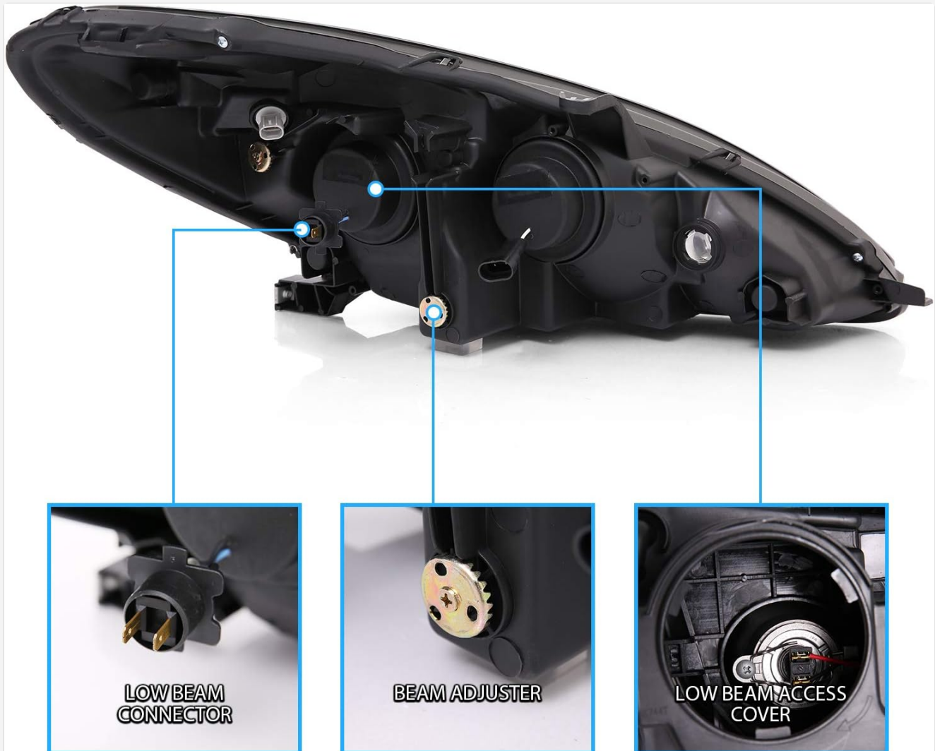
Image 6.1: Rear view with Low Beam Connector, Beam Adjuster, and Low Beam Access Cover.

The headlight beam can be adjusted to ensure proper alignment and optimal visibility. Locate the adjustment knob on the rear of the headlight assembly.