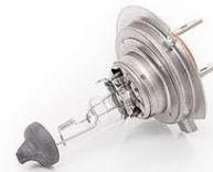
Low Beam H7 Halogen Bulb