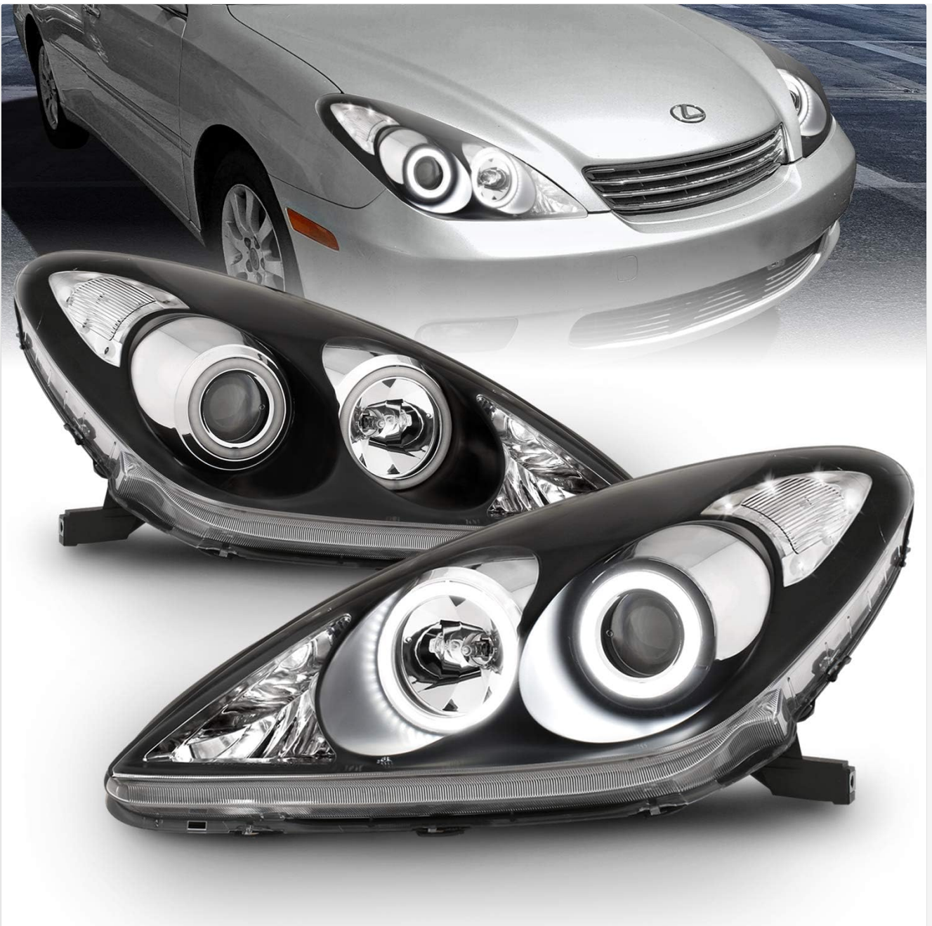
Image 1.1: AmeriLite Black Projector LED Halo Headlights for Lexus ES 300/330.