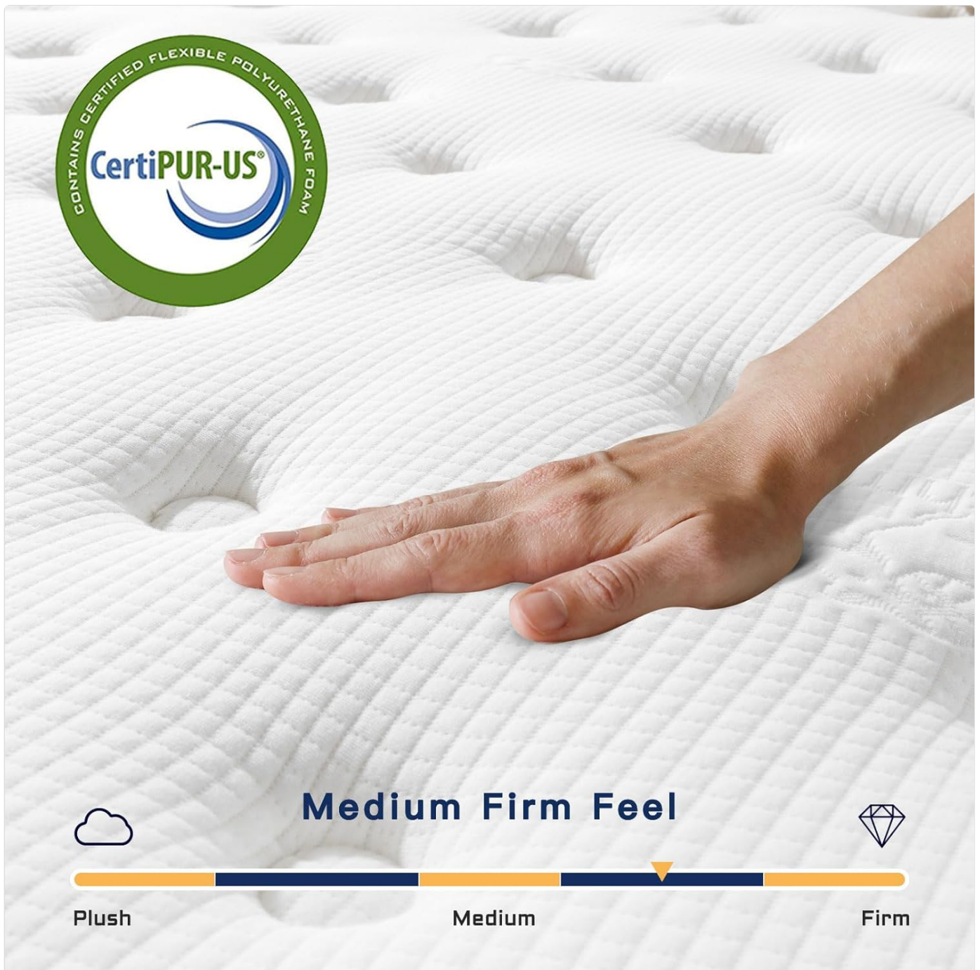
Image: A hand pressing on the mattress surface, indicating a medium-firm feel. The CertiPUR-US logo is visible, signifying certified flexible polyurethane foam.