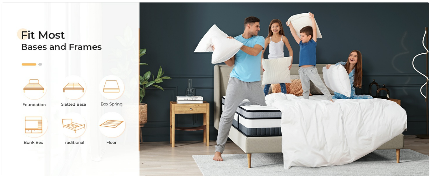
Image: An illustration showing various types of bed bases and frames compatible with the Vesgantti mattress, including foundation, slatted base, box spring, bunk bed, traditional, and floor.