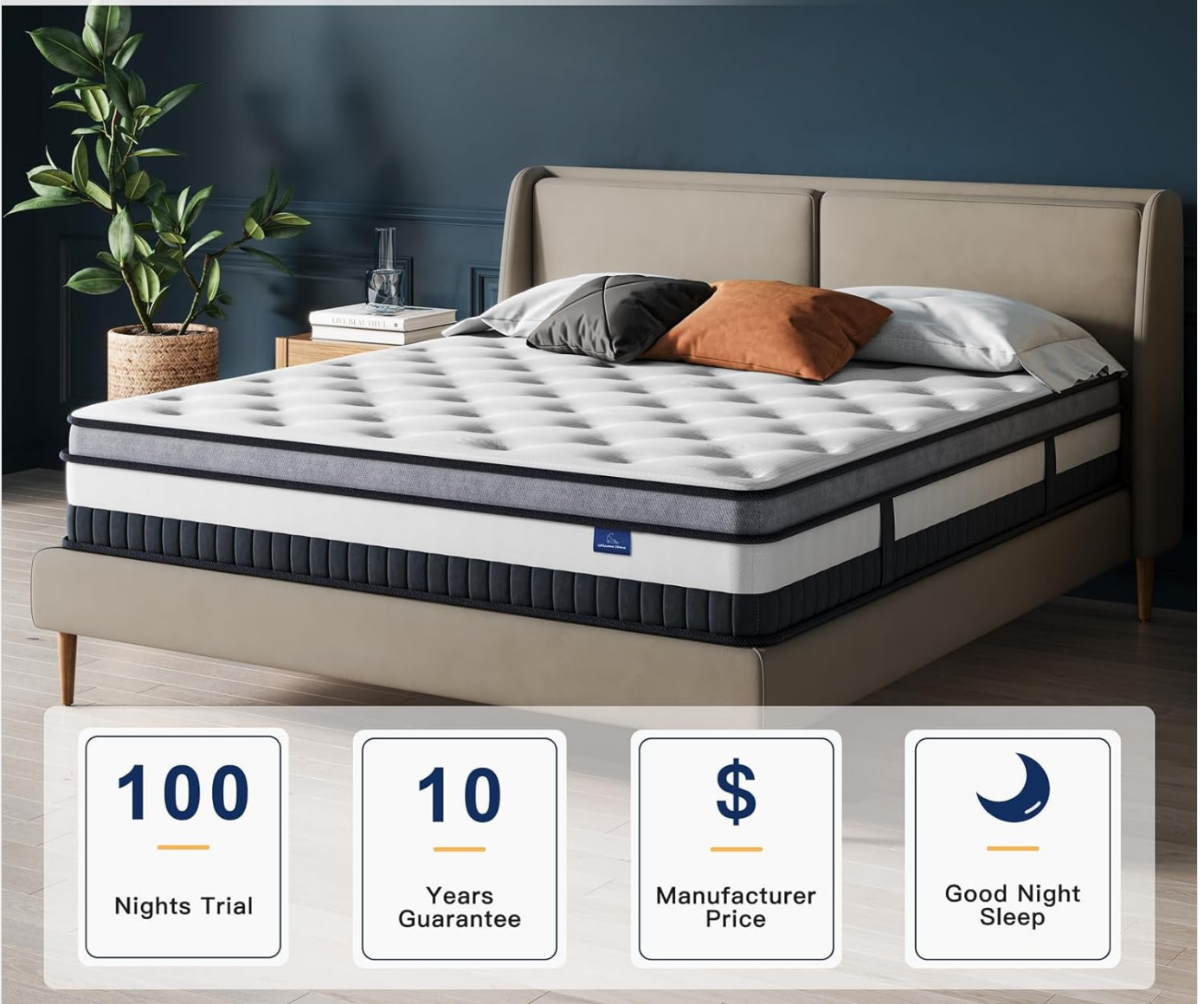
Image: An image highlighting key benefits including '100 Nights Trial', '10 Years Guarantee', 'Manufacturer Price', and 'Good Night Sleep'.