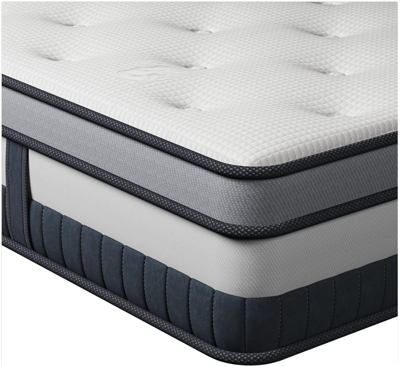
Image: The Vesgantti Queen 10-Inch Hybrid Mattress, showcasing its layered design and quilted top.