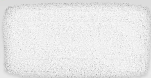
MICROFIBER SOFT PAD