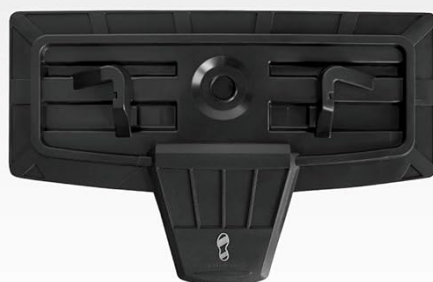
DETACHABLE MOP PAD TRAY

This image displays the included accessories: one microfiber soft pad, one microfiber scrubby pad, and a detachable mop pad tray, essential for the steam cleaning function.