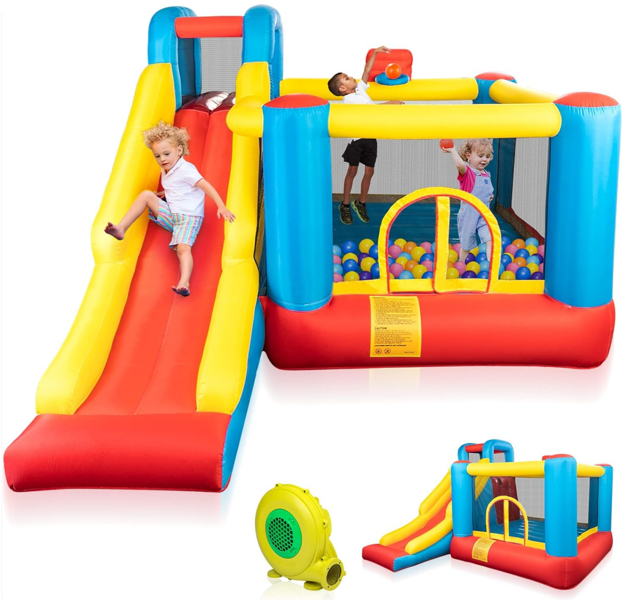
Image 1: Overview of the JOYMOR Inflatable Bouncing Castle Play Center.