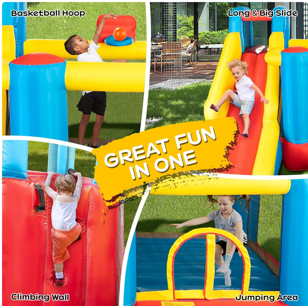
Image 3: Detailed view of the play center's multiple activity zones.