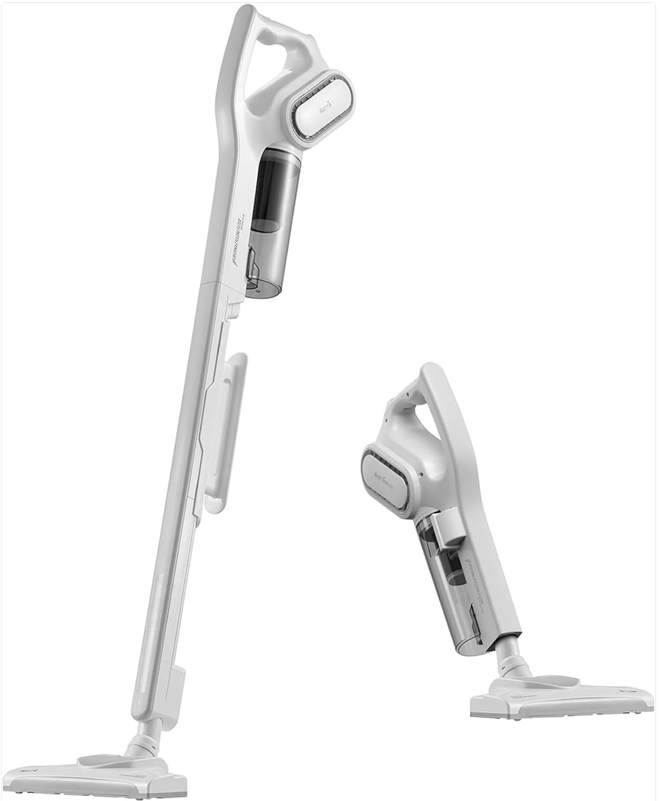
Figure 2.2: A side view of the Deerma DX700 vacuum cleaner, illustrating its sleek design and the transition between vertical and handheld modes.