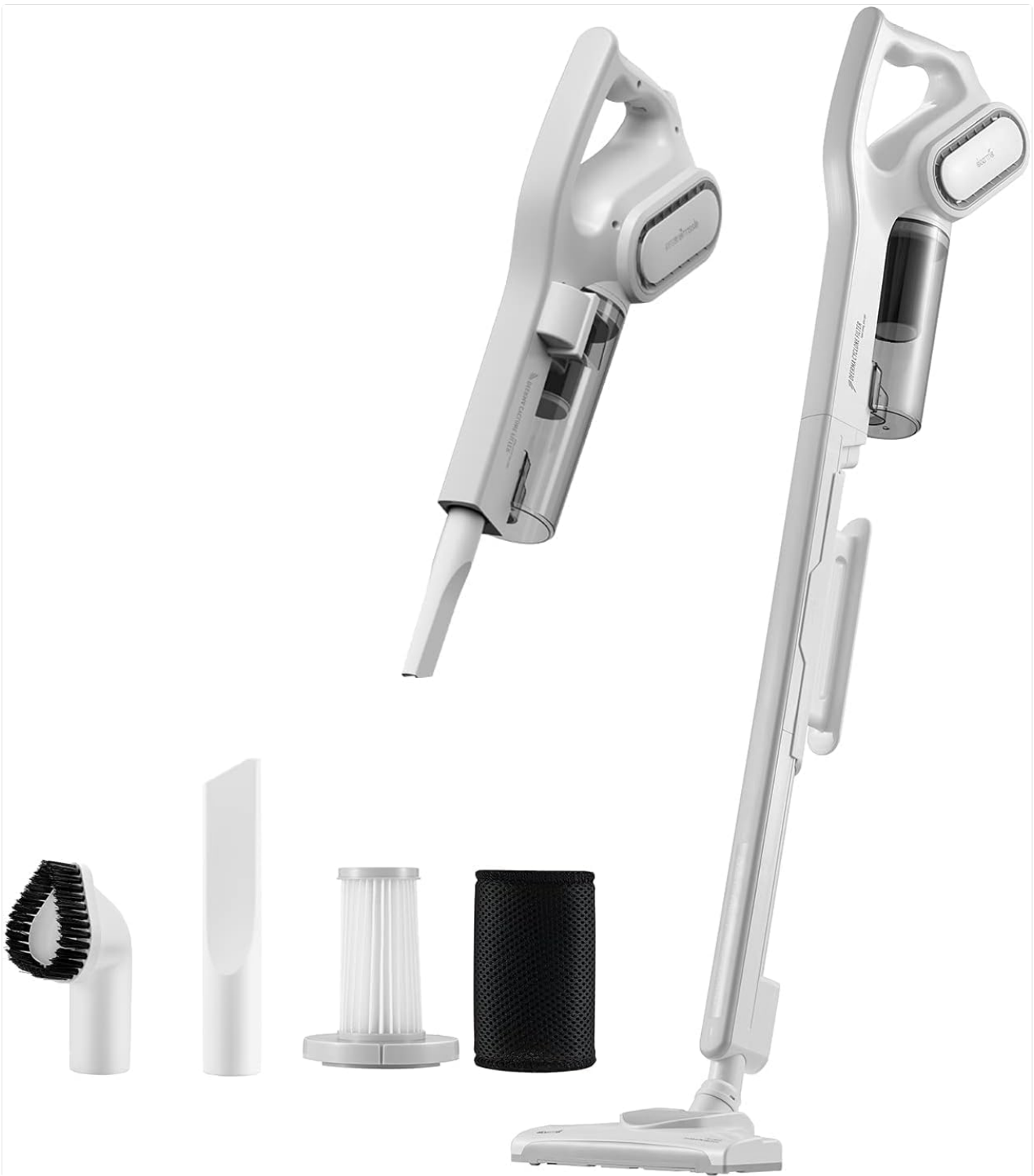
Figure 2.4: The Deerma DX700 vacuum cleaner displayed with its included accessories, such as the brush nozzle, flat nozzle, and filter components, ready for various cleaning tasks.