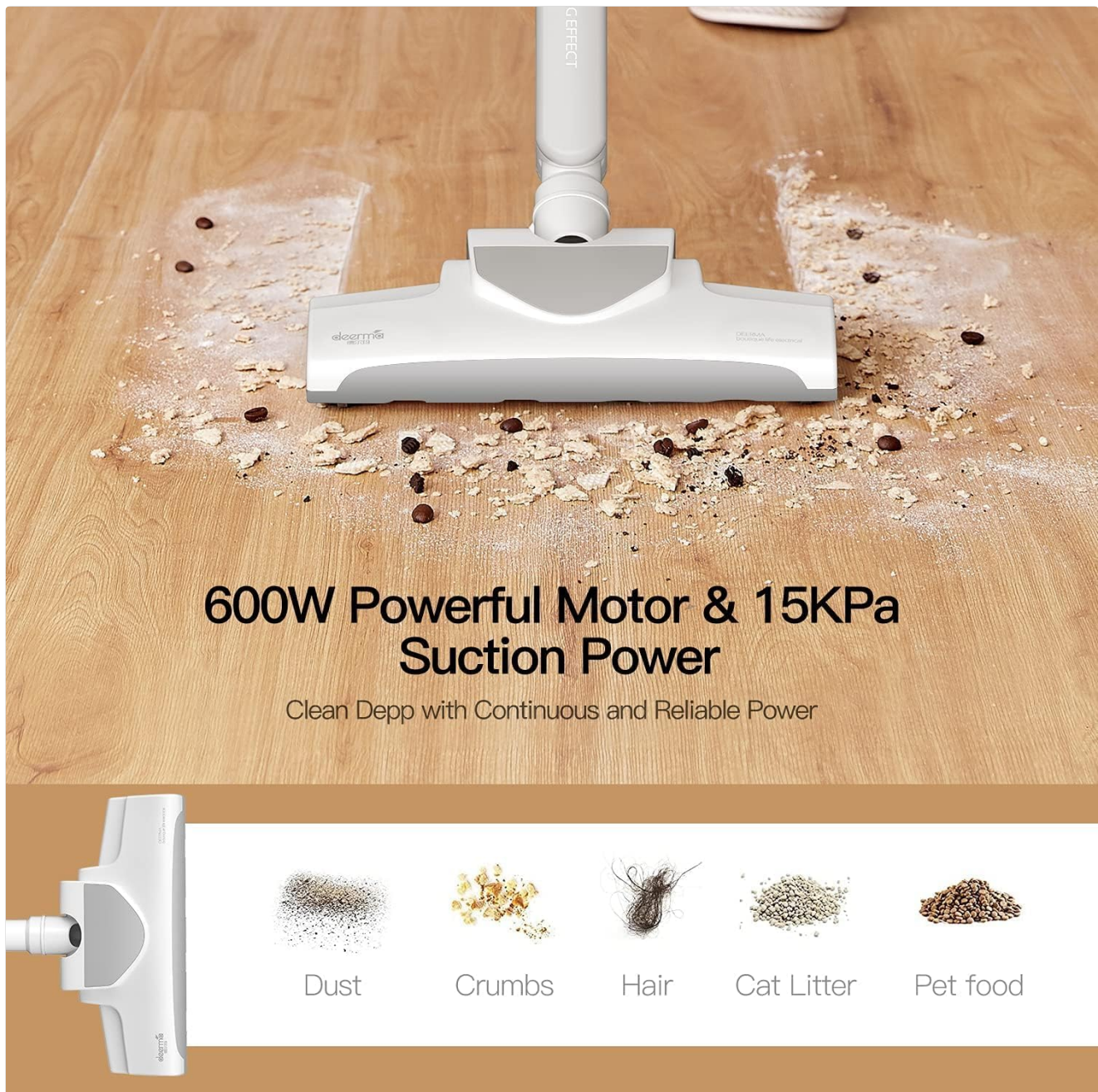
Figure 4.3: An illustration of the Deerma DX700's powerful suction, showing its effectiveness on various debris types including dust, crumbs, hair, cat litter, and pet food on a hard floor surface.