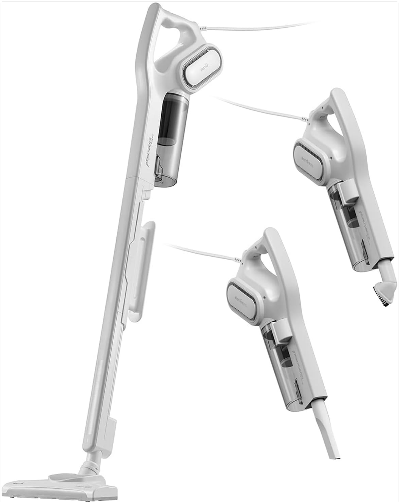
Figure 2.1: The Deerma DX700 vacuum cleaner showcasing its vertical and handheld configurations, highlighting its adaptability for different cleaning needs.