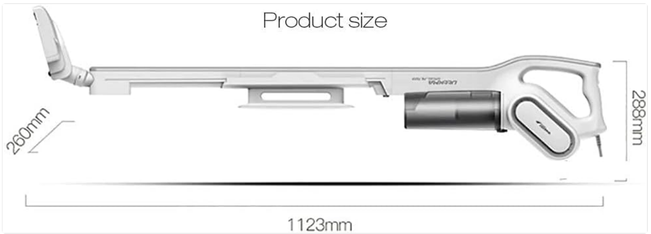
Figure 2.3: Diagram showing the precise dimensions of the Deerma DX700 vacuum cleaner, including its length (1123mm) and height (288mm), useful for storage and understanding its compact design.