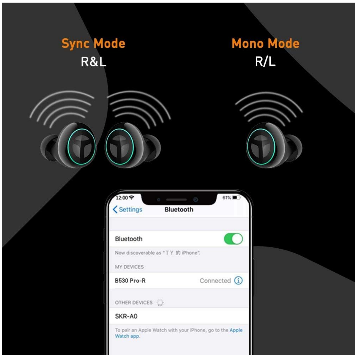
Image: Illustration showing TRANYA B530 earbuds in both Sync Mode (stereo) and Mono Mode (single earbud), with a smartphone screen displaying successful Bluetooth pairing.