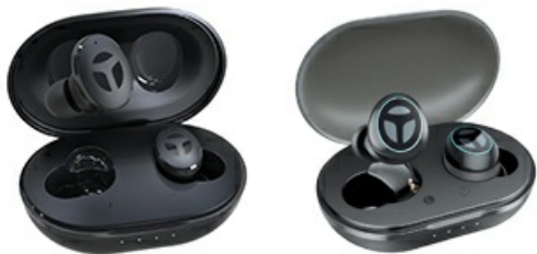
Image: Micro USB charging cable and various sizes of silicone eartips included in the package.