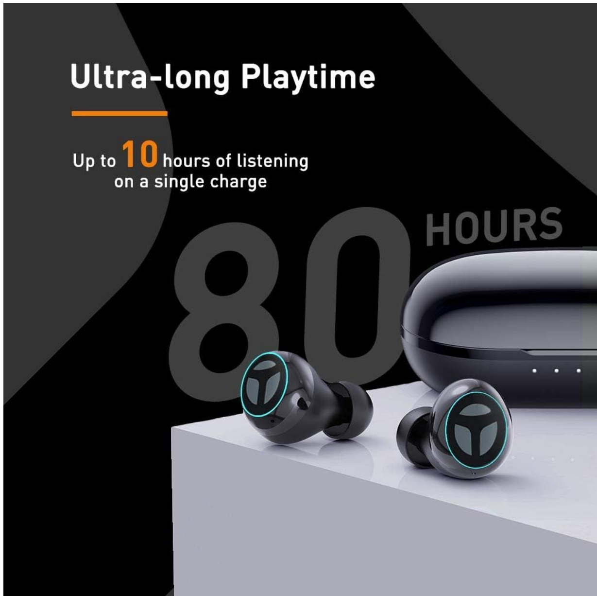
Image: TRANYA B530 earbuds shown with their charging case, highlighting the ultra-long playtime of up to 80 hours.