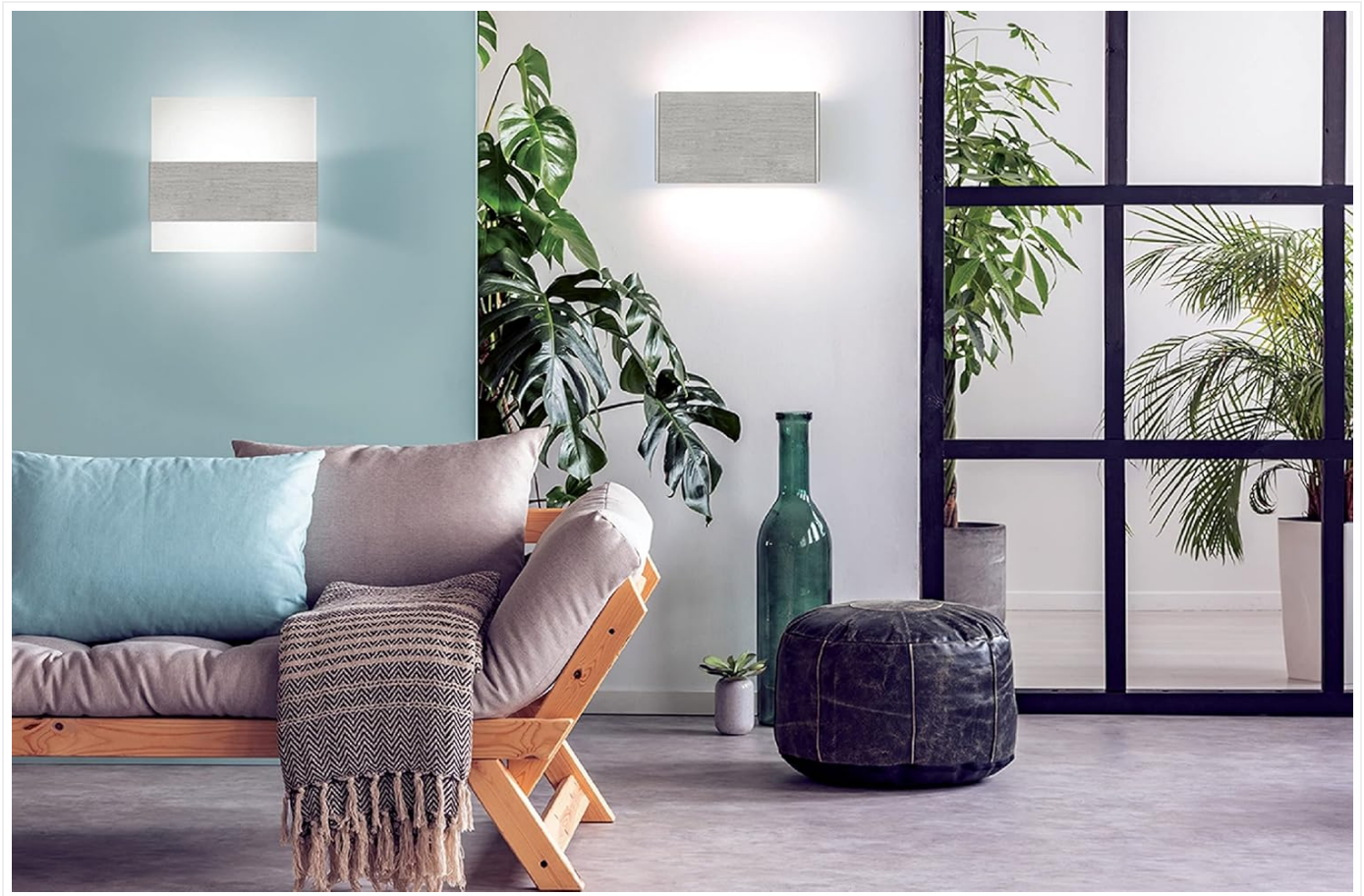
Figure 3: EGLO LED Wall Light 204077A in a modern living room. This image shows the wall light installed in a contemporary interior, demonstrating its aesthetic integration and lighting effect.

Manufacturer's Warranty: All EGLO products are covered under a 1-year warranty from the date of original shipment when purchased on Amazon. This warranty covers items and conditions identified in the original manufacturer's warranty. Exclusions include loss and theft, water damage, customer abuse, and finish deterioration due to UV or coastal exposure. Replacement Parts Policy: A 30-day replacement parts policy is provided to ensure a fully working item upon receipt. For support or warranty claims, please contact EGLO customer service or refer to the official EGLO website for contact information. You may also visit the EGLO Store on Amazon for additional product information.