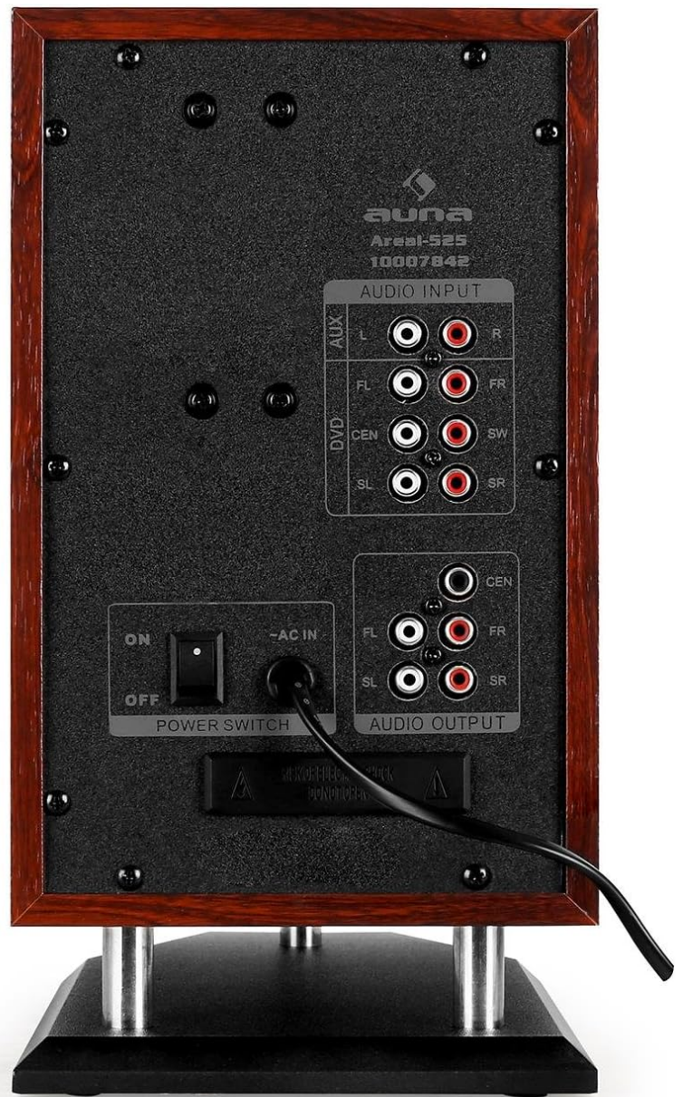
Figure 4.4: Rear panel of the AUNA Areal Active 525-5.1 Subwoofer. This image details the various audio input and output ports, including AUX, DVD (5.1), and the RCA outputs for connecting the satellite speakers, along with the power switch and AC input.