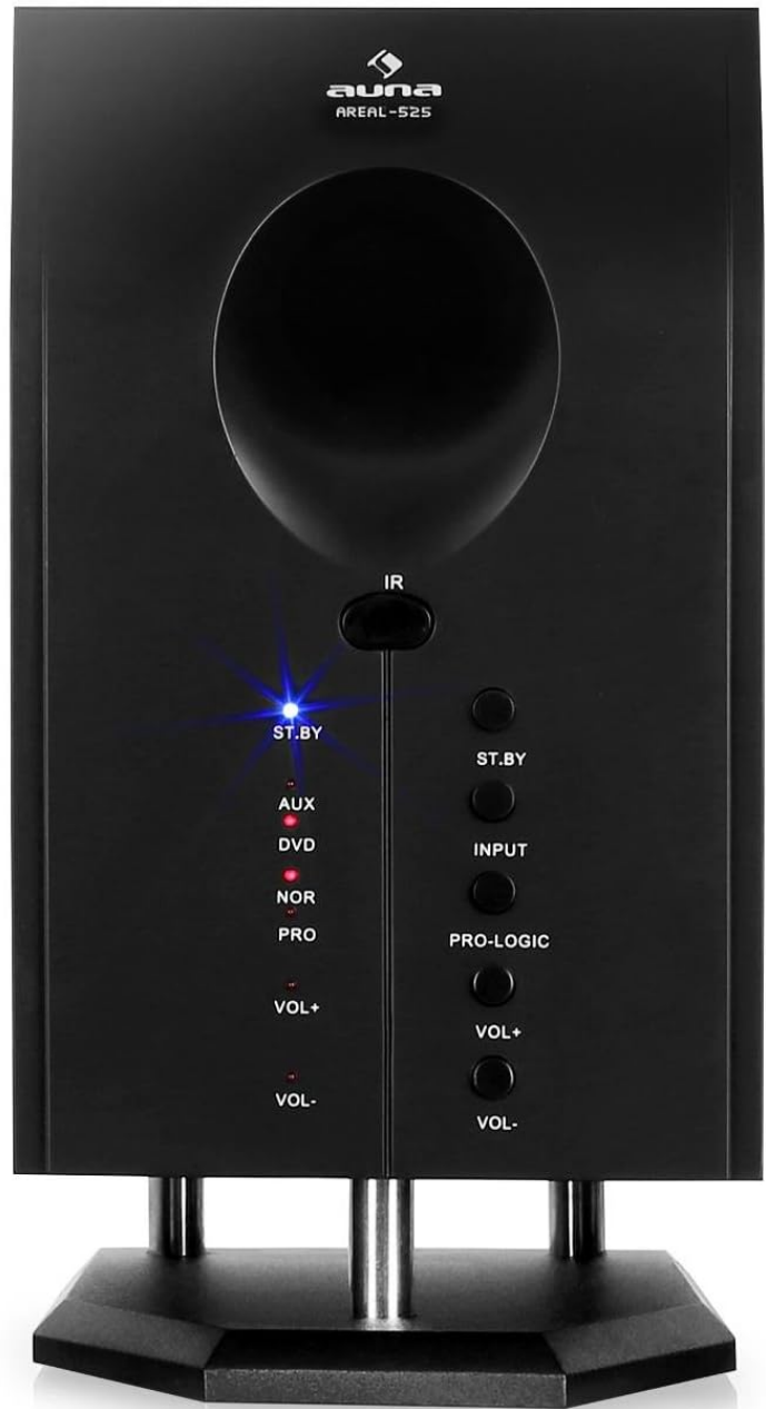
Figure 4.3: Close-up of the AUNA Areal Active 525-5.1 Subwoofer front panel. This view highlights the control buttons and indicators, including standby, input selection, volume controls, and the Pro-Logic mode button.

Subwoofer with low-vibration bass-reflex enclosure