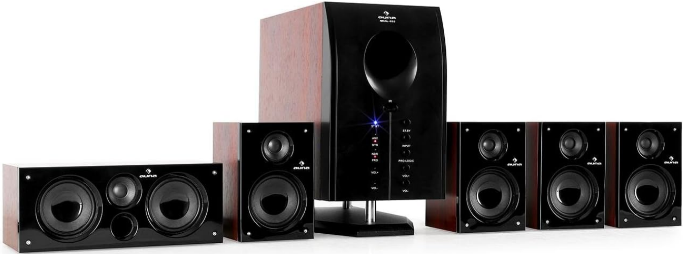
Figure 4.1: Complete AUNA Areal Active 525-5.1 Surround Sound System. This image shows the central subwoofer unit along with the five satellite speakers, illustrating the full setup of the home theater system.