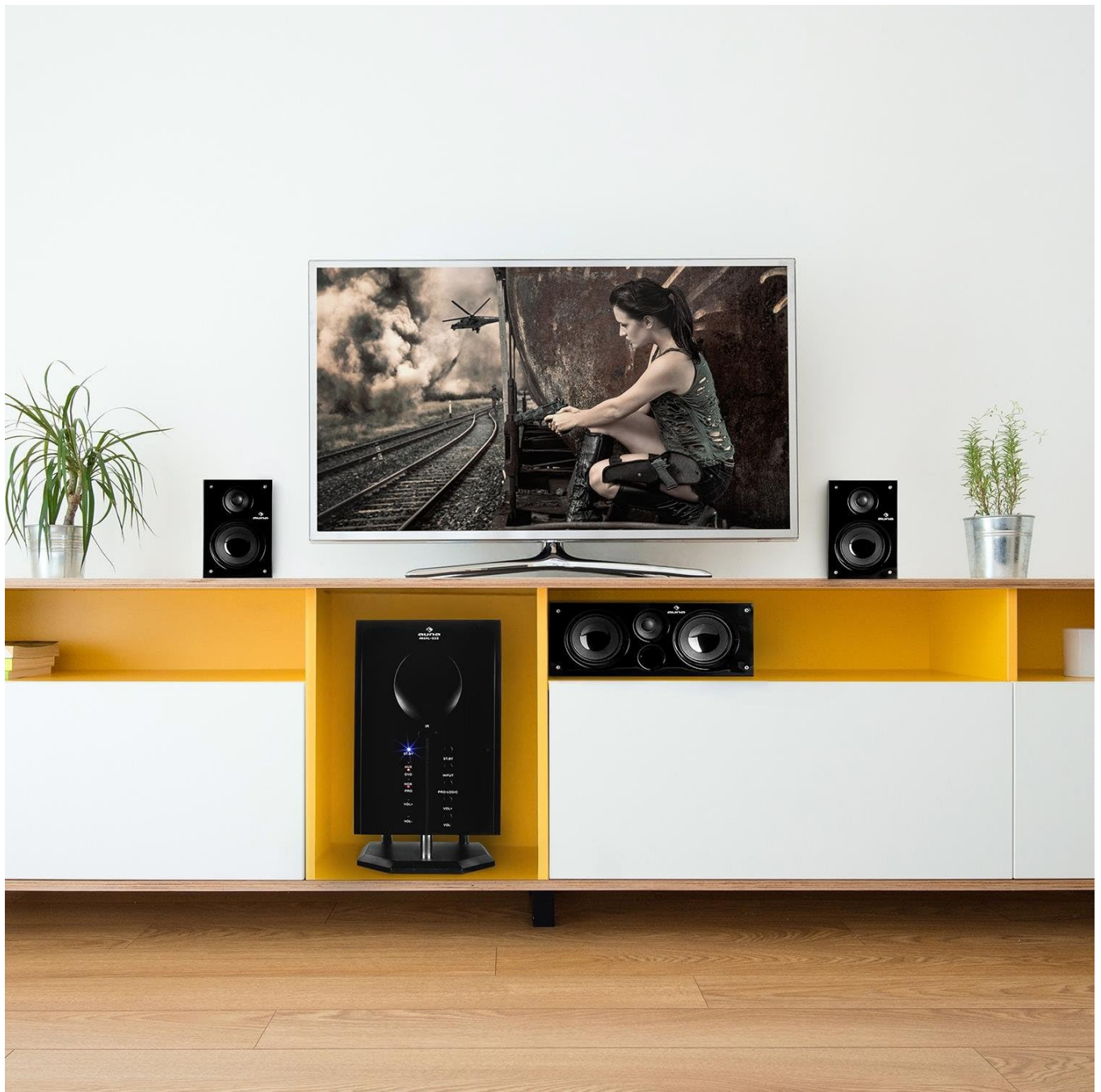
Figure 4.2: AUNA Areal Active 525-5.1 System integrated into a living room environment. The subwoofer is placed below a television, with two satellite speakers positioned on either side, demonstrating a typical home theater arrangement.