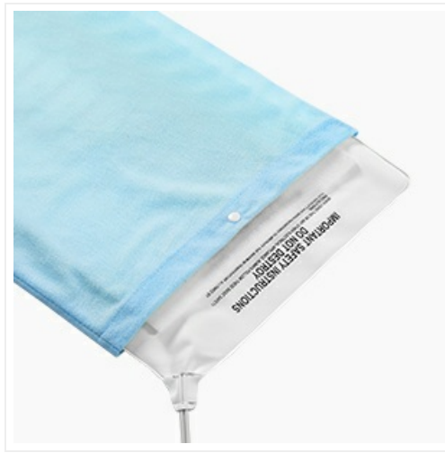
Image 2.2: The internal vinyl envelope and absorbent sponge for moist heat application.