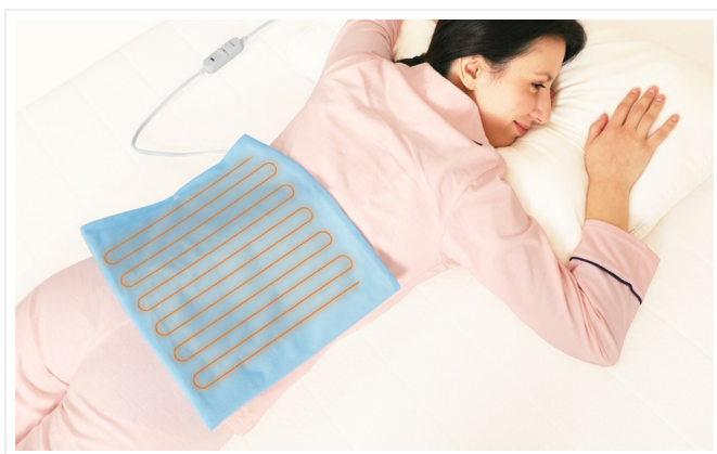
Image 4.6: Internal heating element design for even heat distribution.