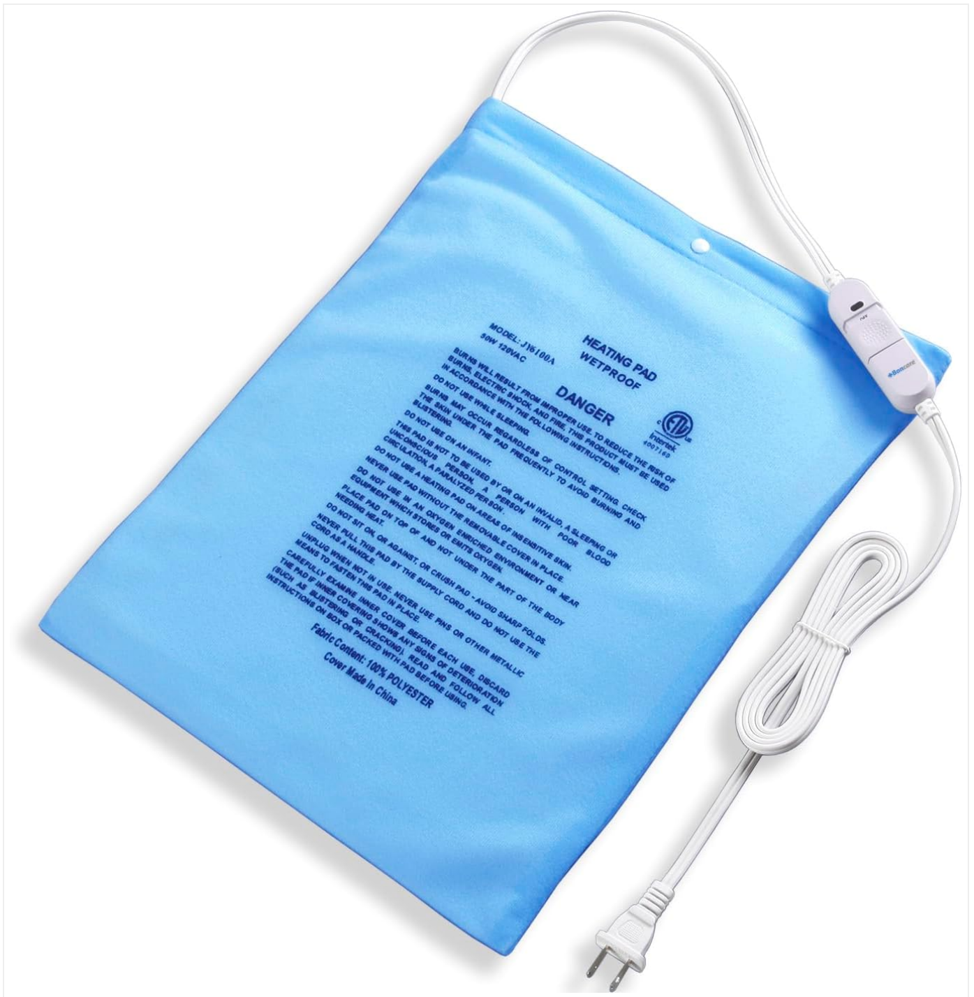
Image 2.1: The Boncare Small Heating Pad, showing its compact size, attached controller, and power cord.

The heating pad measures approximately 12 inches by 15 inches, making it suitable for various body areas. It includes an absorbent sponge for moist heat therapy, which can provide deeper heat penetration.