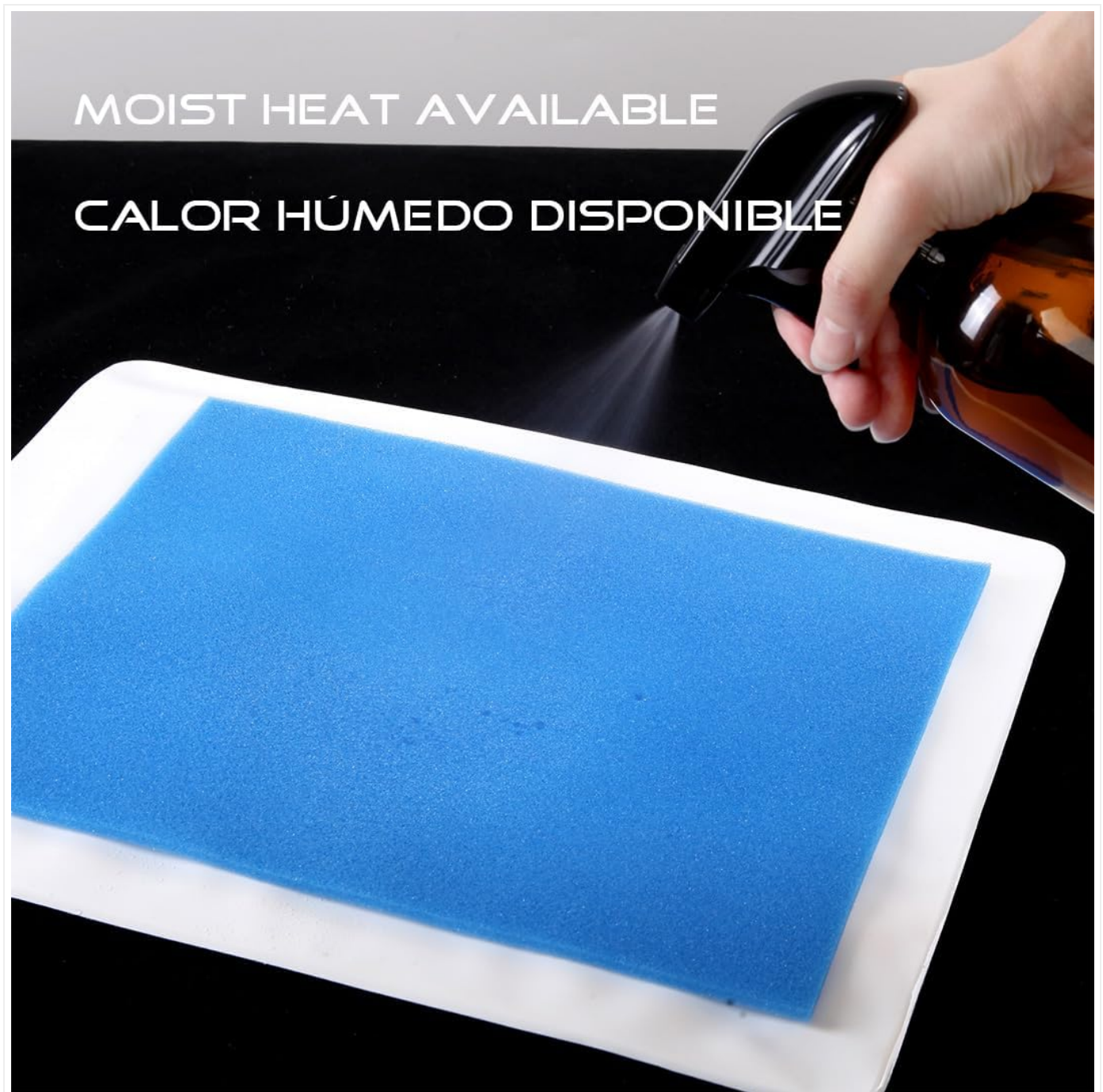
Image 4.2: Dampening the absorbent sponge for moist heat application.